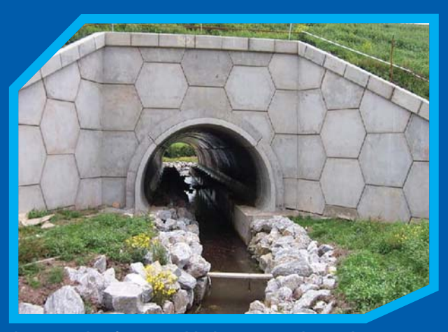
An example of mammal ledges on a culverted stream under a road

The National Roads Authority have published guidelines which aim to minimize the number of otters killed on our roads. Recommended measures include constructing special otter ledges where rivers and streams flow under new roadways.