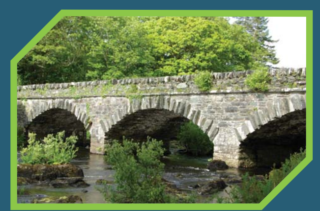
Bridges are good places to look for otter signs.

Records of otters found dead on the road should be submitted to the Roadkill project on www.biology.ie