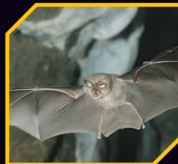
Lesser horseshoe bat