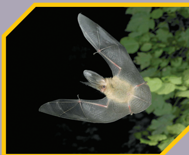
Brown long-eared bat