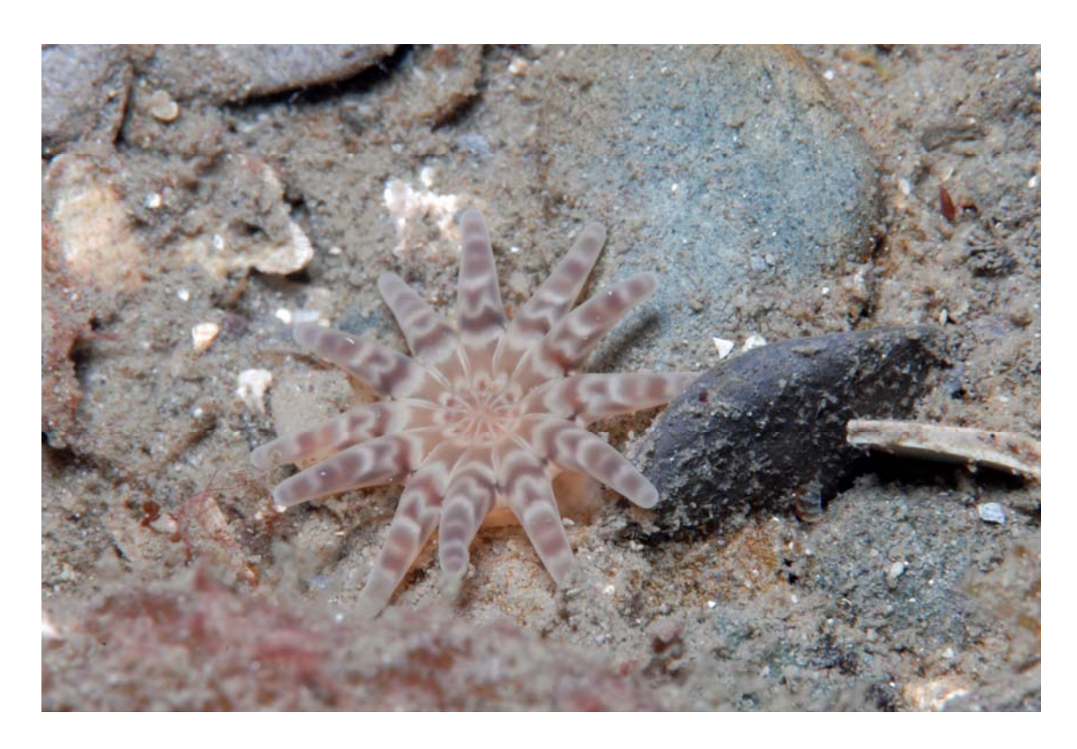
Figure 4.9 Halcampa chrysanthellum in Valentia Harbour on muddy sand with occasional pea sized gravels