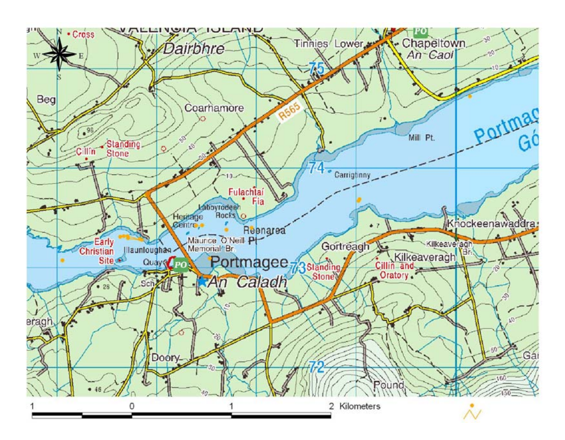
Figure 4.2 Location of all E. delapiae survey dives carried out in the Portmagee Channel area

Ordnance Survey Ireland Licence No EN 0059208 \odot Ordnance Survey Ireland / Government of Ireland. Data supplied under third party licence by the Department of Environment, Heritage and Local Government