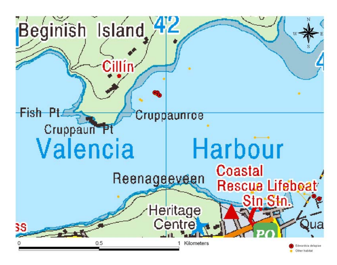
Figure 4.3 Location of E. delapiae recorded during the survey