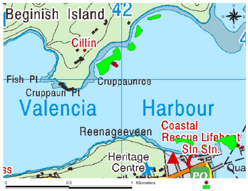
Figure 4.4 Location of E. delapiae recorded during the survey, shown in relation to seagrass Zostera marina beds.

Ordnance Survey Ireland Licence No EN 0059208 © Ordnance Survey Ireland / Government of Ireland. Data supplied under third party licence by the Department of Environment, Heritage and Local Government