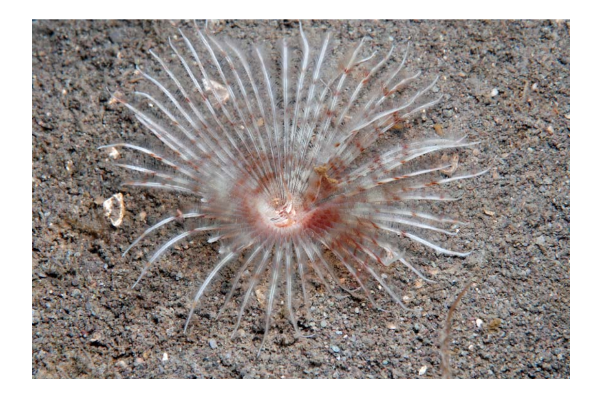
Figure 4.12 Megalomma vesiculosum on muddy sand, Valentia Harbour