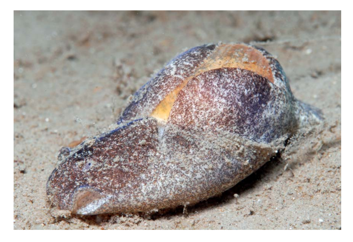
Figure 4.8 Haminoea navicula in Valentia Harbour on muddy sand substrate