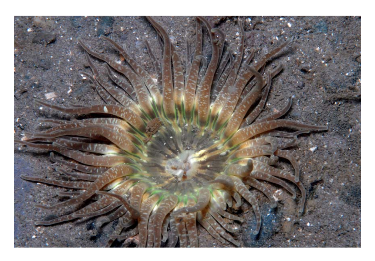
Figure 4.11 Anthopleura ballii on muddy sand, Valentia Harbour