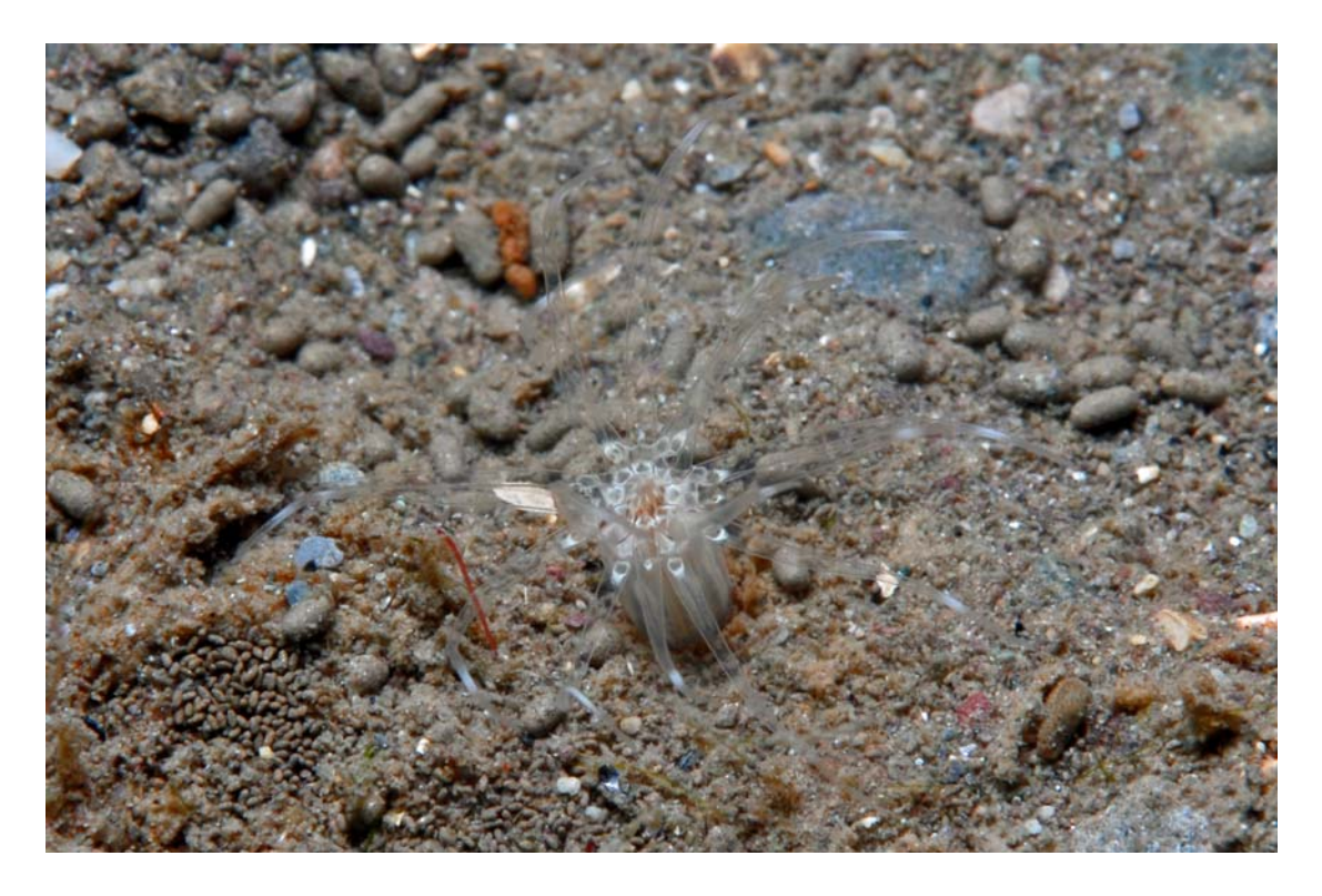
Figure 4.6 Image taken with 105mm lens (160mm digital) of E. delapiae . The identifying 'peacocks' tail' marking close to the base of each tentacle can be clearly seen.