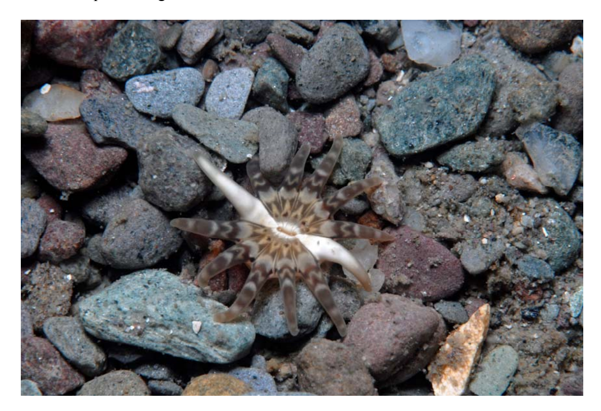
Figure 4.10 Halcampa chrysanthellum in Valentia Harbour on muddy sand with pea gravel veneer