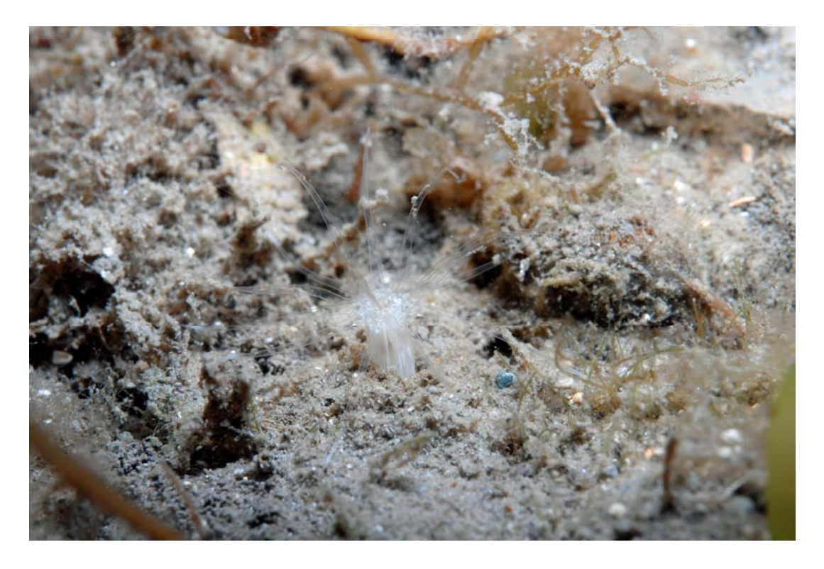
Figure 4.5 Edwardsia delapiae on muddy sand close to Zostera marina bed at Beginish Island