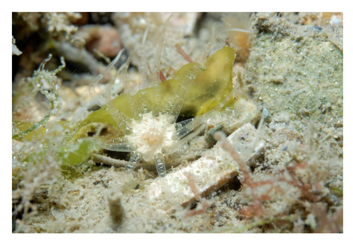
Figure 4.7 Edwardsia claperedii close to Zostera marina bed at Beginish Island