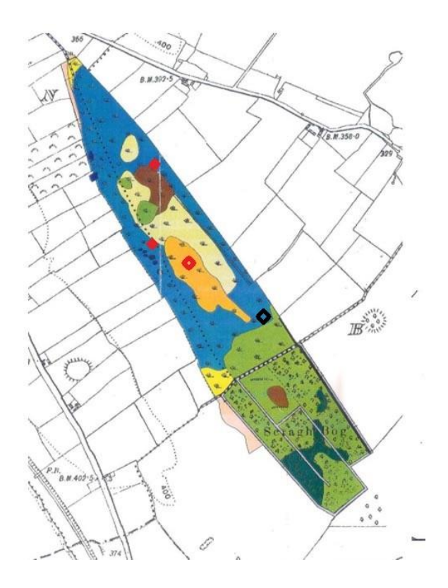
Figure 3. Distribution of the wetland beetle Stenus glabellus (Coleoptera, Staphylinidae) at Scragh Bog, Co Westmeath. Red diamonds indicate present survey and black diamond the possible location from earlier surveys.