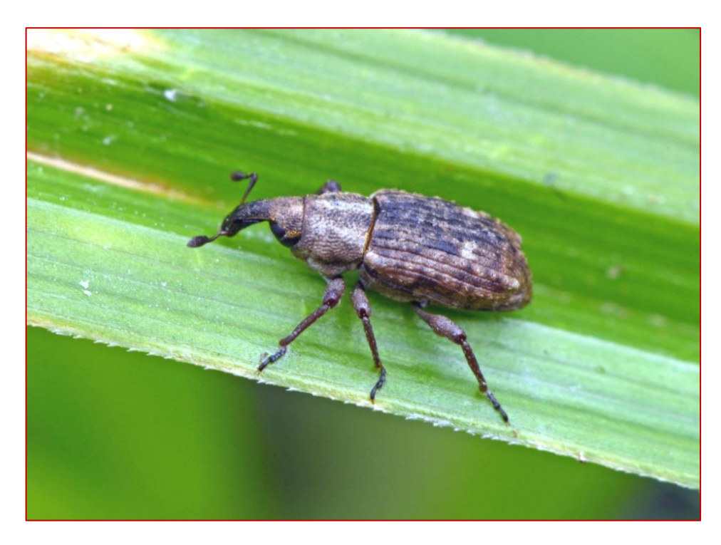
Plate 3: The wetland weevil Bagous lutosus (Coleoptera: Curculionidae), Scragh Bog, Co Westmeath.