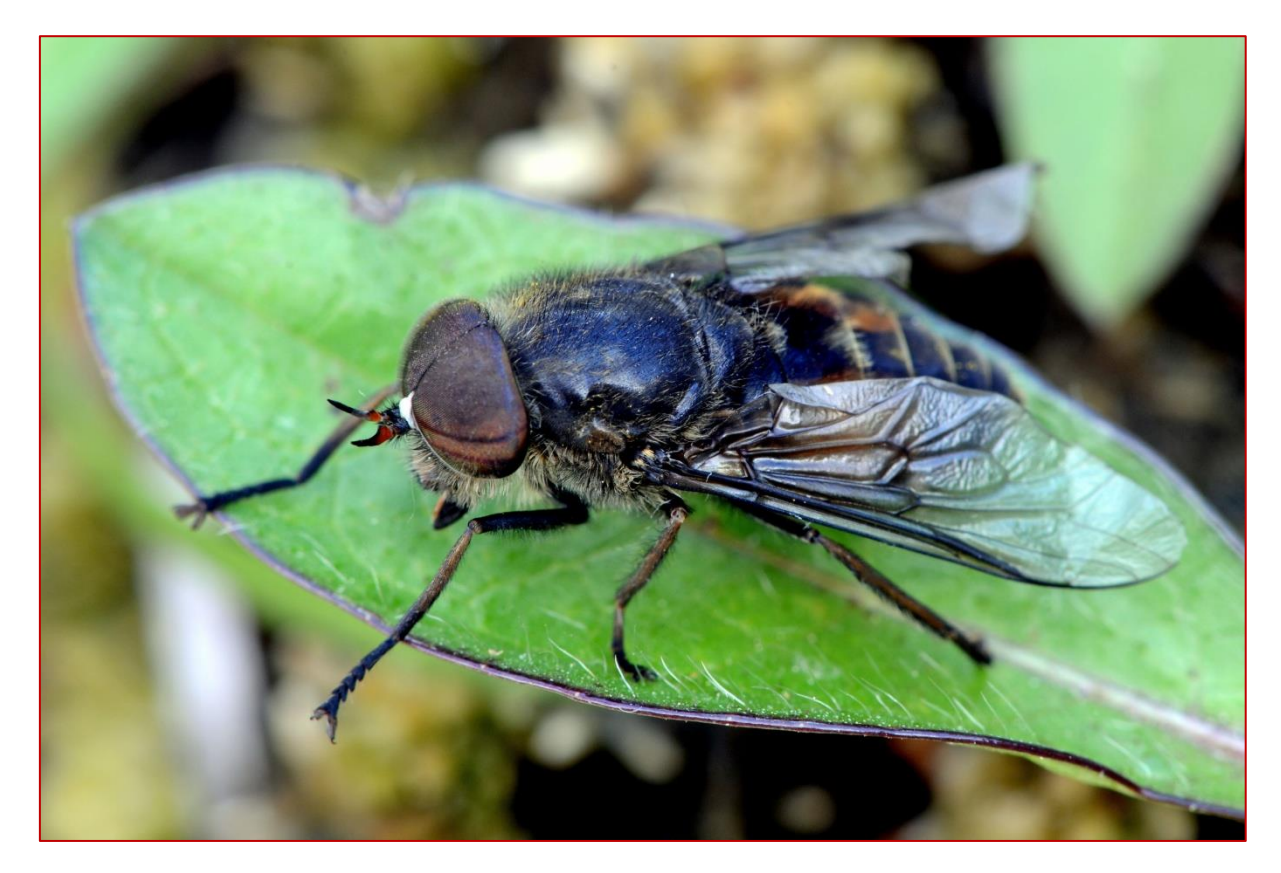
Plate 2: The horsefly Hybomitra bimaculata (Diptera: Tabanidae), Scragh Bog, Co Westmeath. This is the first Irish record.

overlooked in central Ireland. The voucher specimen for this record will be donated to the National Museum Collection.