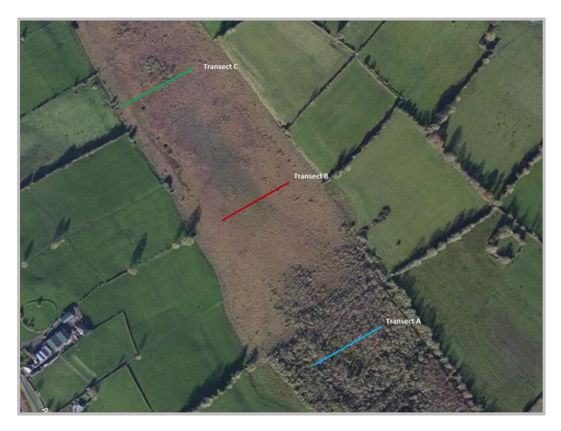
Figure 2. Pitfall transects A-C operated at Scragh Bog in 2015. A series of ten traps per transect were installed in roughly a north-east to south-west trajectory. Transect A was intercepted by very wet conditions at its south-west end and two traps had to be installed in a line diverging north-west from the main group to avoid this obstacle.

RA was to take responsibility for collection and/or trapping of all invertebrates except moths (Lepidoptera) and spiders (Araneae). The main focus would be a) field collecting in suitable weather, b) the setting up and collection from pitfall traps. Pitfall traps were assembled on 12 May 2015 along three transects (Fig. 2).