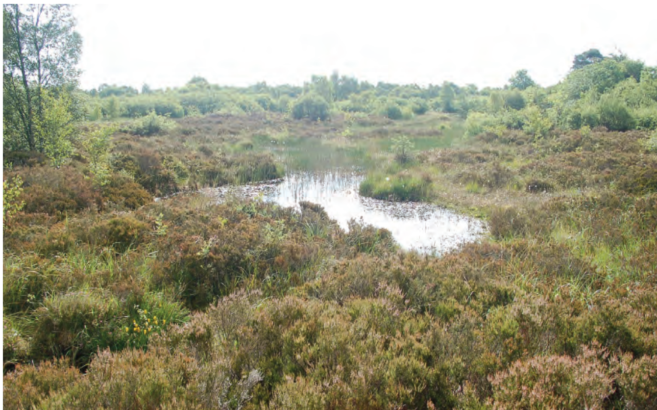
DSC 2509: P5 - Area of cutover bog dominated by Ling Heather heathland and regenerating bog and poor fen communities in the hollows. View to south-east.