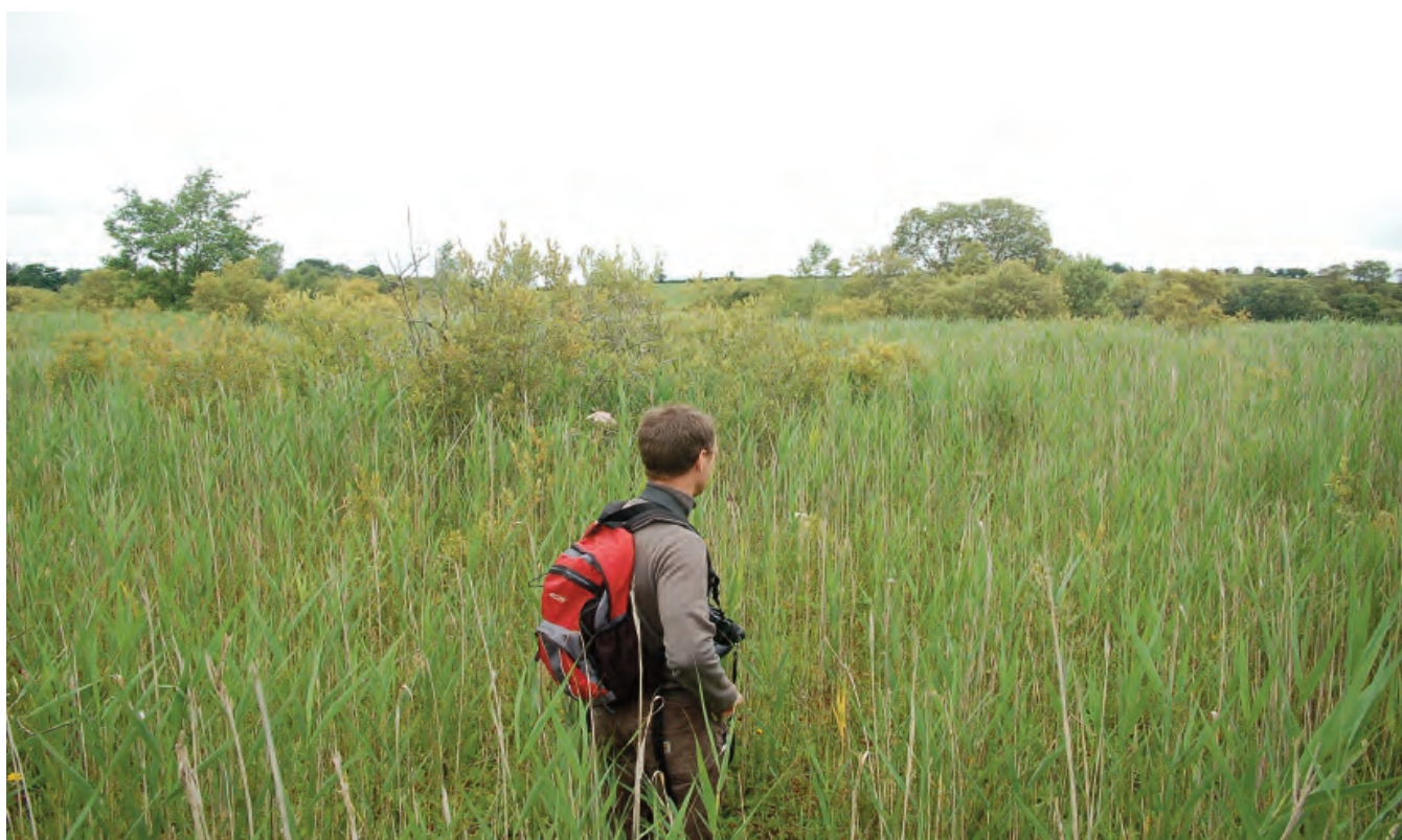
DSC 1982: P1 - Transition mire area with scattered Phragmites australis at the eastern end of the site. View to north.