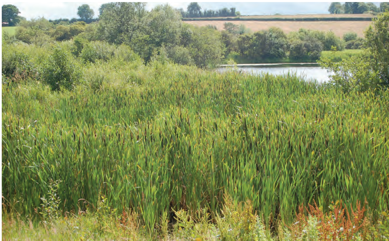
DSC 2020: P4 - View over Lough Aphuca (northern corner) with Typha latifolia reed bed swamp around lakeshore. View to south.