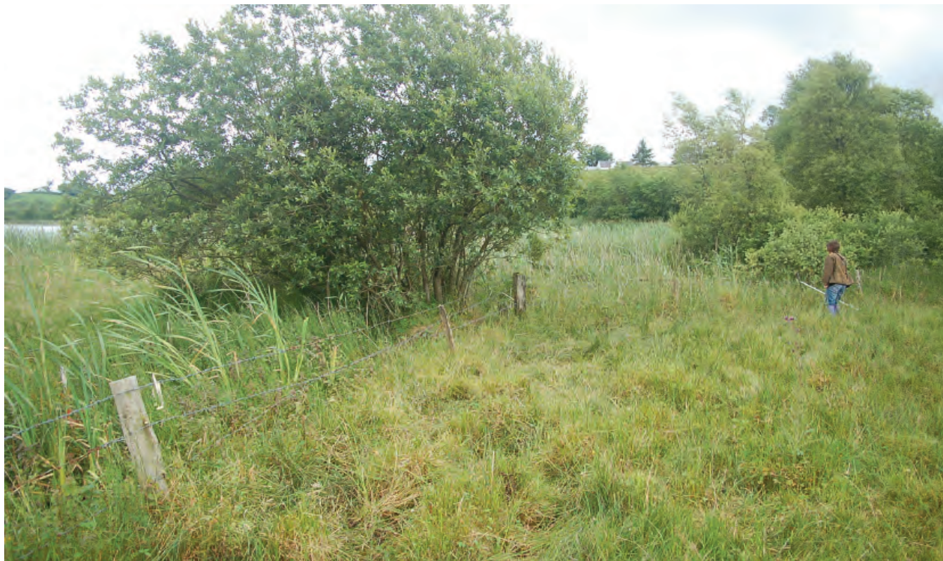
DSC 2341: P1 - Western shore of the lake, with Typha latifolia reed bed swamp zone with scattered willow and wet grassland in the foreground. View to south-east.