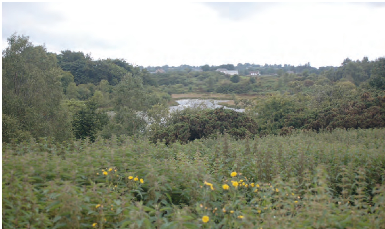
DSC 2254: P1 - View over Lough Nahinch from a recently infilled and revegetated spoil heap (dominated by Urtica dioica ), with sloped area above lake surrounded by dense Gorse scrub. View to west.