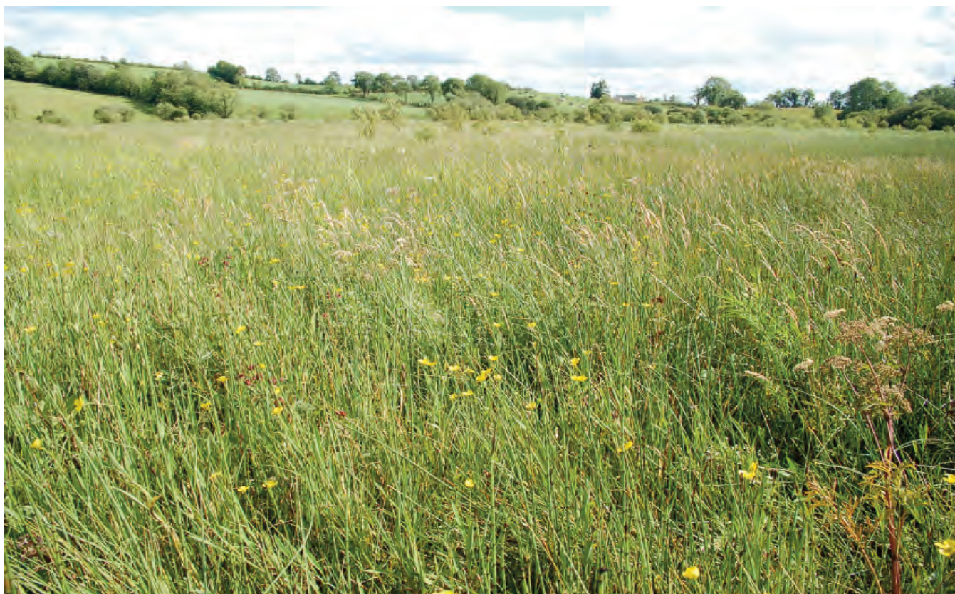
DSC 2113: P3 - View of the transition mire vegetation at Faltagh, with Ranunculus lingua . View to the south.