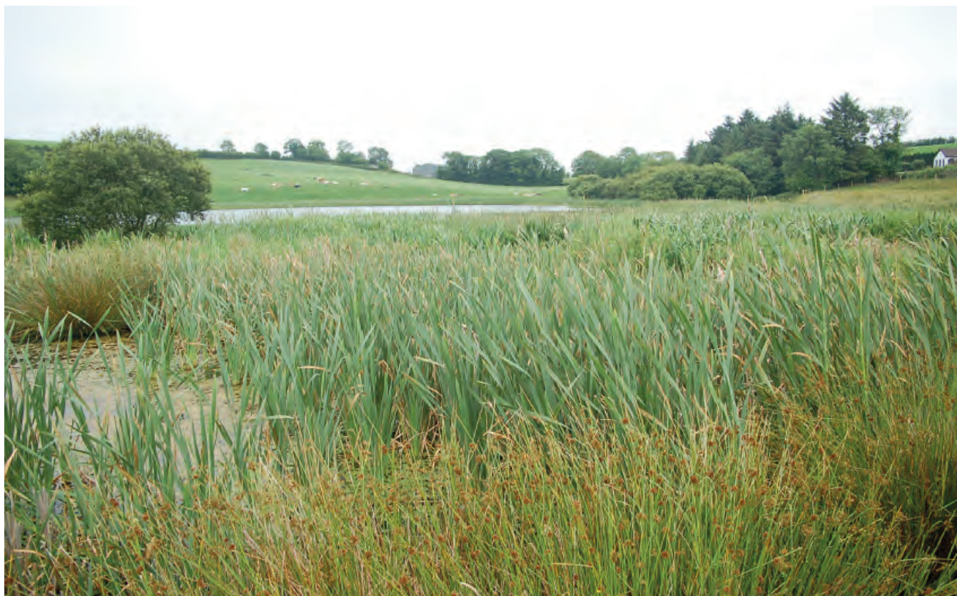
DSC 1946: P2 - Marginal swamp vegetation (with Juncus effusus and Typha latifolia ) on Drumharrif Lough occurring on poached mineral soil. View to the south-east.