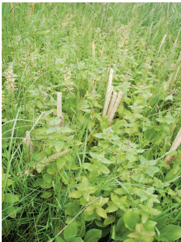
DSC 2347: P1 - Western shore of the lake, showing herb layer in the Typha latifolia reed bed swamp zone, with Bogbean and Mentha aquatica .