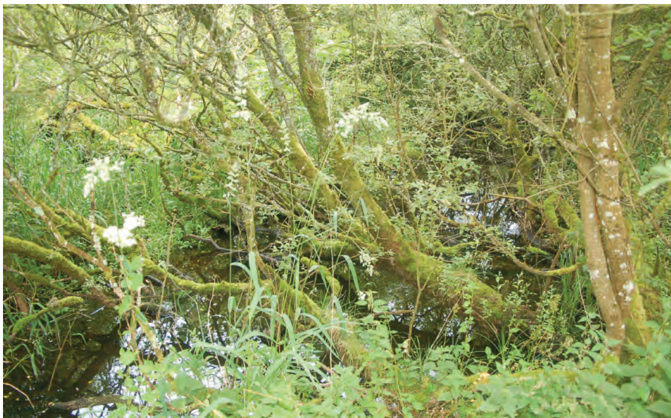
DSC 2272: P3 - Wet willow alder woodland with scattered understory of Phalaris arundinacea , to the south of the path.