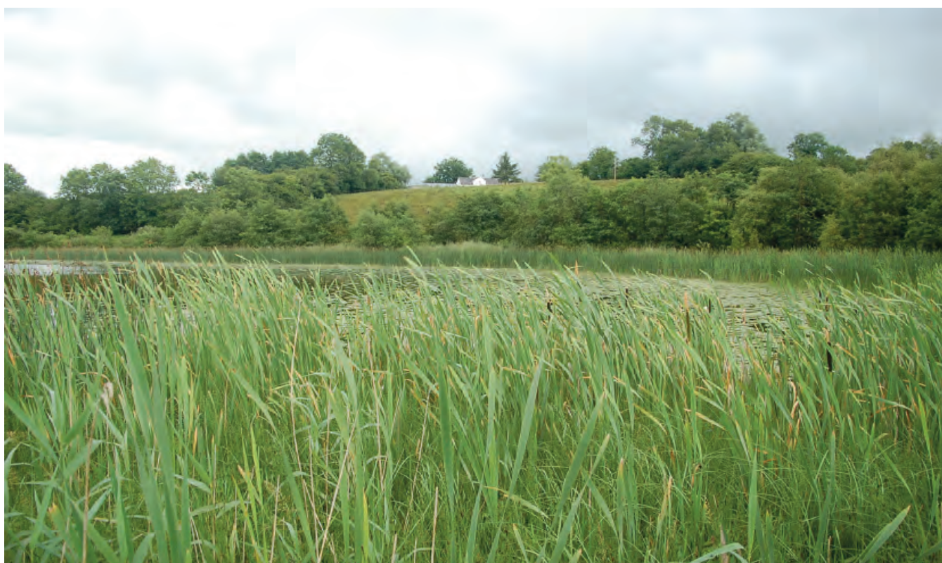
DSC 2343: P2 - Western shore of the lake, with Typha latifolia reed bed swamp zone. View to south-east.