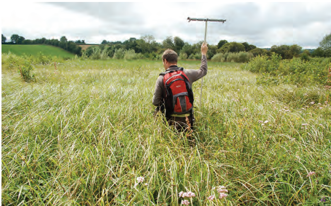
DSC 2010: P3 - Marsh area at the site dominated by Carex acutiformis and Carex disticha and wet woodland area in the distance. View to north-west.