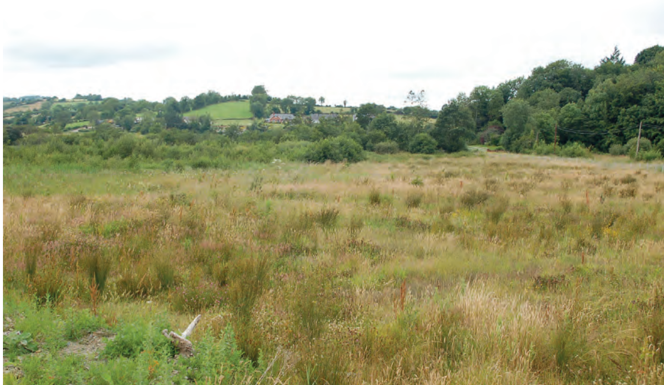
DSC 2006: P2 - View over Lough Aphuca (northern half) with recent infill area in foreground, wet grassland beyond, and the marsh and wet woodland area in the distance. View to north.