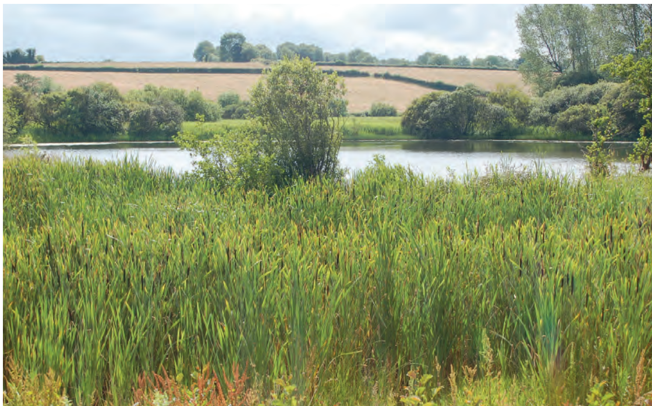
DSC 2021: P4 - View over Lough Aphuca (northern corner) with Typha latifolia reed bed swamp around lakeshore. View to south-west.