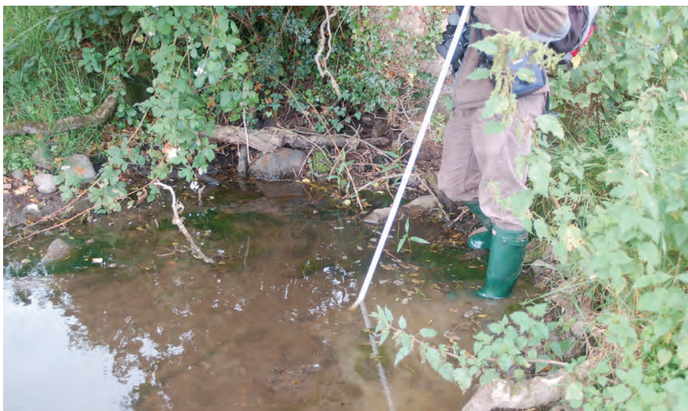
DSC 2301: P2 - Southern shore of the lake, where a swallow hole takes the water outflow from the lake.