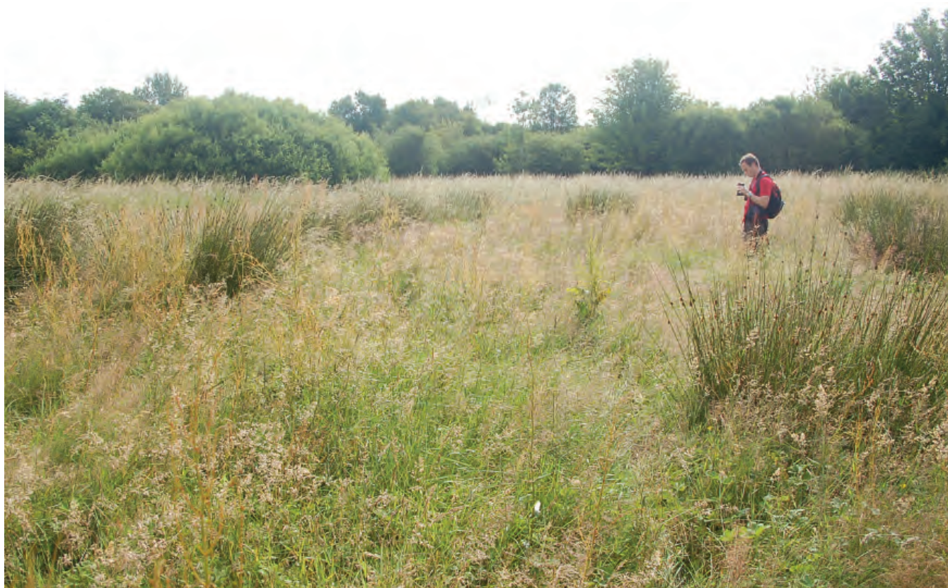
DSC 2507: P4 - Wet grassland area at the western end of the site. The willow woodland which occurs within the site can be seen in the distance.