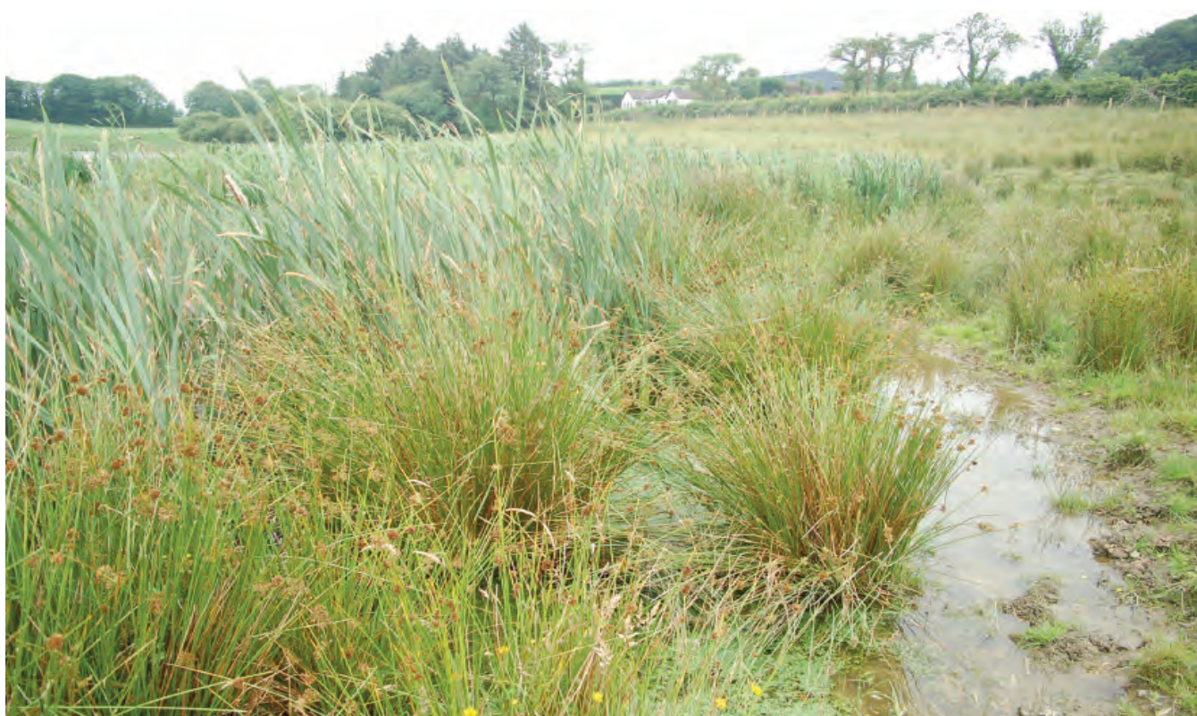
DSC 1943: P2 - Marginal vegetation (with Juncus effusus and Typha latifolia ) on Drumharrif Lough occurring on heavily poached mineral soil.