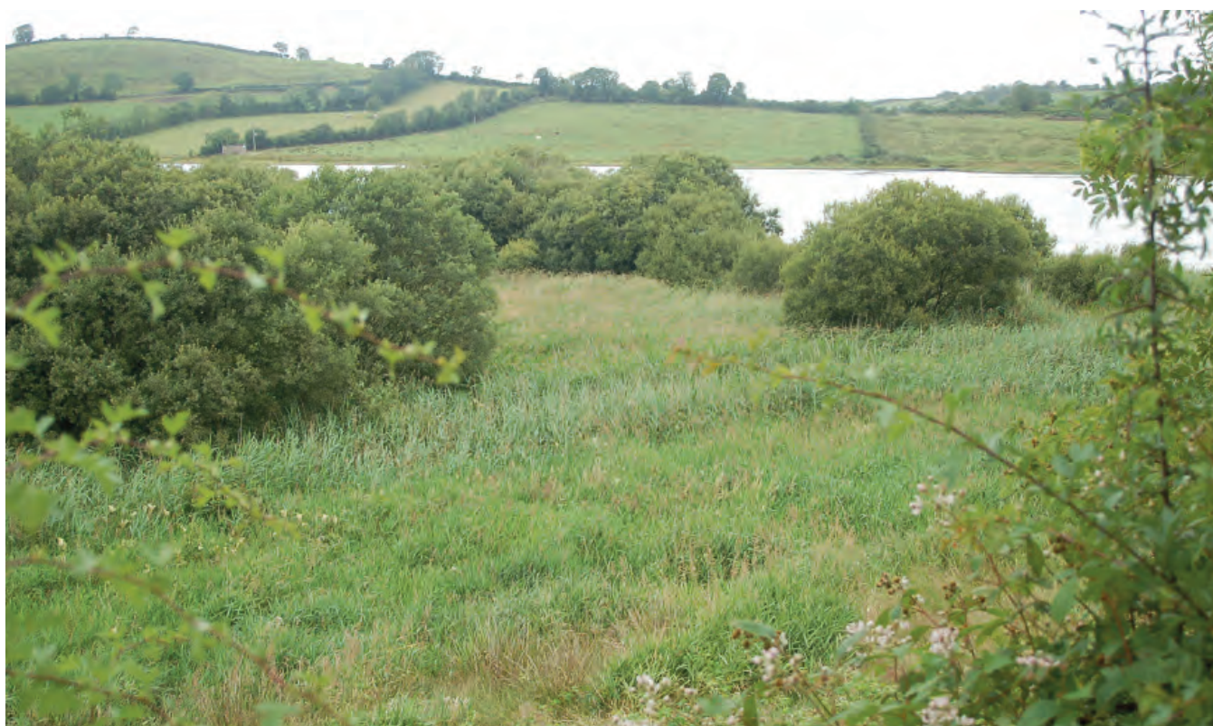
DSC 2205: P1 - Phalaris arundinacea dominated marsh area with scattered willow trees at the southern end of the site, with Muckno Mill Lough in the distance. View to north-west.