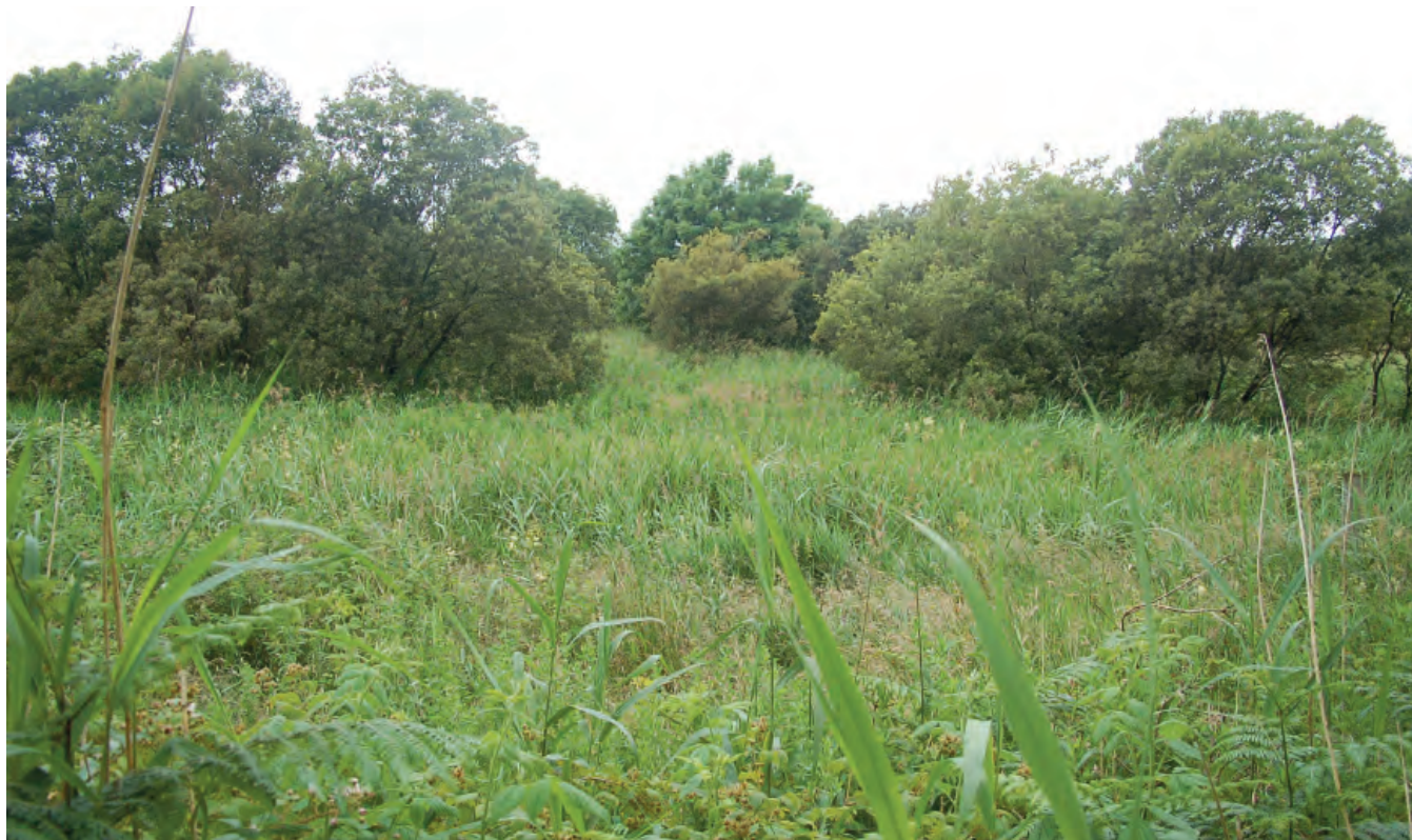
DSC 2202: P1 - Phalaris arundinacea dominated marsh area with scattered willow trees at the southern end of the site. View to north-west.