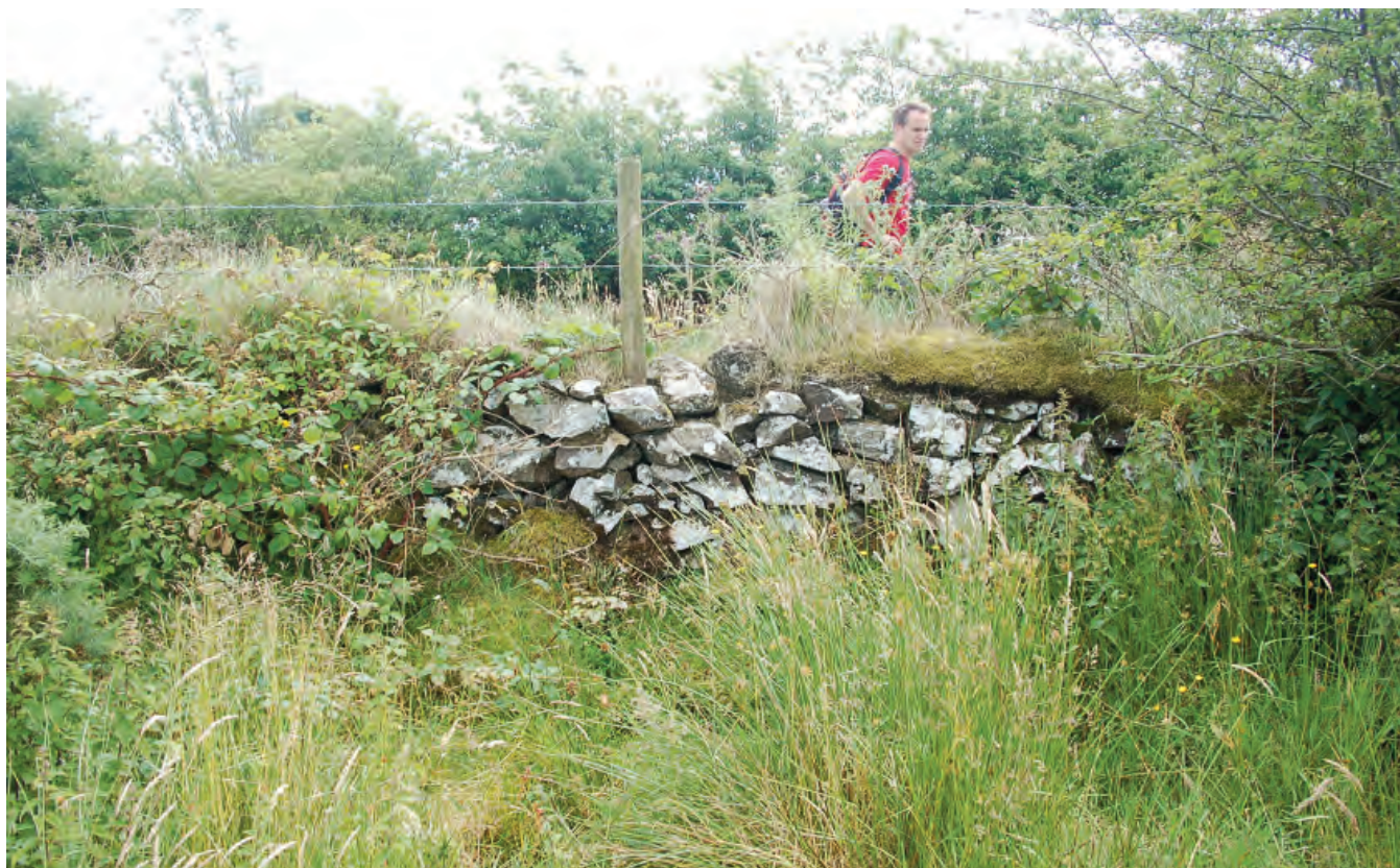
DSC 2588: P6 - Stone walls the road along the southern edge of the site.