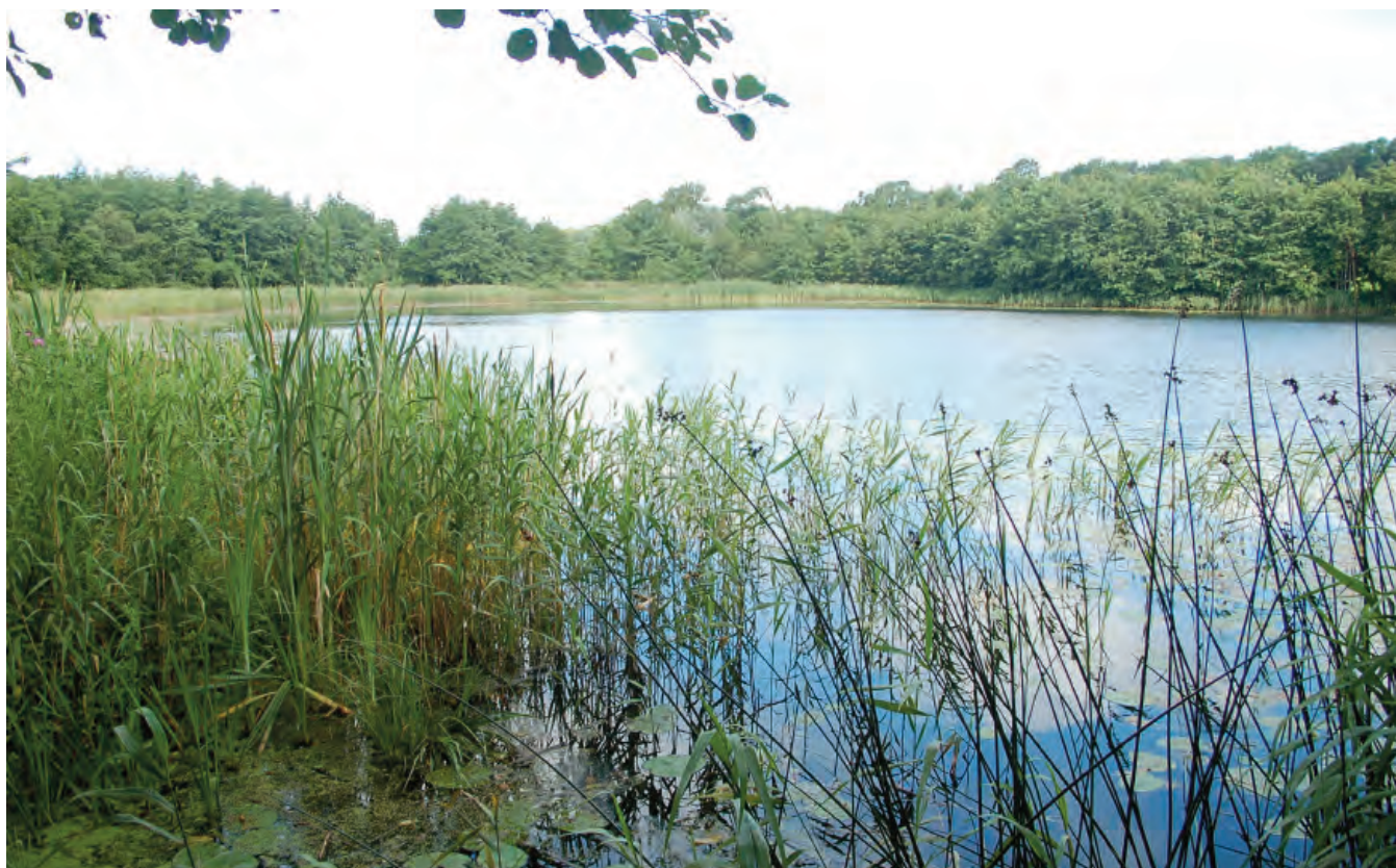
DSC 2044: P3 - Reed fringed shoreline dominated by Phragmites australis on the northern of the 2 Killyboley Loughs. This lake has a dense alder fringing wet woodland area behind the reed beds. View to west.