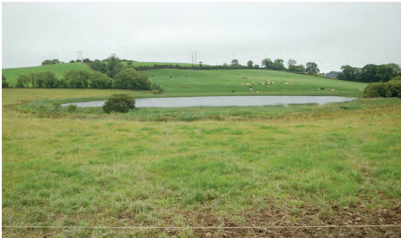
DSC 1942: P1 - General view of Drumharrif Lough with fringing reed communities, and improved grassland surrounding the lake. View to south-east.