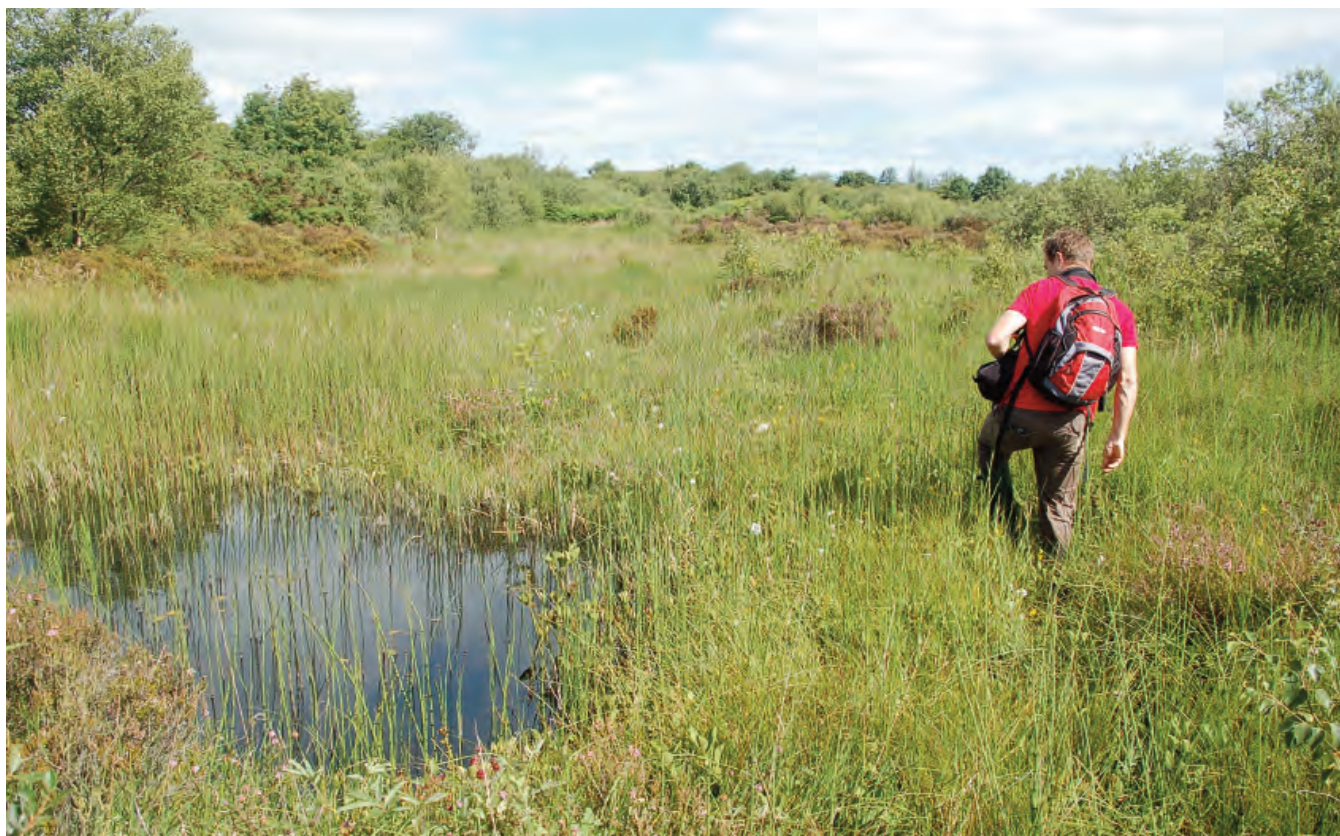
DSC 2526: P6 - Poor fen area colonising wet pools and hollows at the site. View to north.