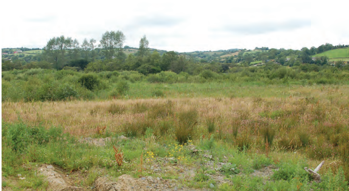
DSC 2005: P2 - View over Lough Aphuca (northern half) with recent infill area in foreground and the marsh and wet woodland area in the distance. View to north.