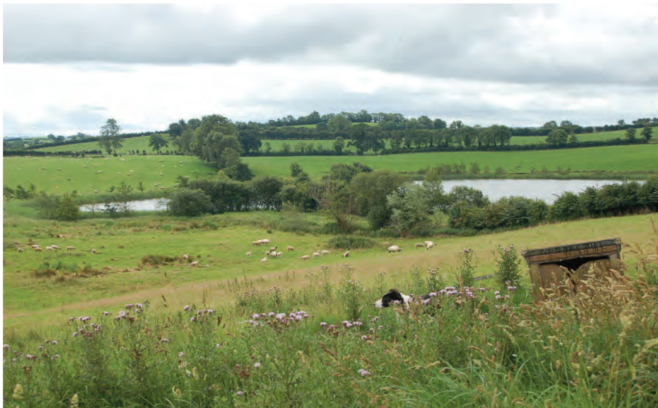
DSC 2062: P3 - General view of Sillis Lough looking westwards, with reed bed zone surround most of the shore of the lake.