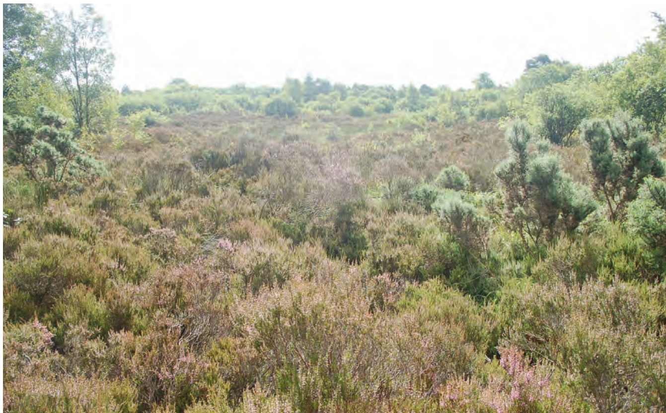
DSC 2508: P5 - Area of cutover bog dominated by Ling Heather heathland and surrounding Gorse and Birch scrub near the western edge of the site. View to south-east.