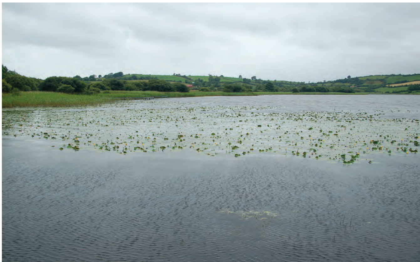
DSC 2214: P5 - Eastern end of the lake, with emergent Nuphar lutea . View to west.