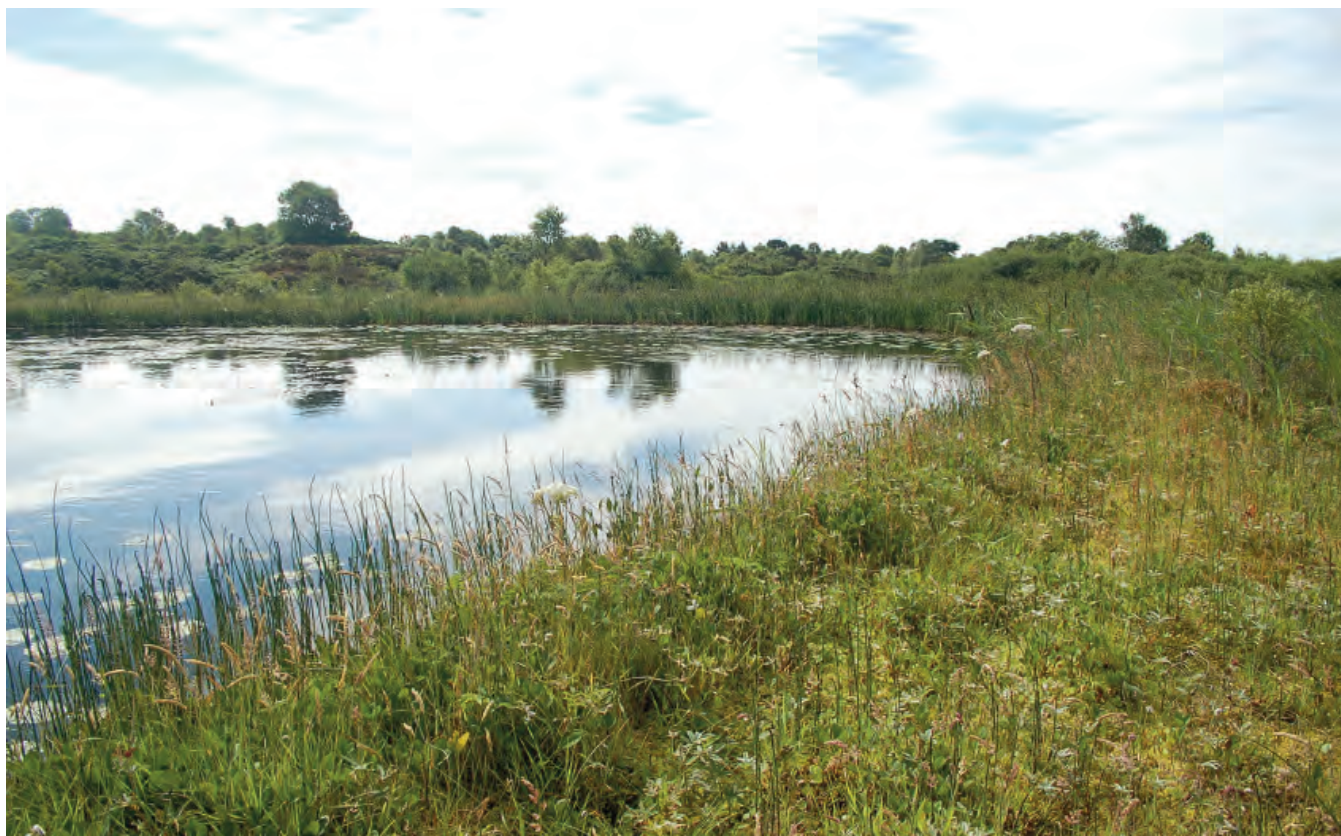
DSC 2541: P7 - Transition mire area forming a broad band around the western edge of the smaller of the 2 lakes at Lough Nahinch. View to south.