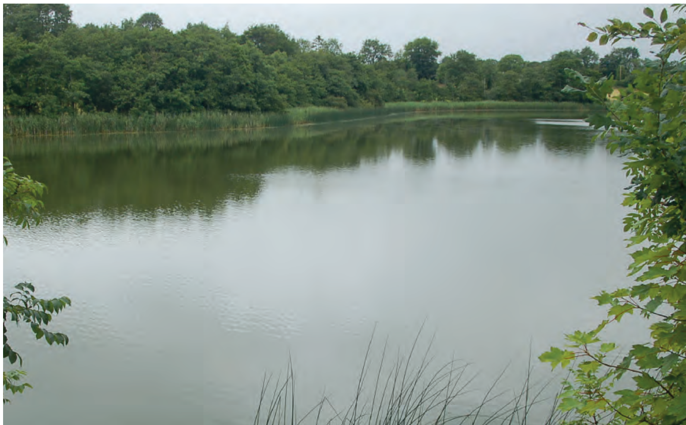
DSC 2334: P3 - Typha latifolia reed bed fringe on the north western shore of Lough Ooney. View to north west.