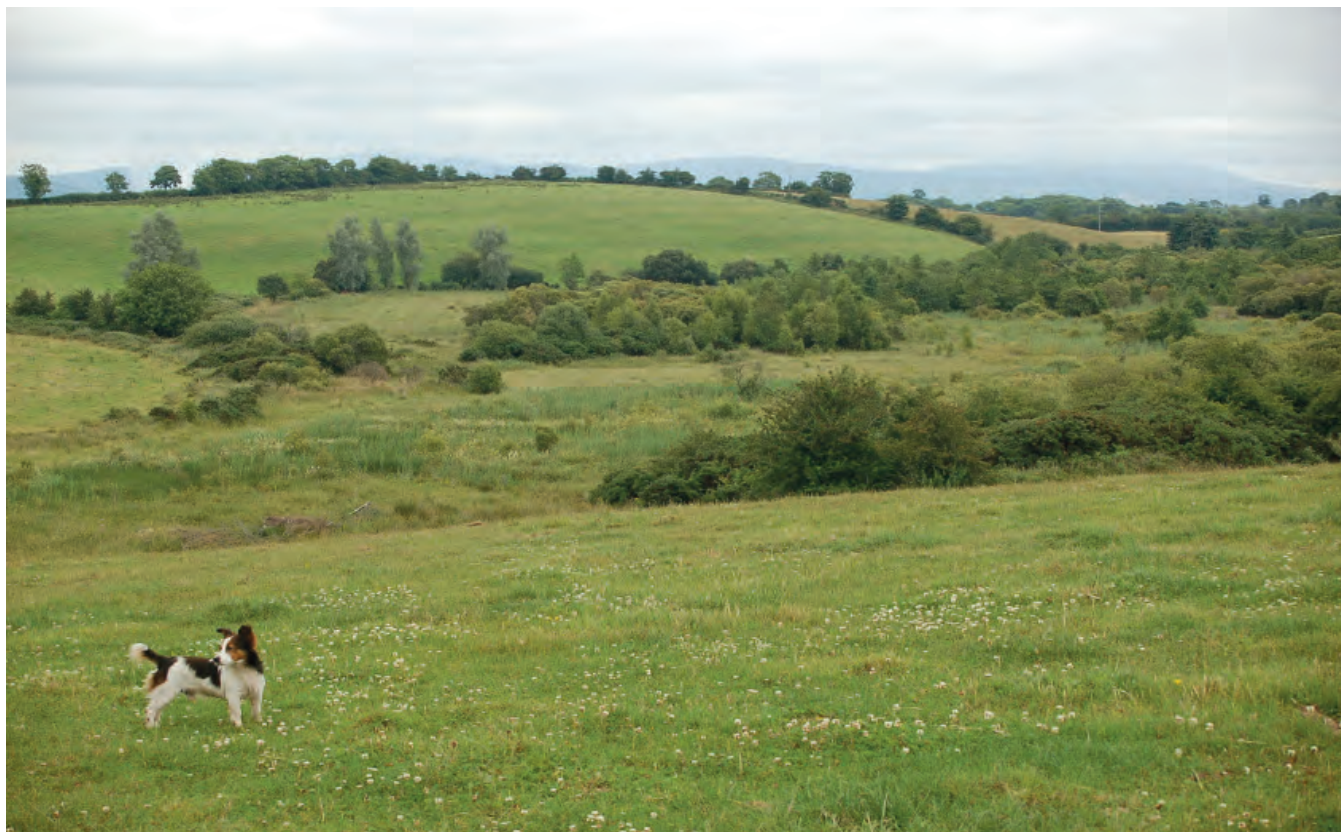
DSC 1997: P3 - Transition mire area at the north-western end of the site, which extends into County Louth. Some areas show an increase in the cover of wet willow woodland. View to north-east.