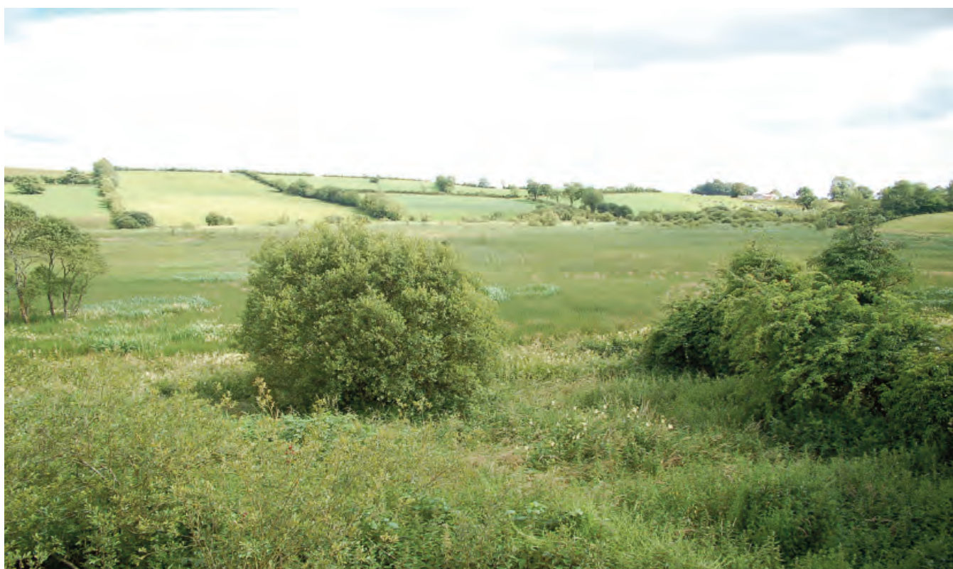
DSC 2093: P1 - Transition mire at Faltagh with scattered willow scrub especially on marginal areas. View over site to the south.