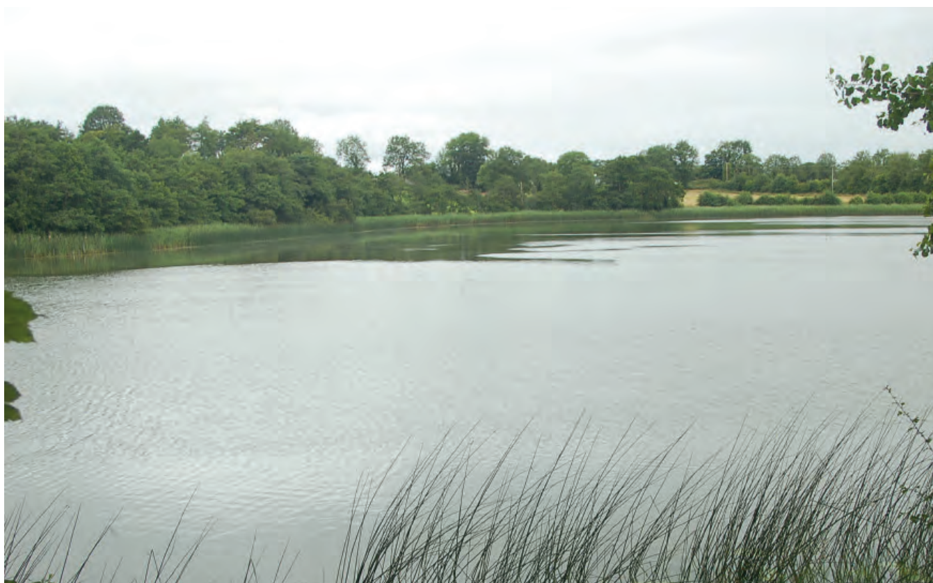
DSC 2336: P3 - Typha latifolia reed bed fringe on the north western shore of Lough Ooney, with a narrow Schoenoplectus lacustris fringe in front and extending a short distance into open water of lake. View to north west.