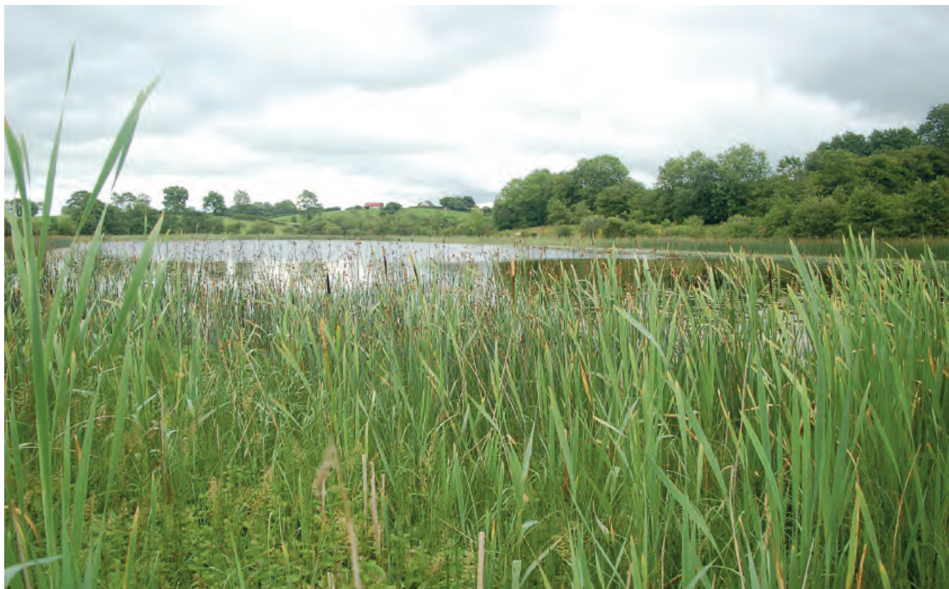
DSC 2346: P1 - Western shore of the lake, with Typha latifolia reed bed swamp zone. View to east.