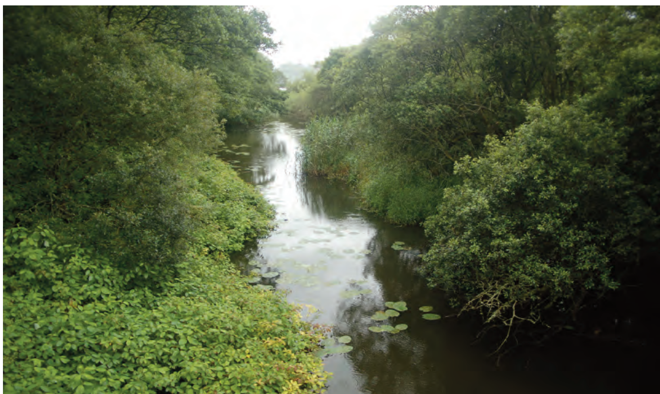
DSC 2268: P2 - River channel connection the two lakes at Island Bridge, dominated by willow and alder scrub on the banks and various introduced species. View to south.