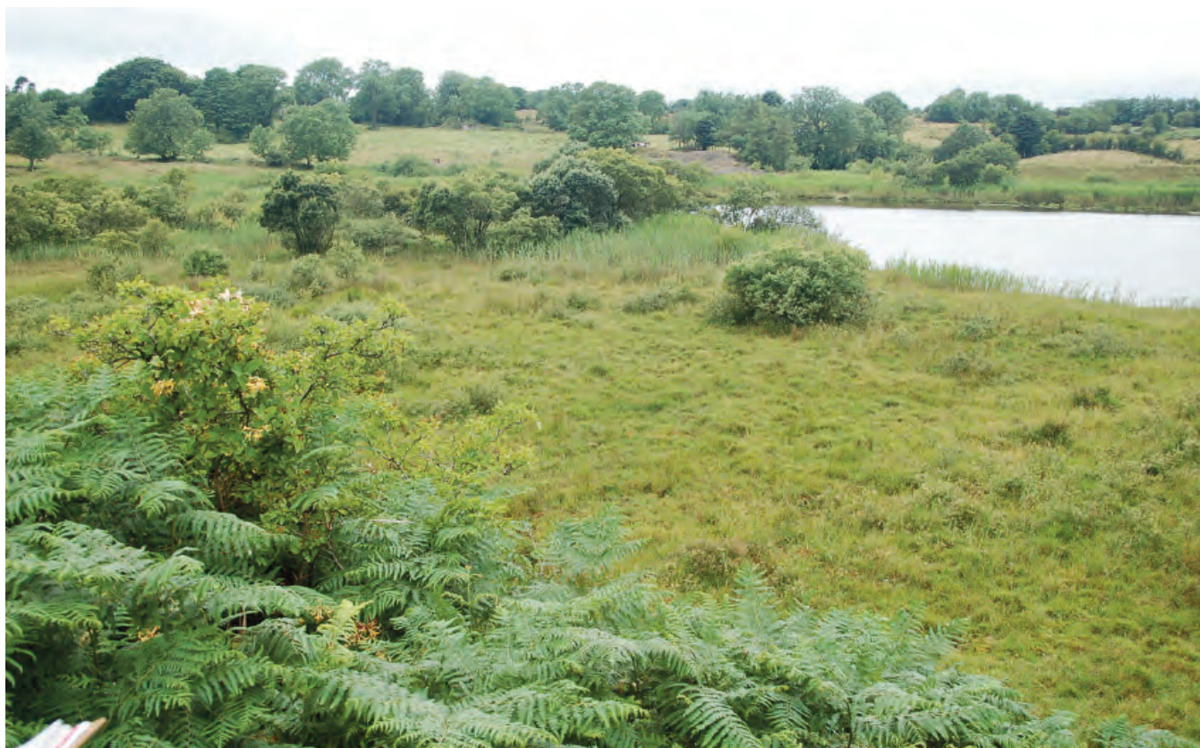
DSC 2238: P4 - Transition mire area on the eastern shore below a bracken covered slope.