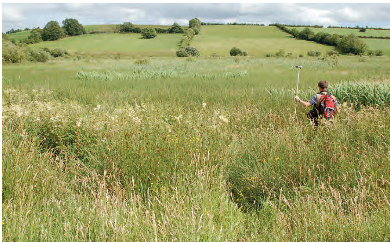
DSC 2099: P2 - Transition mire at Faltagh in the centre with wet grassland in the foreground. View to the east.