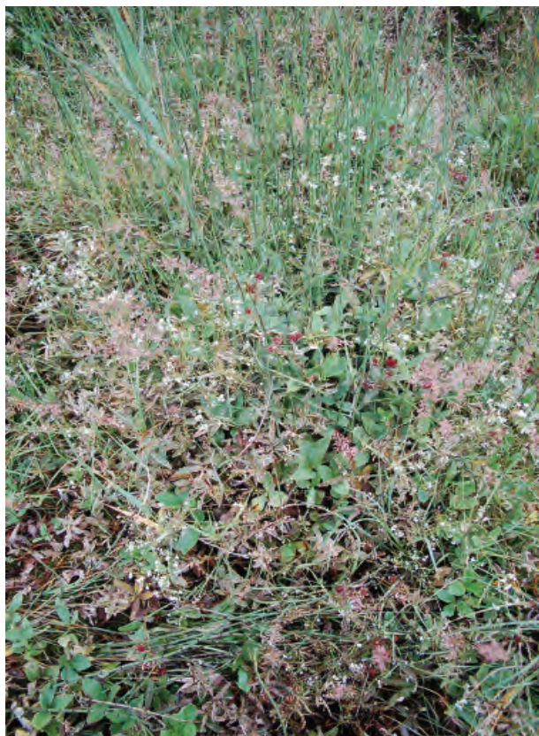
DSC 2240: P4 - Detail of the transition mire area on the eastern lake shore.

Site Name: Tassan Lough Site Code Number: NHA 001666