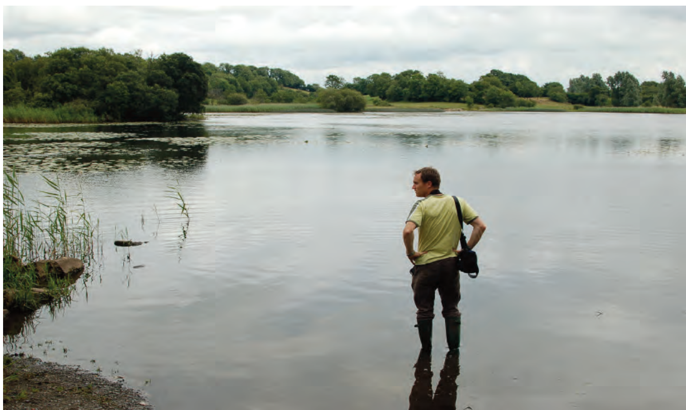
DSC 2025: P2 - Northern rocky shore of the lake, with narrow reed bed zone. View to east.