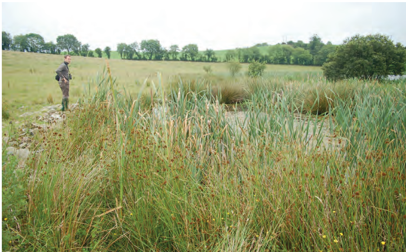
DSC 1944: P2 - Marginal swamp vegetation (with Juncus effusus and Typha latifolia ) on Drumharrif Lough occurring on poached mineral soil. Older rock/spoil heap on the LHS. View to the north.