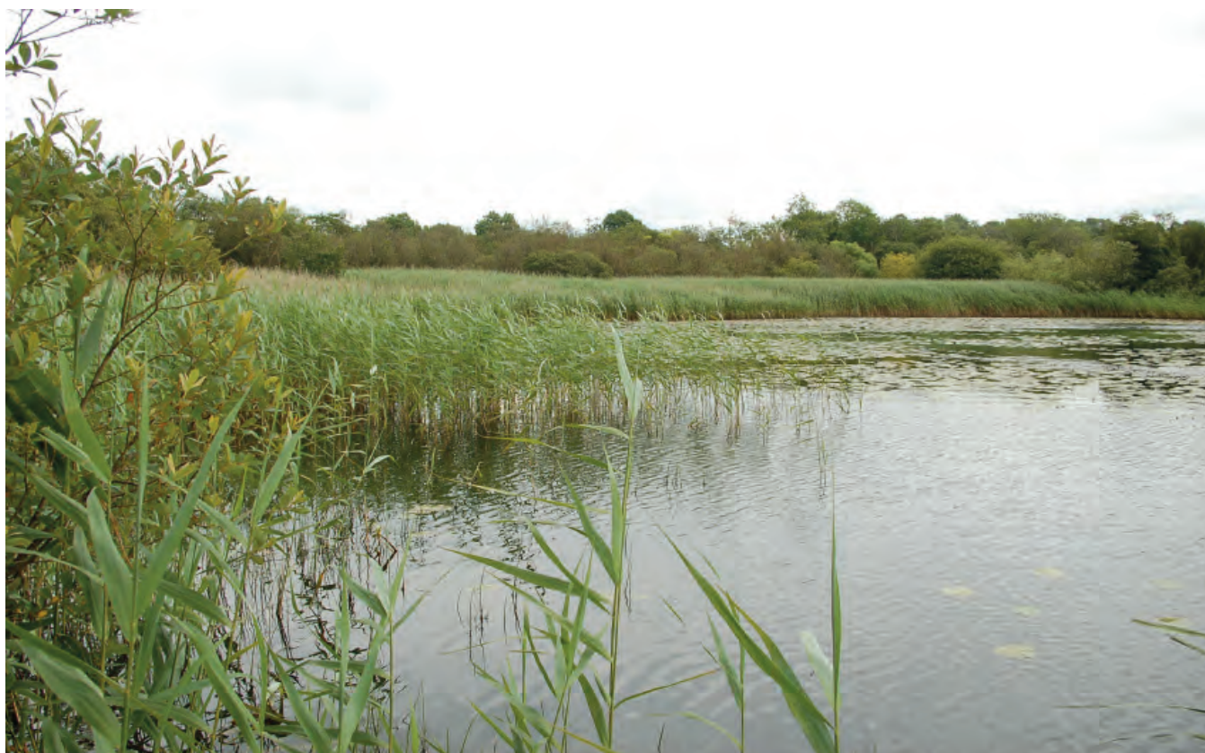
DSC 2027: P2 - Northern shore of the lake, with narrow reed bed zone. View to east.