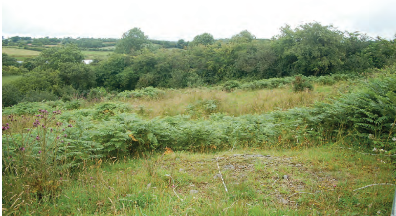
DSC 2233: P2 - Unimproved grassland area to the south east of lake.