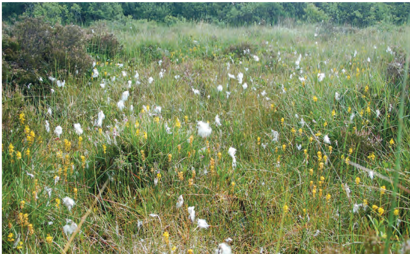
DSC 2522: P5 - Area of regenerating cutover bog vegetation in a wet hollow with Bog Asphodel ( Narthecium ossifragum ) and Bog Cotton ( Eriophorum angustifolium ).