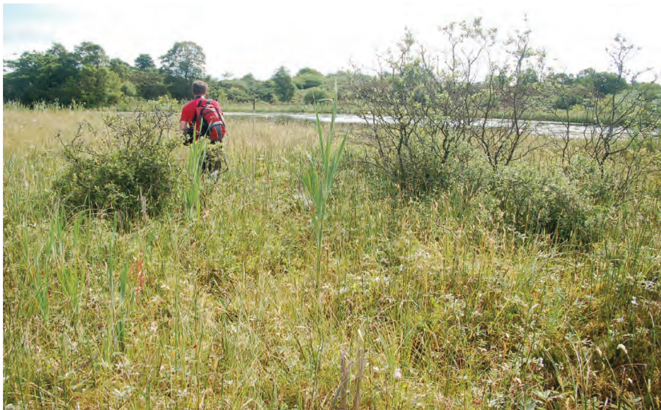
DSC 2540: P7 - Transition mire area forming a broad band around the western edge of the smaller of the 2 lakes at Lough Nahinch. View to south-east.