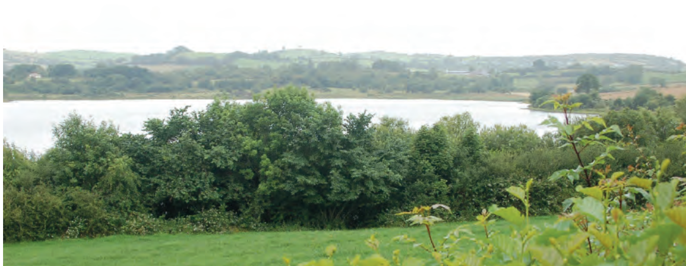
DSC 2178: P2 - Southern shore of the lake, with wet wooded zone in foreground. The remaining lakeshore was dominated by rocky outcrops and a minimal wetland marginal zone adjacent to the improved grassland. View to north-east.