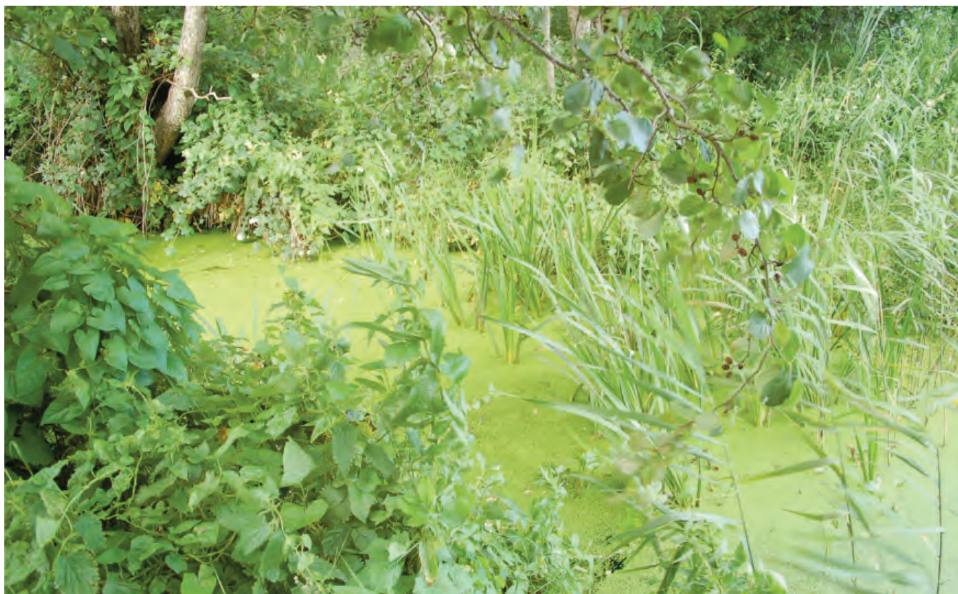
DSC 2046: P4 - Drainage channel connecting the two lakes at Killyboley. Surface of water dominated by a floating mat of Lemna minor .