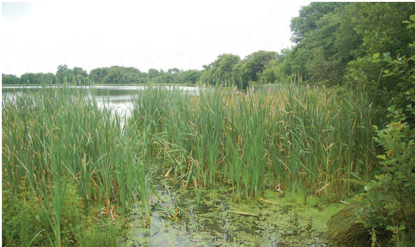
DSC 2324: P1 - Typha latifolia reed bed swamp fringe on the southern shore of Lough Ooney. View to north-east.