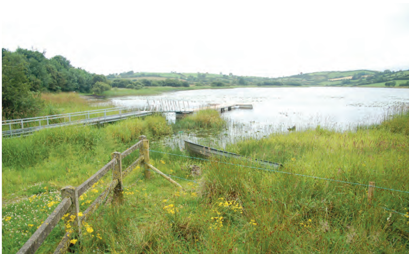
DSC 2208: P3 - Phalaris arundinacea dominated marsh area at the eastern end of the lake, with fishing/visitor platform. View to west.