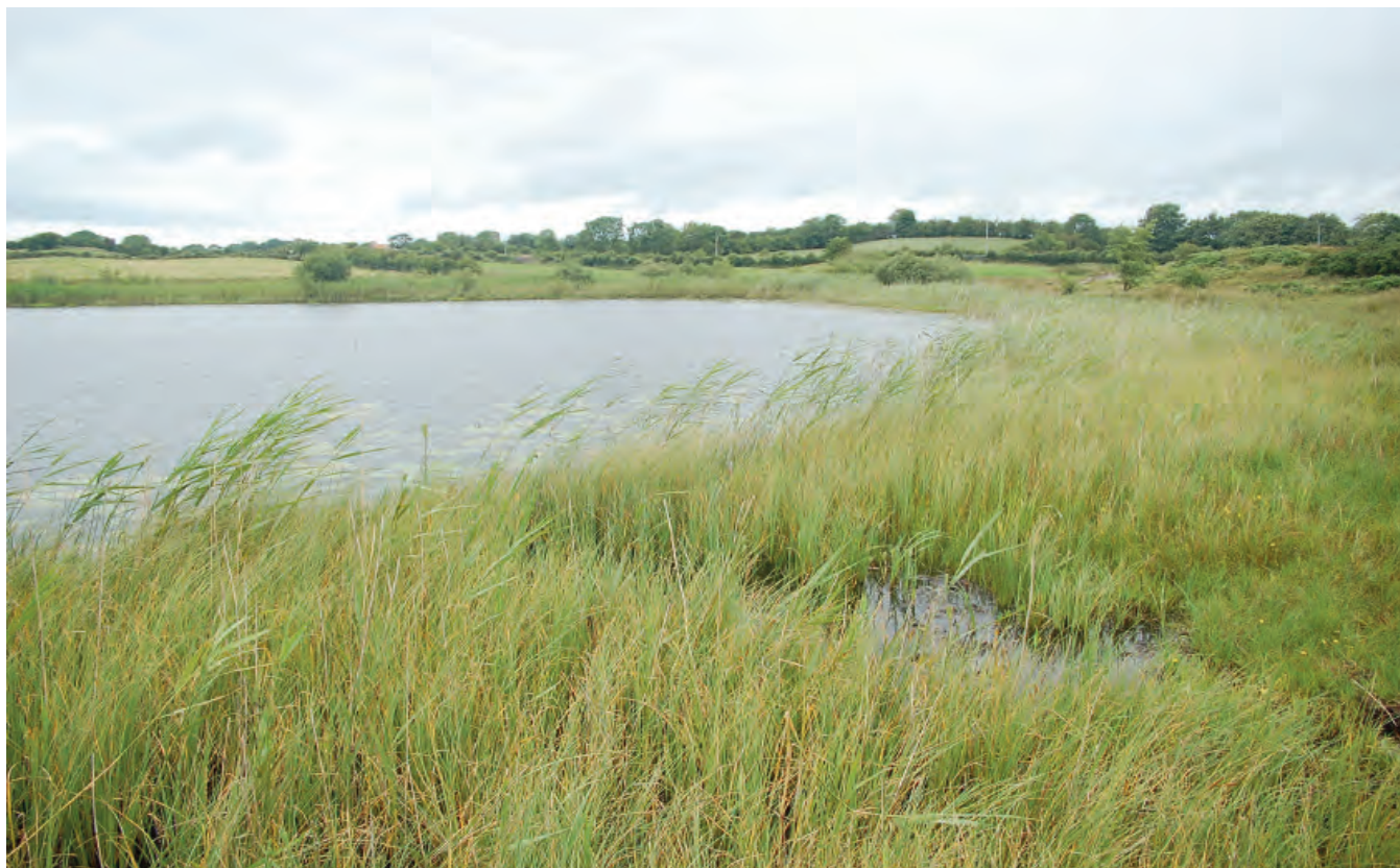
DSC 2244: P4 - Transition mire area on the eastern shore with Carex rostrata .