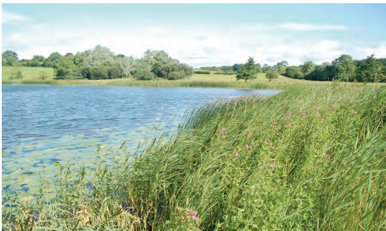
DSC 2034: P1 - Reed fringed shoreline dominated by Phragmites australis and Epilobium hirsutum on the southern of the 2 Killyboley Loughs. View to north.