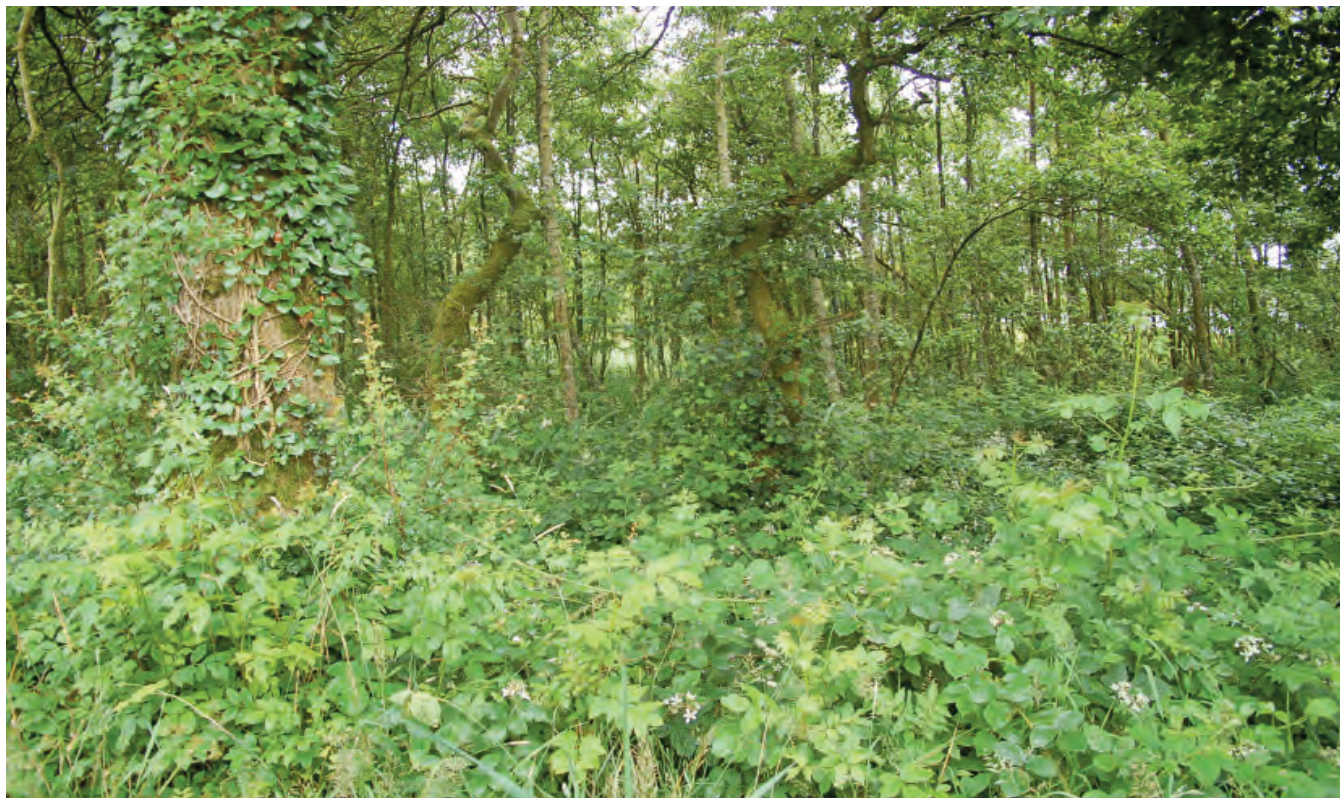
DSC 2174: P1 - Northern shore of the lake, with wet wooded zone. View to south.