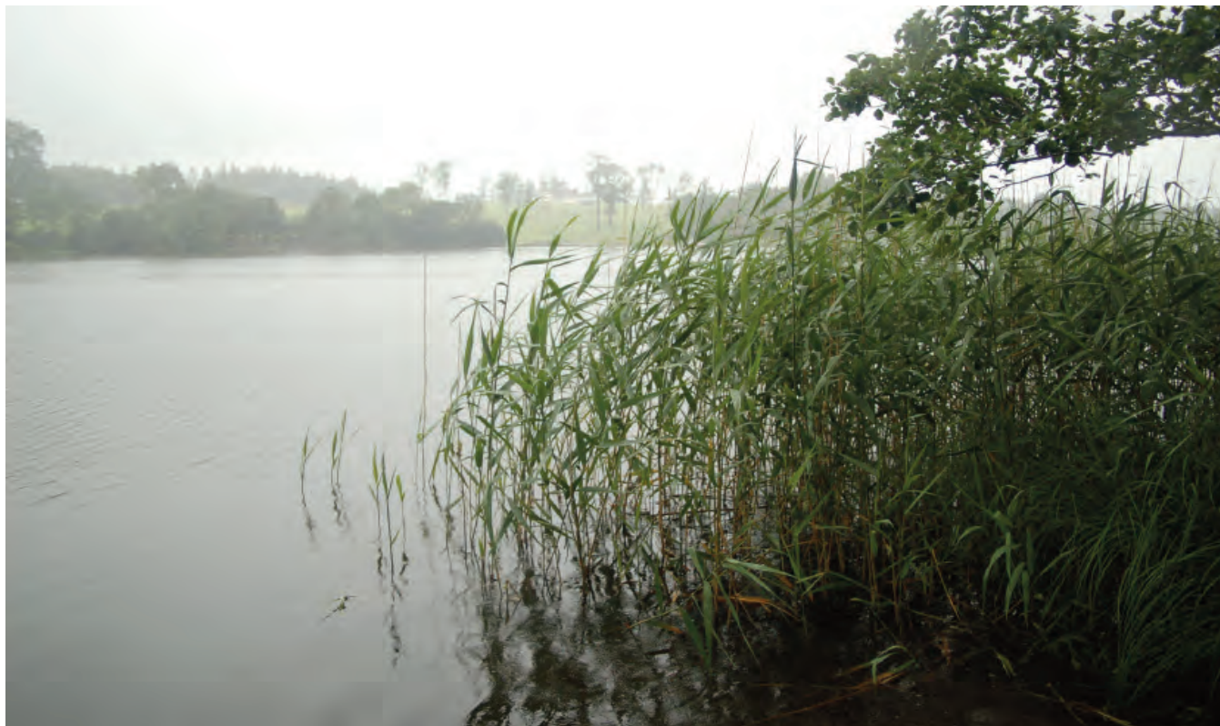
DSC 2267: P1 - Small area of reed bed on lakeshore north of Island Bridge. With wooded lakeshore in the distance. View to north-west.