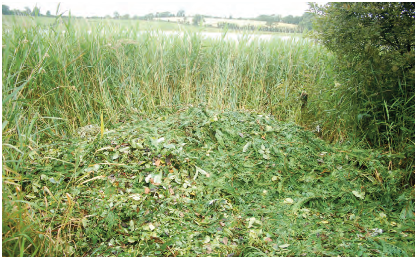
DSC 2218: P4 - Eastern end of the lake, where recent illegal dumping of garden waste was noted at the end of a short access laneway.