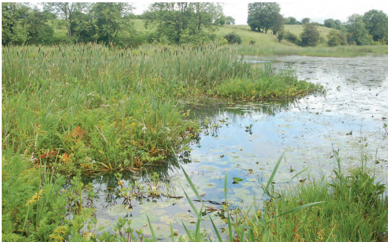
DSC 2306: P3 - Southern shore of the lake, with Typha latifolia reed bed swamp zone. View to north.