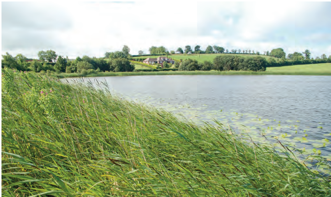
DSC 2031: P1 - Reed fringed shoreline dominated by Phragmites australis on the southern of the 2 Killyboley Loughs. View to south.