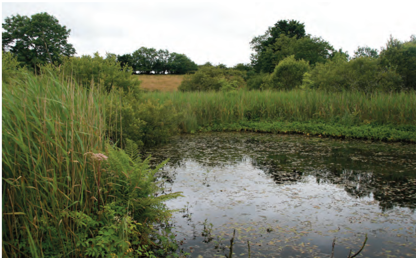
DSC 6684: P7 - Small pool area to the south of the main lake surrounded by Phragmites reed bed.