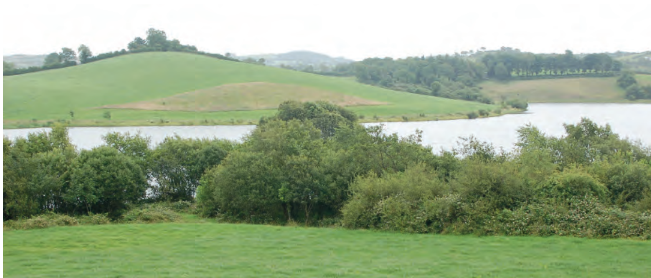
DSC 2176: P2 - Southern shore of the lake, with wet wooded zone in foreground. The remaining lakeshore was dominated by rocky outcrops and a minimal wetland marginal zone adjacent to the improved grassland. View to north-west.