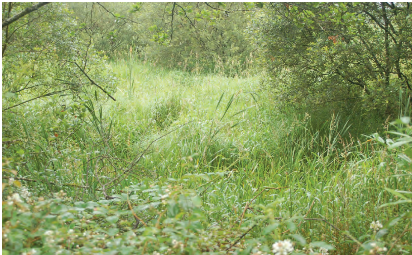
DSC 2271: P3 - Wet willow alder woodland with understory of Phalaris arundinacea , to the north of the path.