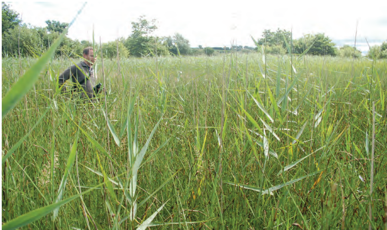
DSC 2049: P1 - Phragmites australis tall herb swamp area in the west of the site. View to north.