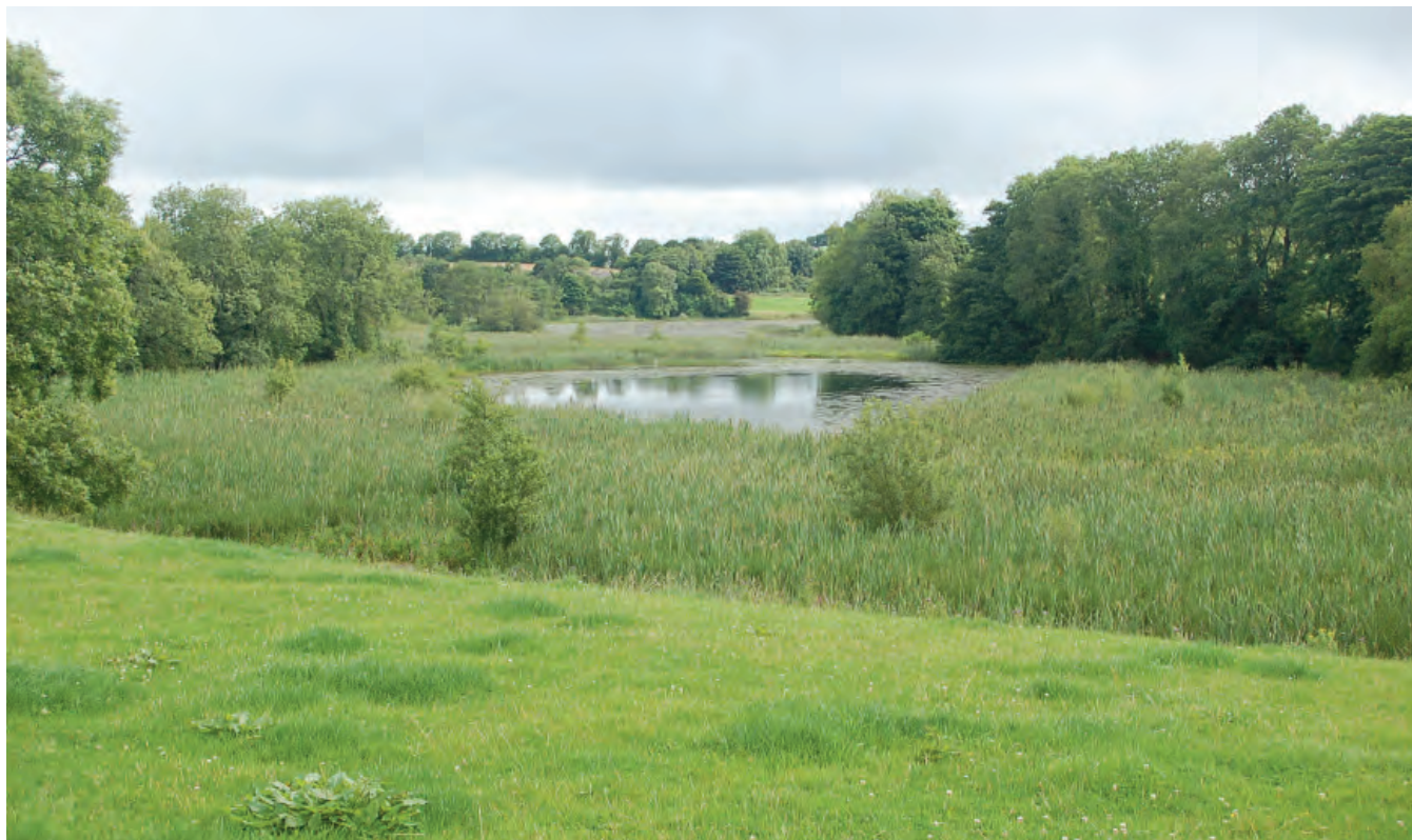
DSC 2298: P1 - Southern shore of the lake, with Typha latifolia reed bed swamp zone. View to north.