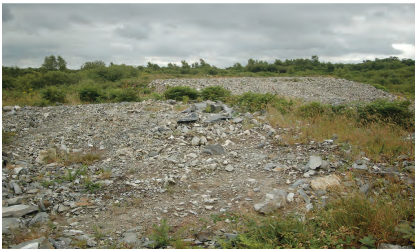
DSC 2256: P2 - Another recently infilled area of site which has not yet re-vegetation. View to south over the site with willow, birch and gorse scrub in the distance.