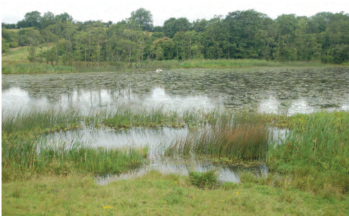
DSC 2319: P4 - North eastern shore of the lake, with Typha latifolia reed bed swamp zone. View to north.