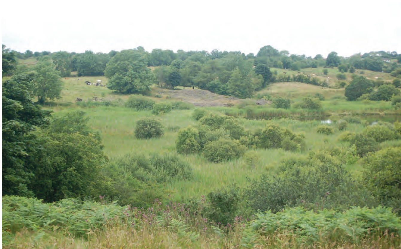
DSC 2234: P3 - General view of western end of Tassan Lough looking north-westwards, with reed bed zone surround the shore of the lake and old mine spoil heaps in the distance.