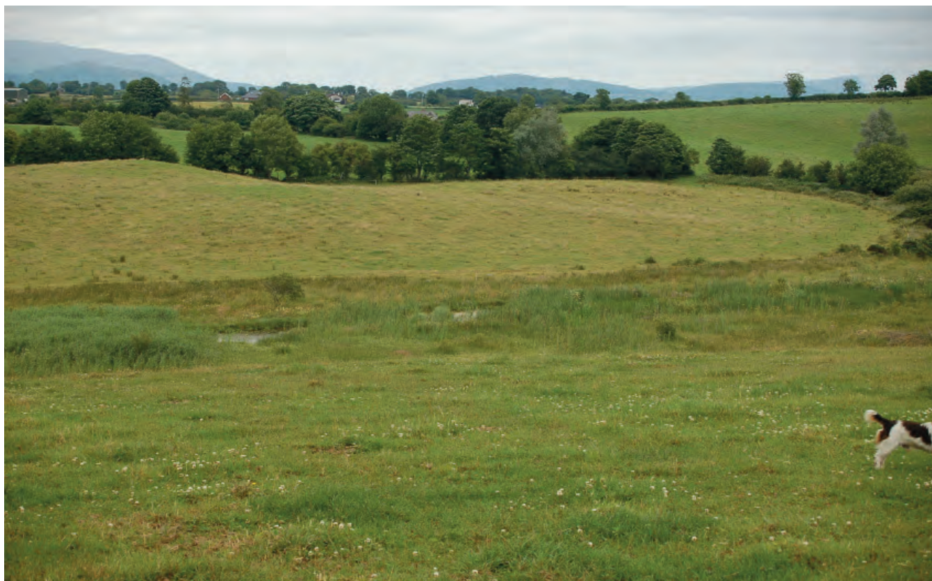
DSC 1998: P4 - Drainage channel between the Phragmites australis dominated reed bed at the western end of the site and the transition mire to the east. View to north.