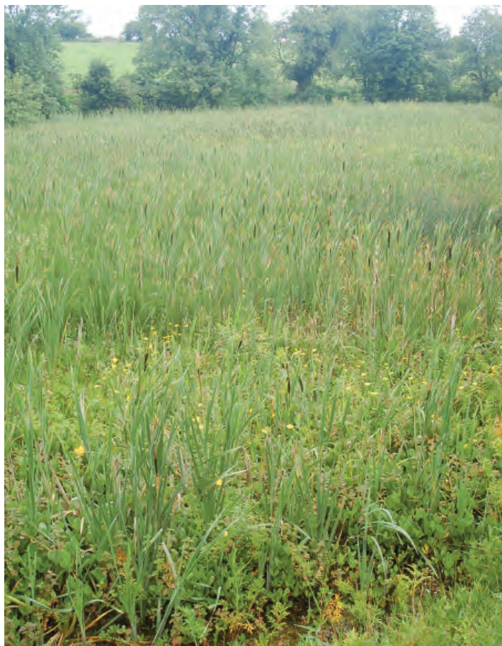
DSC 2305: P1 - Southern shore of the lake, with Typha latifolia reed bed swamp zone.