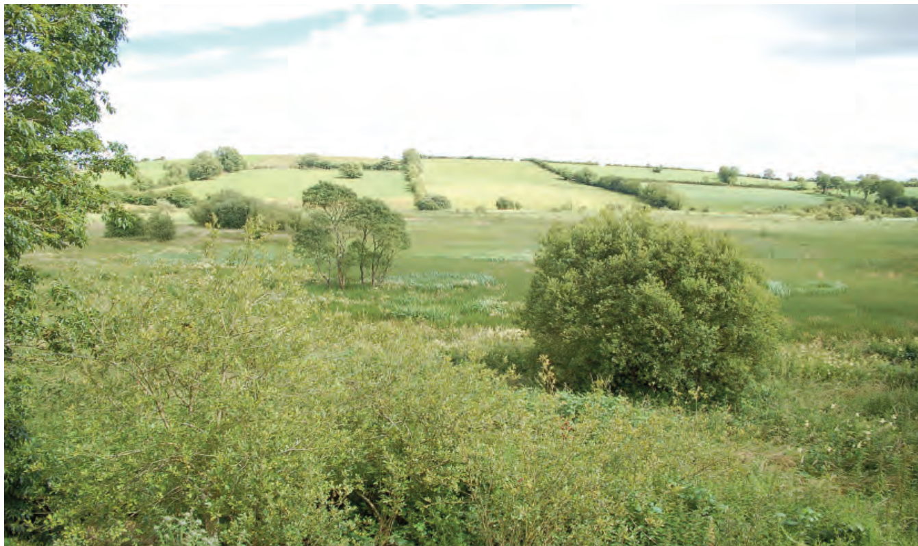
DSC 2092: P1 - Transition mire at Faltagh with scattered willow scrub especially on marginal areas. View to the east.

Photographs by: Peter Foss unless otherwise stated.