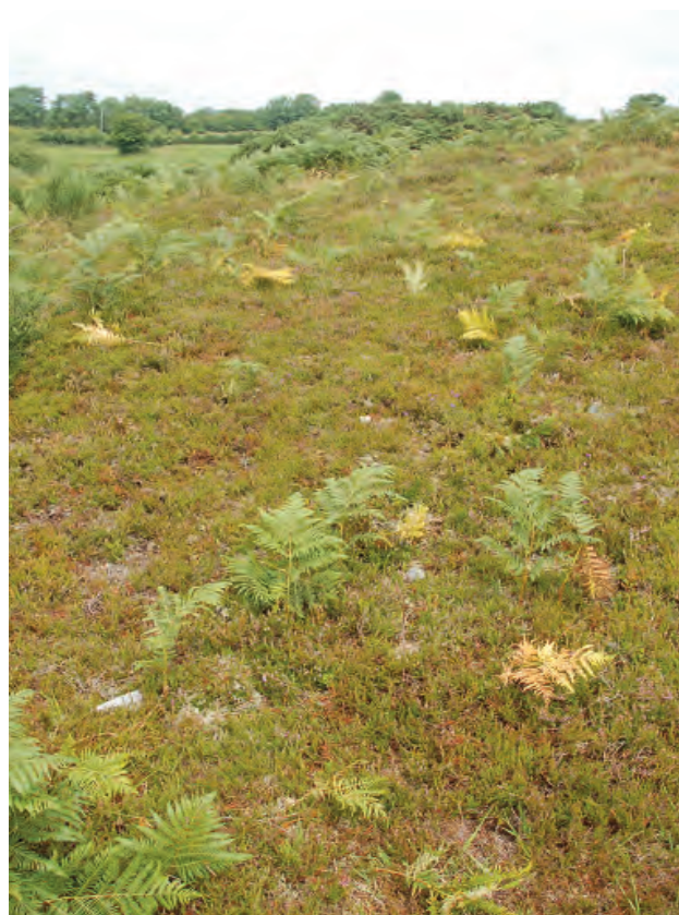
DSC 2578: P5 - Detail of the dry heathland area on the eastern lake shore.