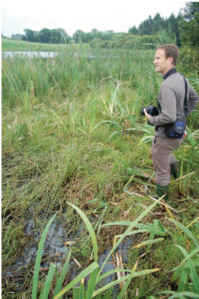
DSC 1948: P2 - Marginal swamp vegetation (with Juncus effusus and Typha latifolia ) on Drumharrif Lough showing damage caused by cattle poaching and grazing.