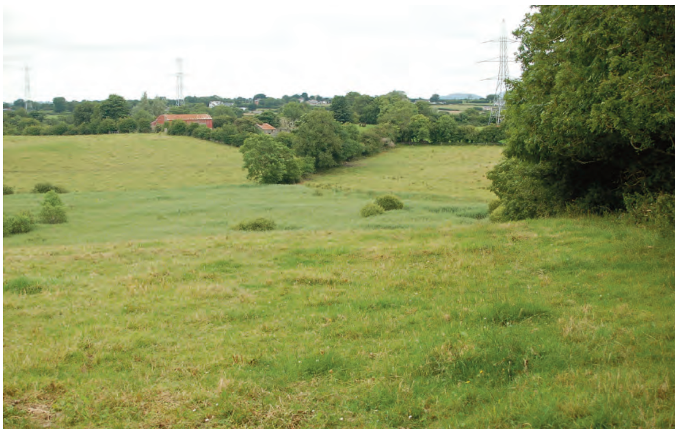
DSC 1995: P2 - Phragmites australis dominated reed bed at the western end of the site. View to north.