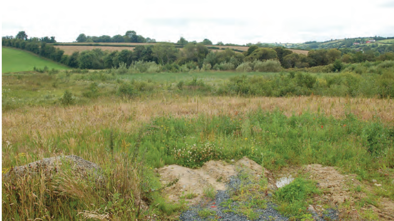
DSC 2003: P1 - View over Lough Aphuca (southern half) with recent infill area in foreground and the marsh and wet woodland area in the distance. View to north-west.

Photographs by: Peter Foss unless otherwise stated.