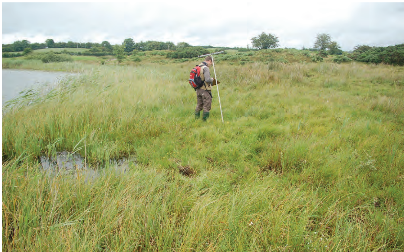
DSC 2242: P4 - Transition mire area on the eastern shore with Carex rostrata .