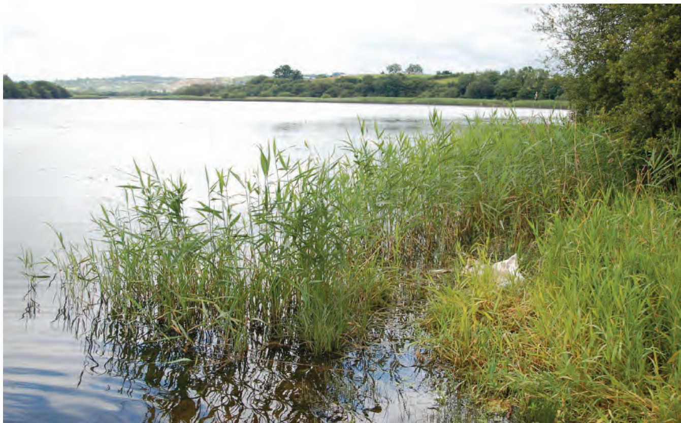
DSC 2026: P3 - Northern shore of the lake, with narrow reed bed zone. A number of fishing platforms are located in the reed bed on the lake shore. View to west.