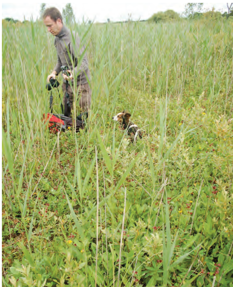
DSC 1987: P1 - Transition mire area with scattered Phragmites australis at the eastern end of the site.