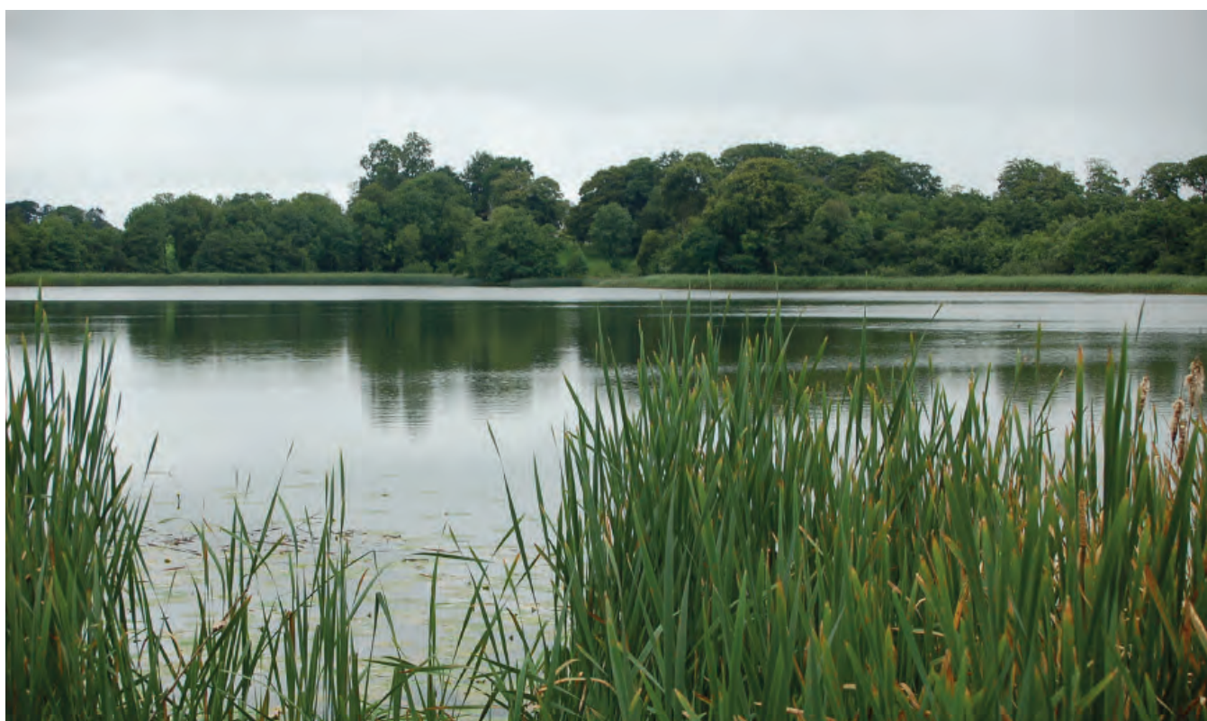
DSC 2330: P2 - Typha latifolia reed bed swamp fringe on the southern shore of Lough Ooney, with similar community on the western shore. View to west.