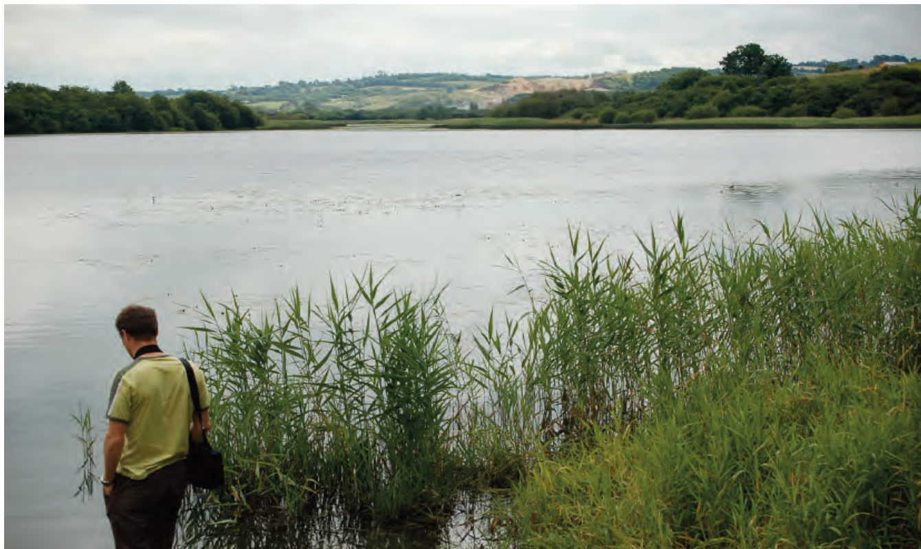
DSC 2024: P1 - Northern shore of the lake, with narrow reed bed zone. View to south.

Photographs by: Peter Foss unless otherwise stated.