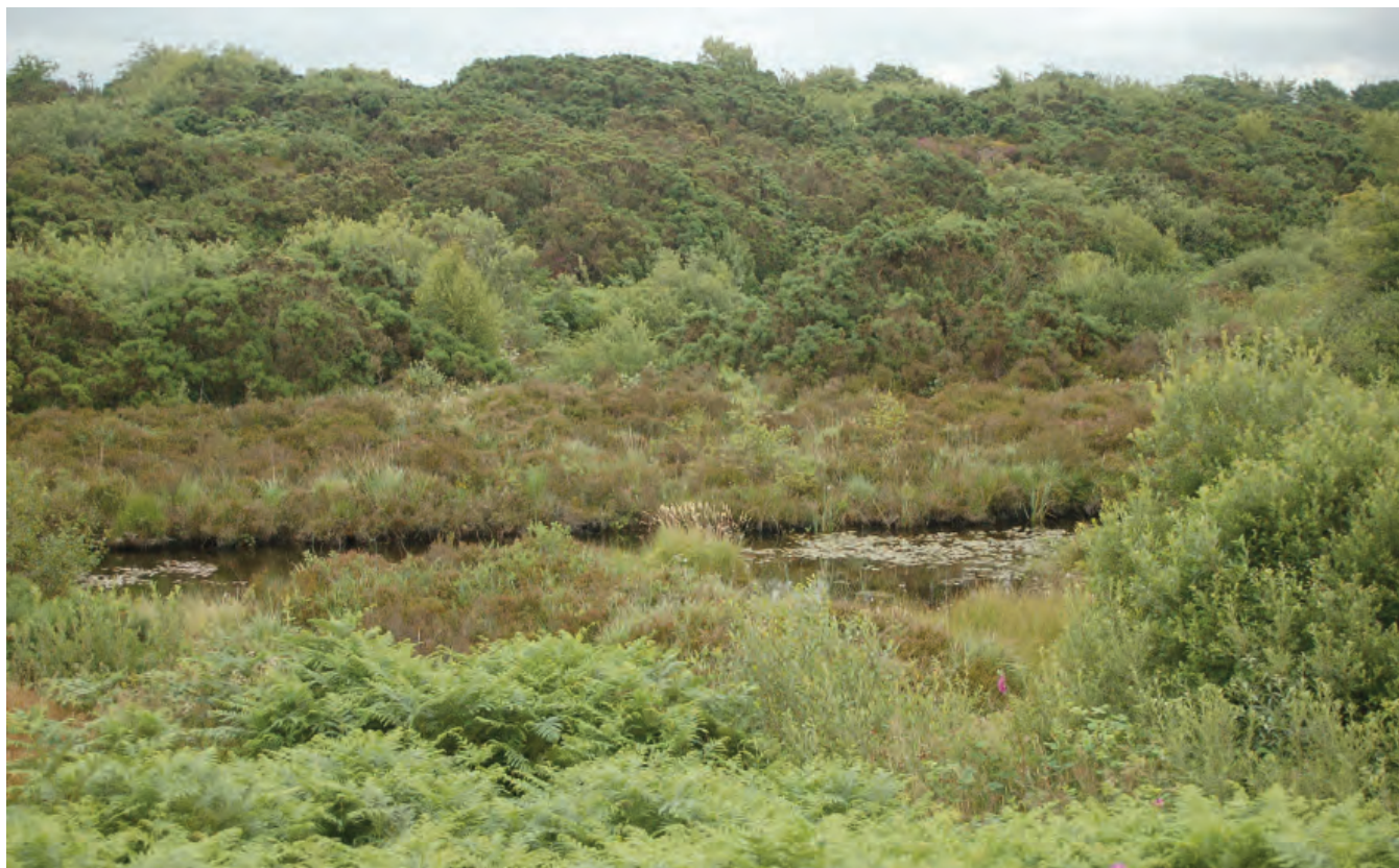
DSC 2257: P3 - Cutover bog community in hollow, with Ling Heather present. Gorse scrub (opposite) and Bracken (foreground) surrounding the wetter depressions.