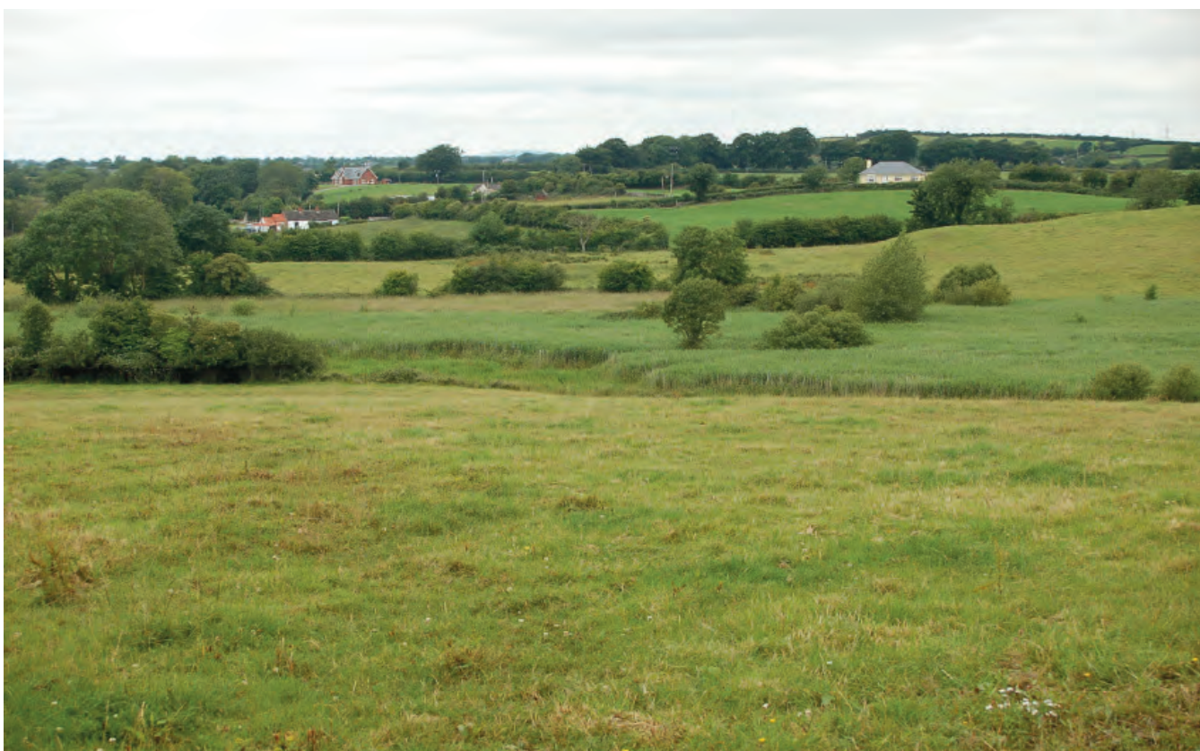
DSC 1993: P2 - Phragmites australis dominated reed bed at the western end of the site. View to north.