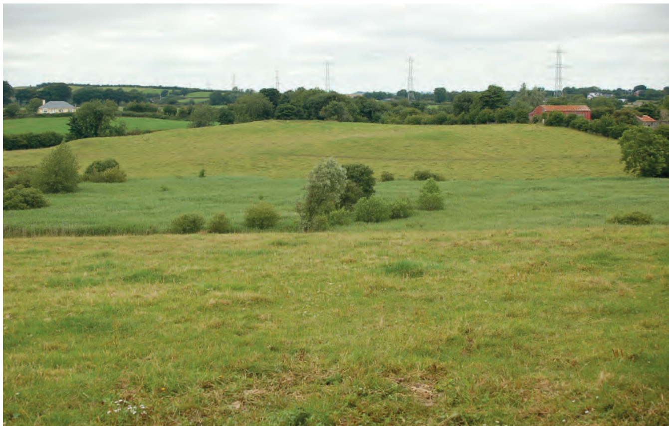
DSC 1994: P2 - Phragmites australis dominated reed bed at the western end of the site. View to north.