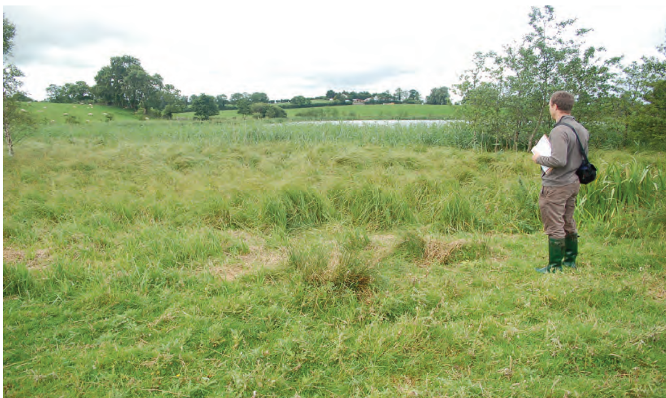
DSC 2059: P2 - Carex acutiformis tall herb area in the east of the site, with reed bed zone around the shore of the lake. View to south-west.