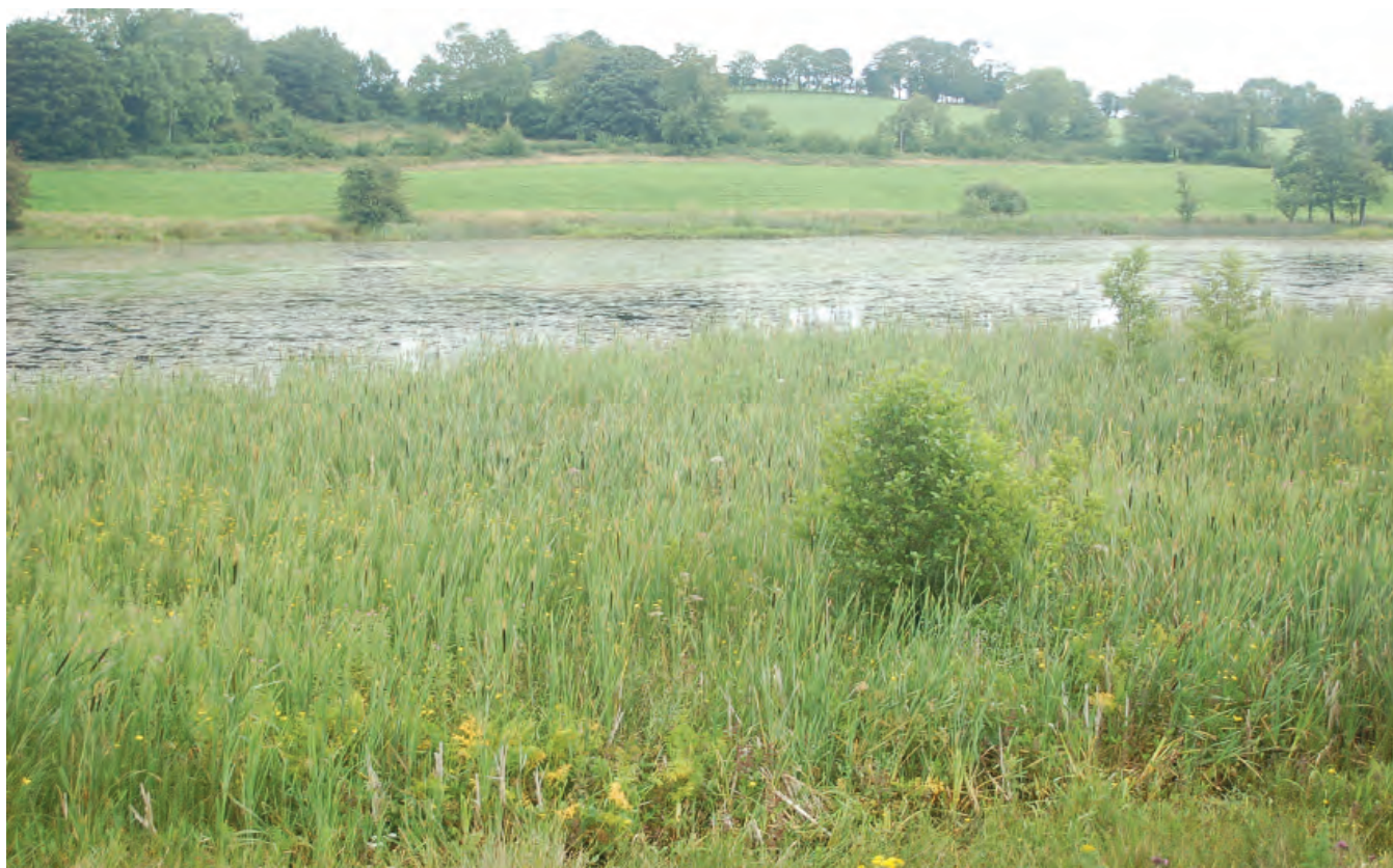
DSC 2317: P4 - North eastern shore of the lake, with Typha latifolia reed bed swamp zone. View to north.