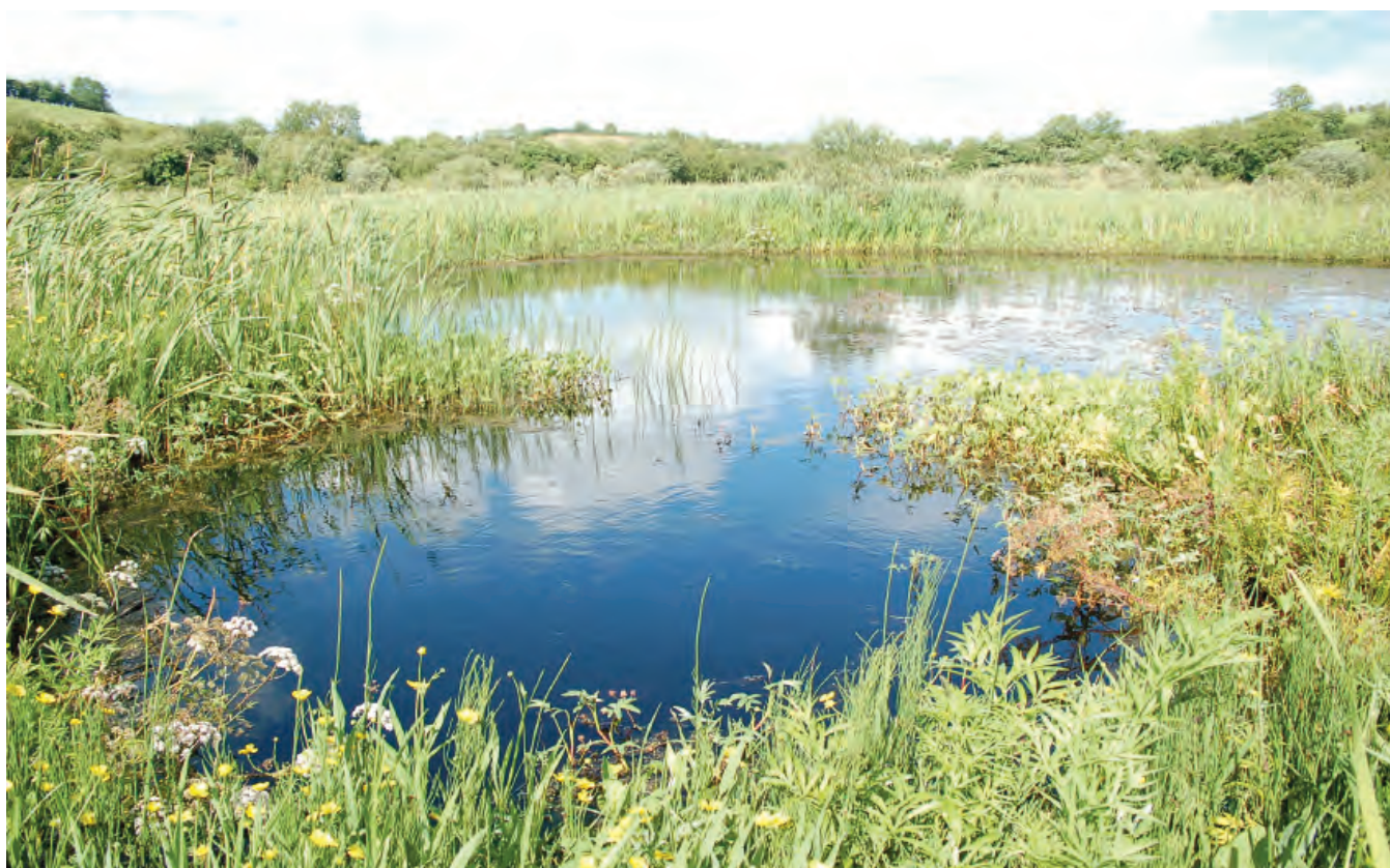
DSC 2114: P3 - Bog pool in the north eastern part of the site, surrounded by Typha latifolia swamp.