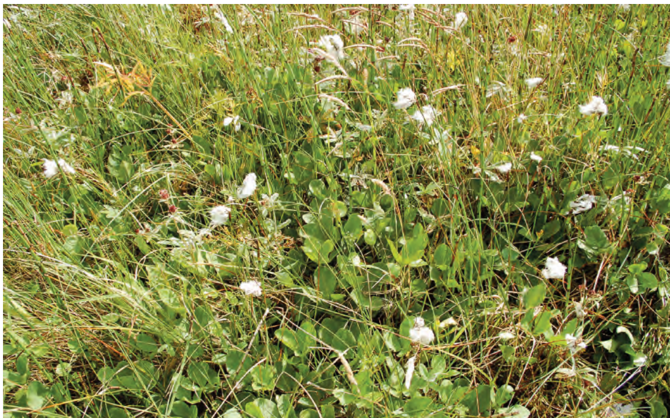
DSC 2103: P3 - Detailed view of the transition mire vegetation at Faltagh, dominated by Bog Bean and Bog Cotton.