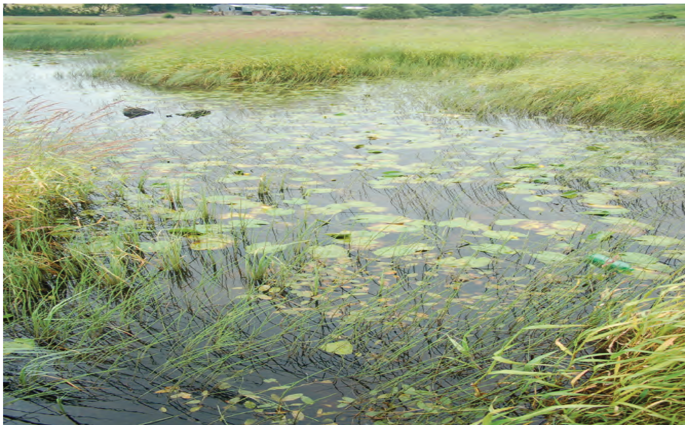
DSC 2211: P3 - Phalaris arundinacea dominated marsh area at the eastern end of the lake, with emergent Carex rostrata and Nuphar lutea .