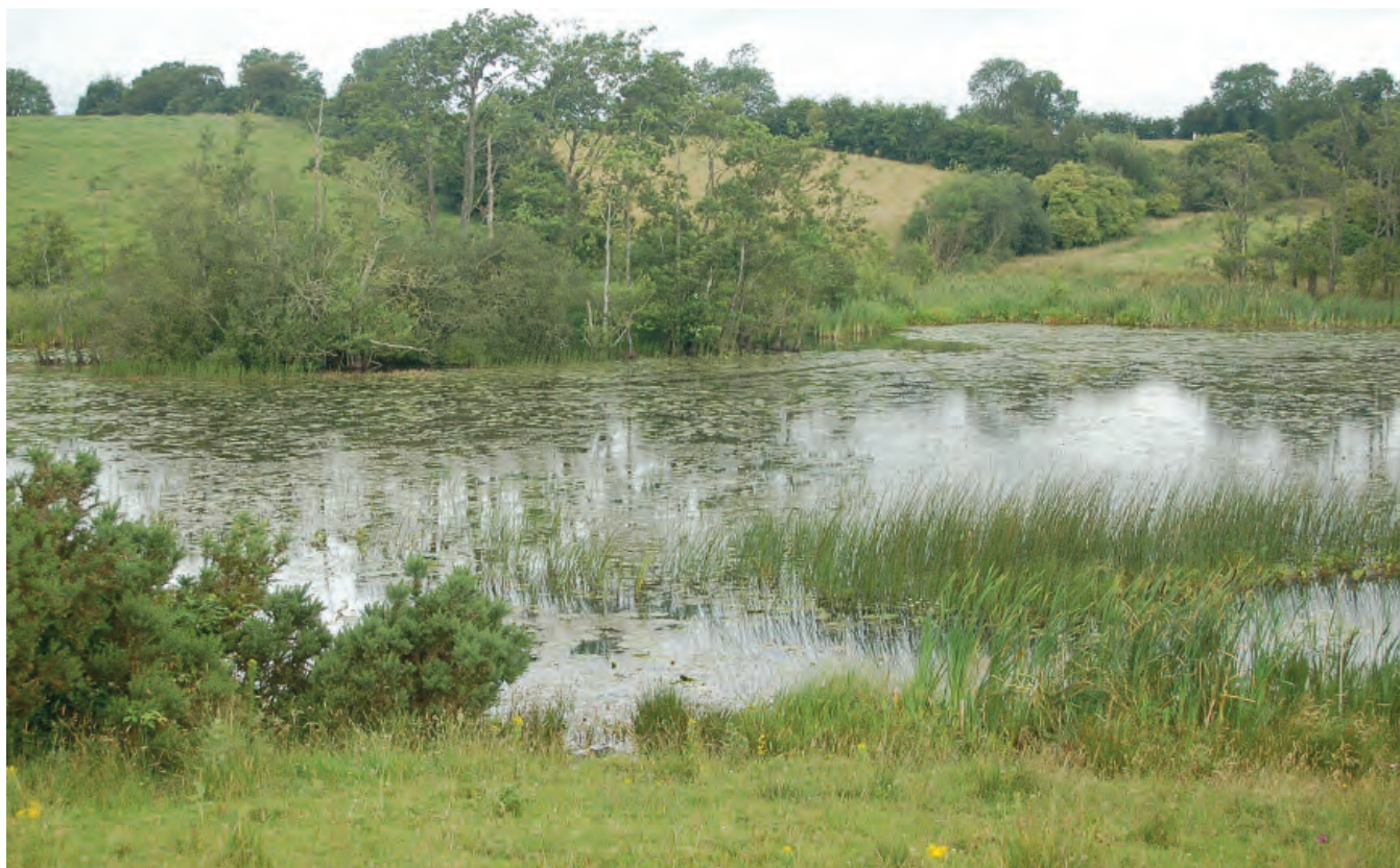
DSC 2320: P5 - North western shore of the lake, with Typha latifolia reed bed swamp zone, and a wooded Crannog in the distance. View to west.