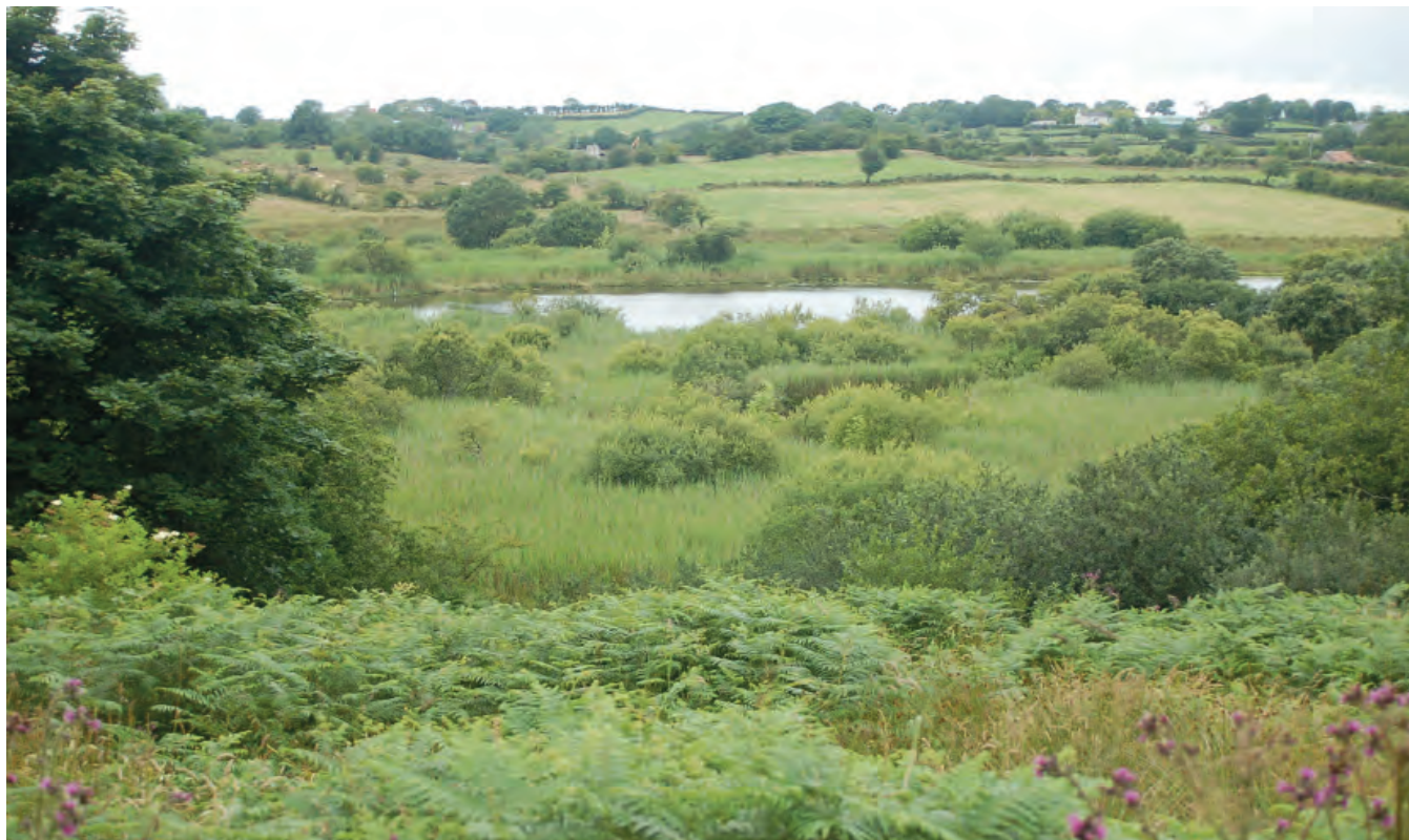
DSC 2231: P1 - General view of western end of Tassan Lough looking north-westwards, with reed bed zone surround the shore of the lake.

Photographs by: Peter Foss unless otherwise stated.