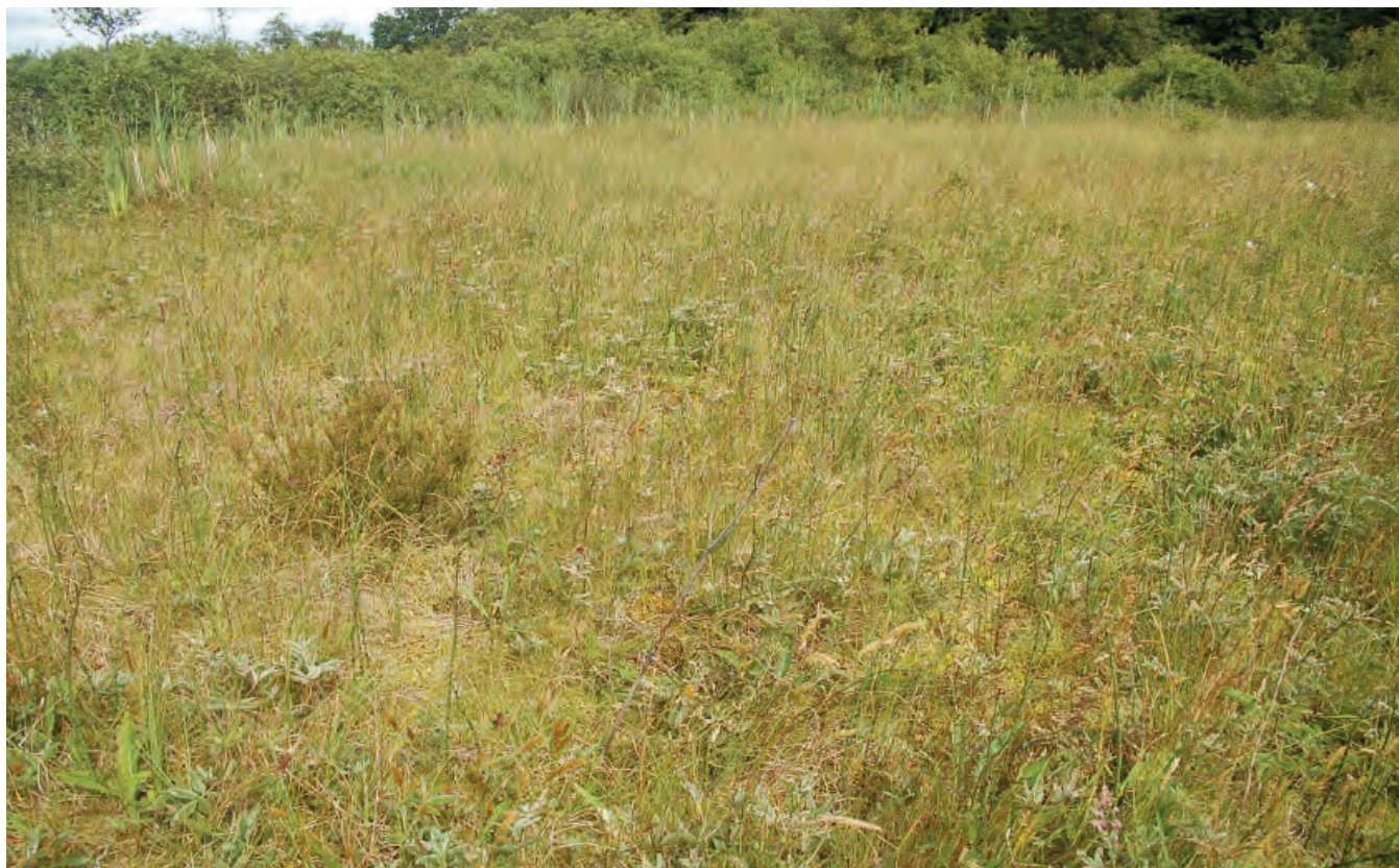
DSC 2545: P7 - Transition mire area forming a broad band around the edge of Lough Nahinch.