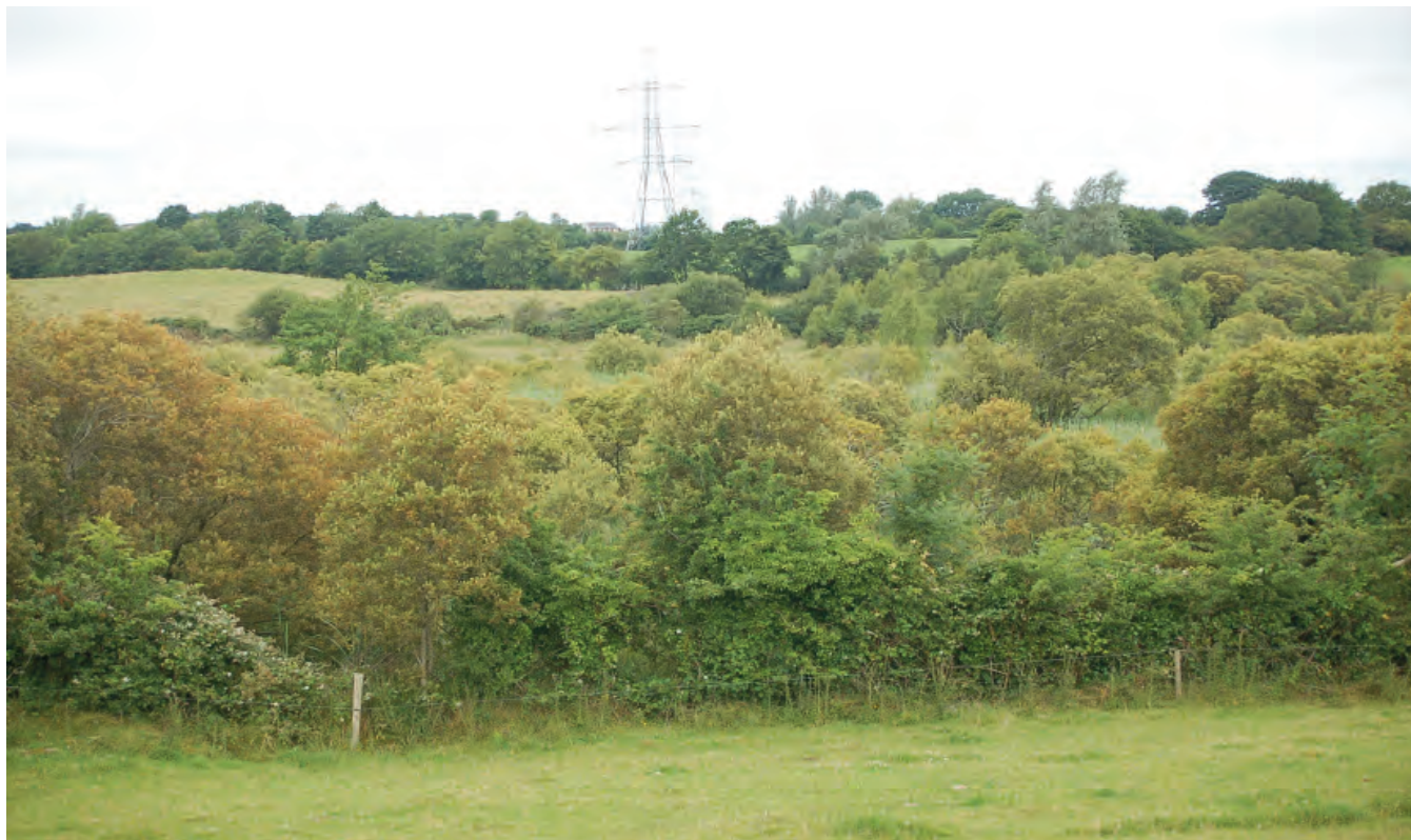
DSC 1979: P1 - Willow scrub area with open glades of transition mire at the eastern end of the site. View to north.