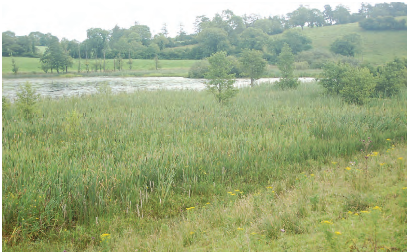
DSC 2316: P4 - North eastern shore of the lake, with Typha latifolia reed bed swamp zone. View to north-east.