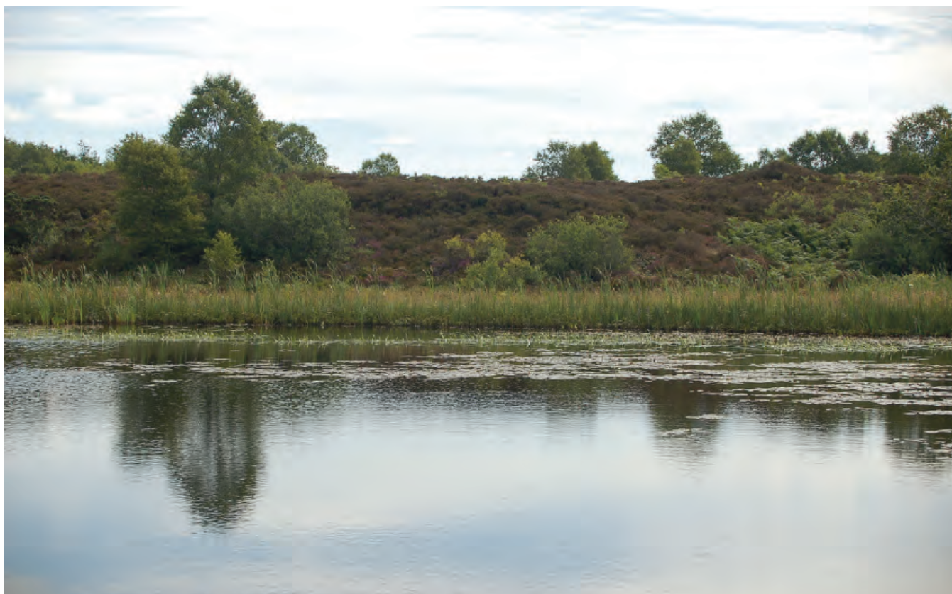
DSC 2564: P7 - Narrow band of reed bed on the eastern shore of the smaller Lough Nahinch, with ridge covered by Calluna vulgaris and Pteridium aquilinum behind. View to east.