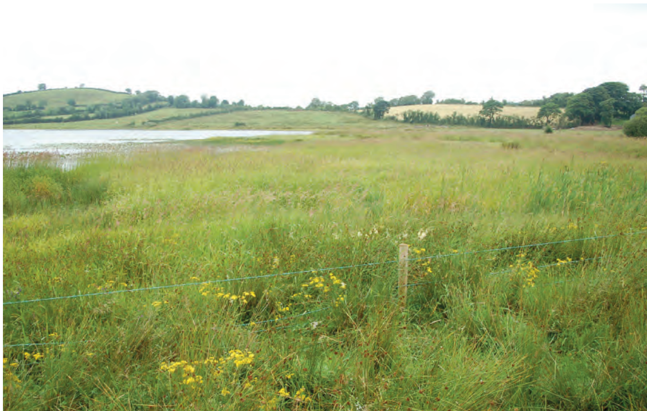
DSC 2206: P2 - Phalaris arundinacea dominated marsh area at the eastern end of Muckno Mill Lough. View to north-west.