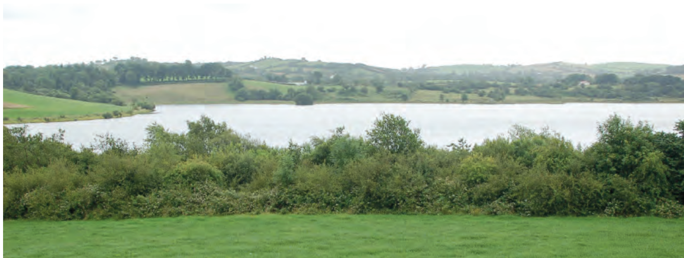
DSC 2177: P2 - Southern shore of the lake, with wet wooded zone in foreground. The remaining lakeshore was dominated by rocky outcrops and a minimal wetland marginal zone adjacent to the improved grassland. View to north.