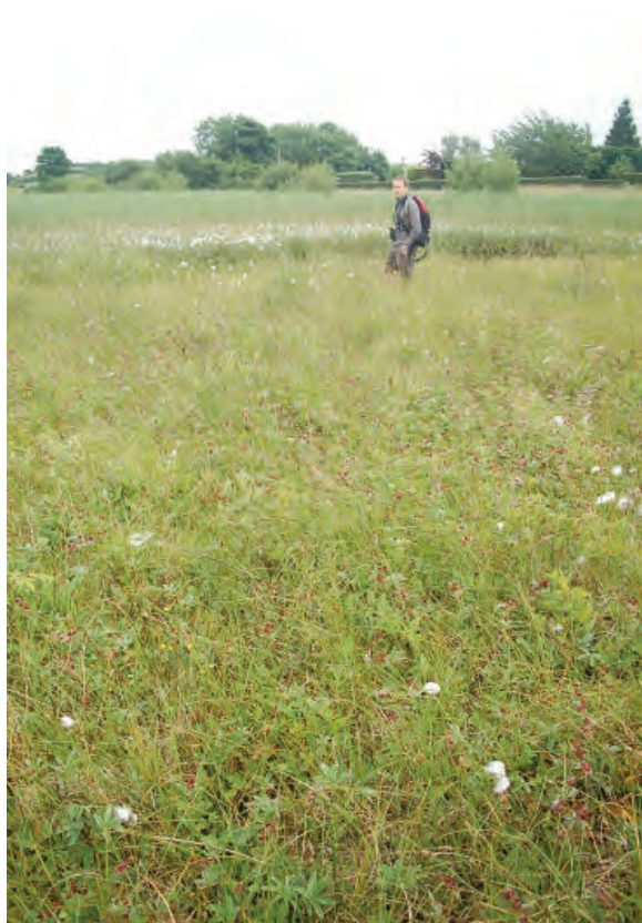
DSC 1963: P1 - Transition mire area on area of cutover bog.