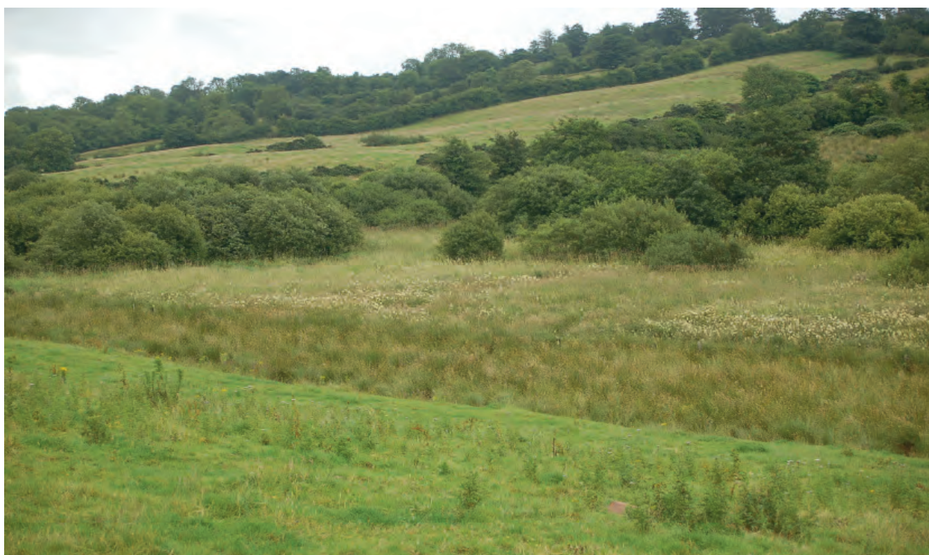
DSC 2277: P1 - Wet marshland area at the western end of the site with wet grassland and scrub vegetation surrounding the wet depression.