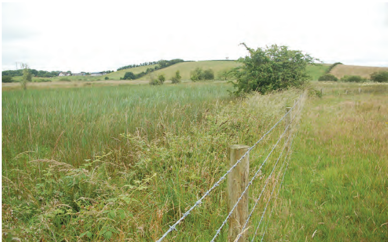
DSC 1974: P4 - Typha swamp area at the eastern end of the lake, with improved grassland on the RHS of the fence. View to north.