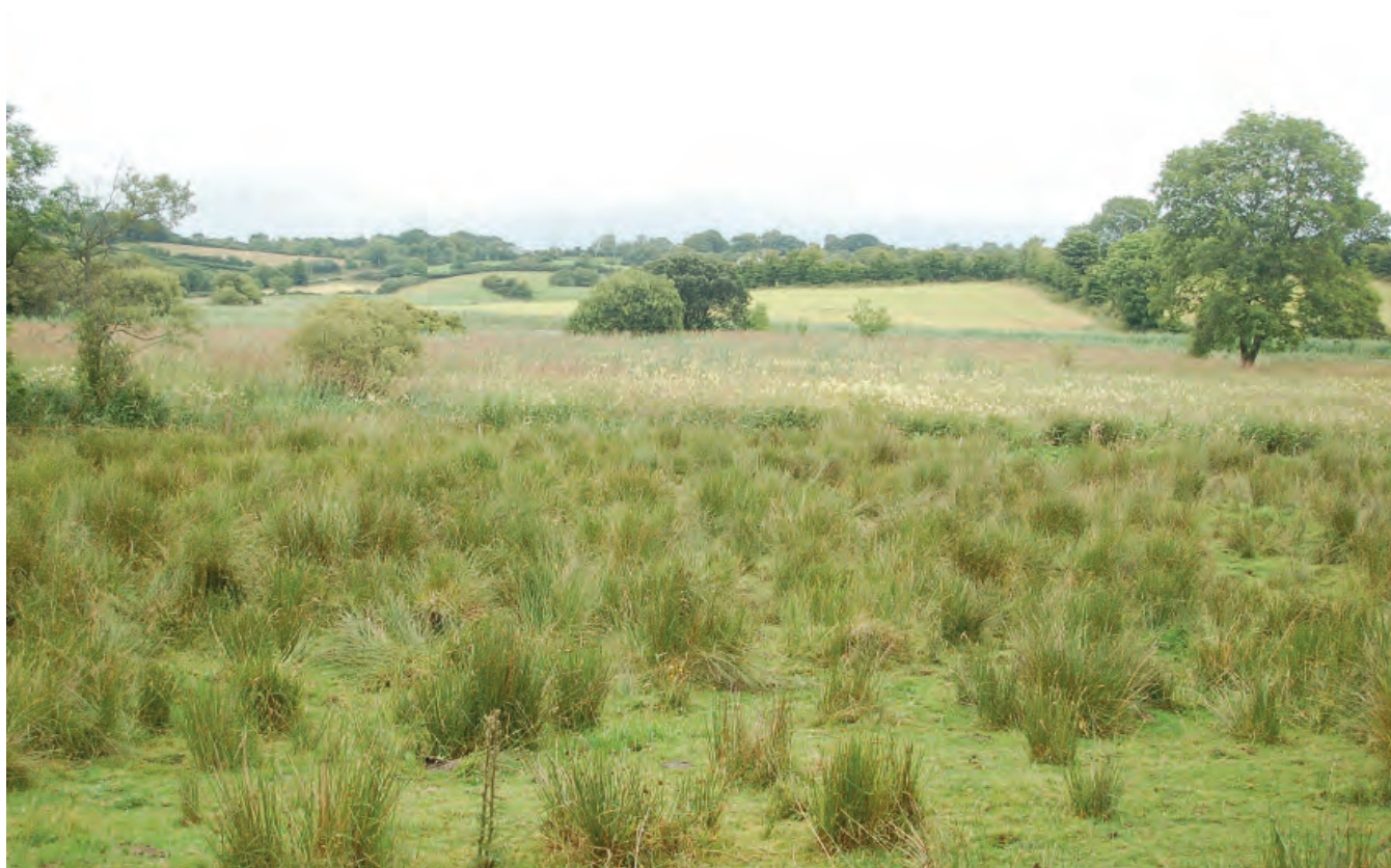
DSC 2227: P4 - View of the southern of the two lakes at Carrickaslane, showing reed swamp area with wet grassland communities in the foreground. View to the south east.