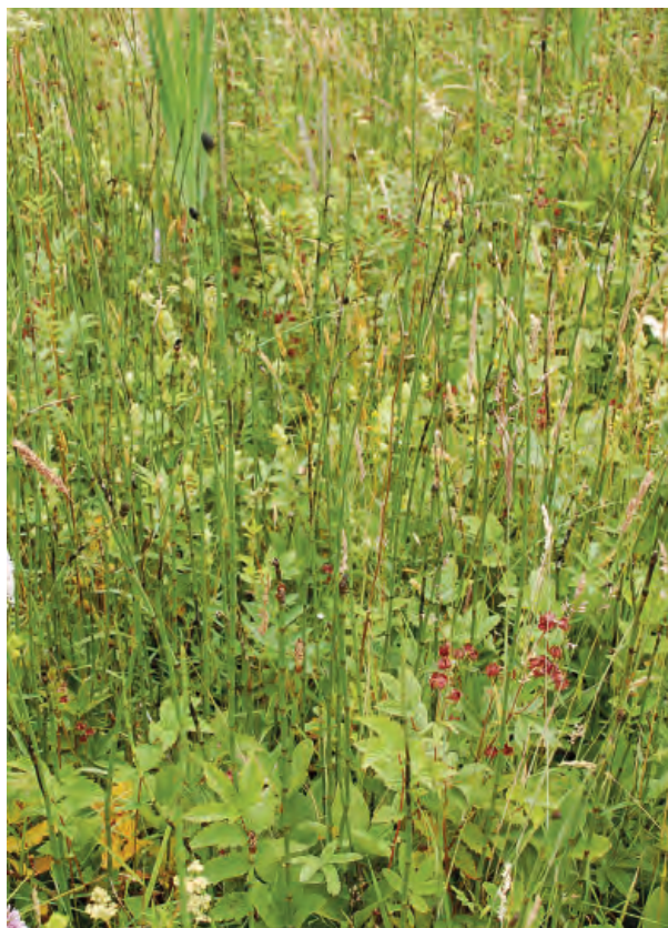
DSC 2194: P2 - Area of transition mire at the northern end of Black Lough.