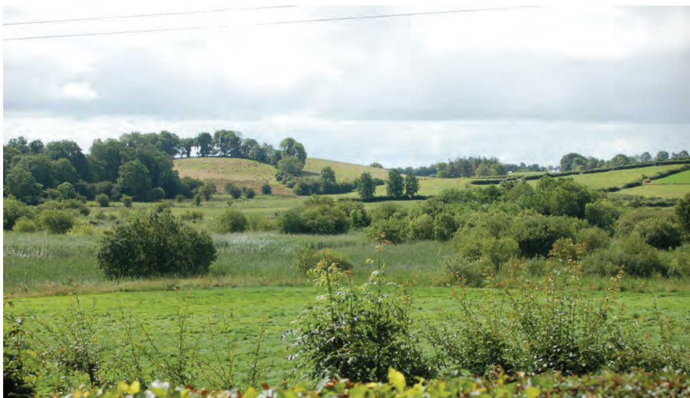
DSC 2419: P2 - View to the south-west over the northern of the two lakes marked on 6 inch OS map. There is a broad area dominated by reed beds which are infilling the lake, with willow scrub forming a fringe with the adjacent pasture.