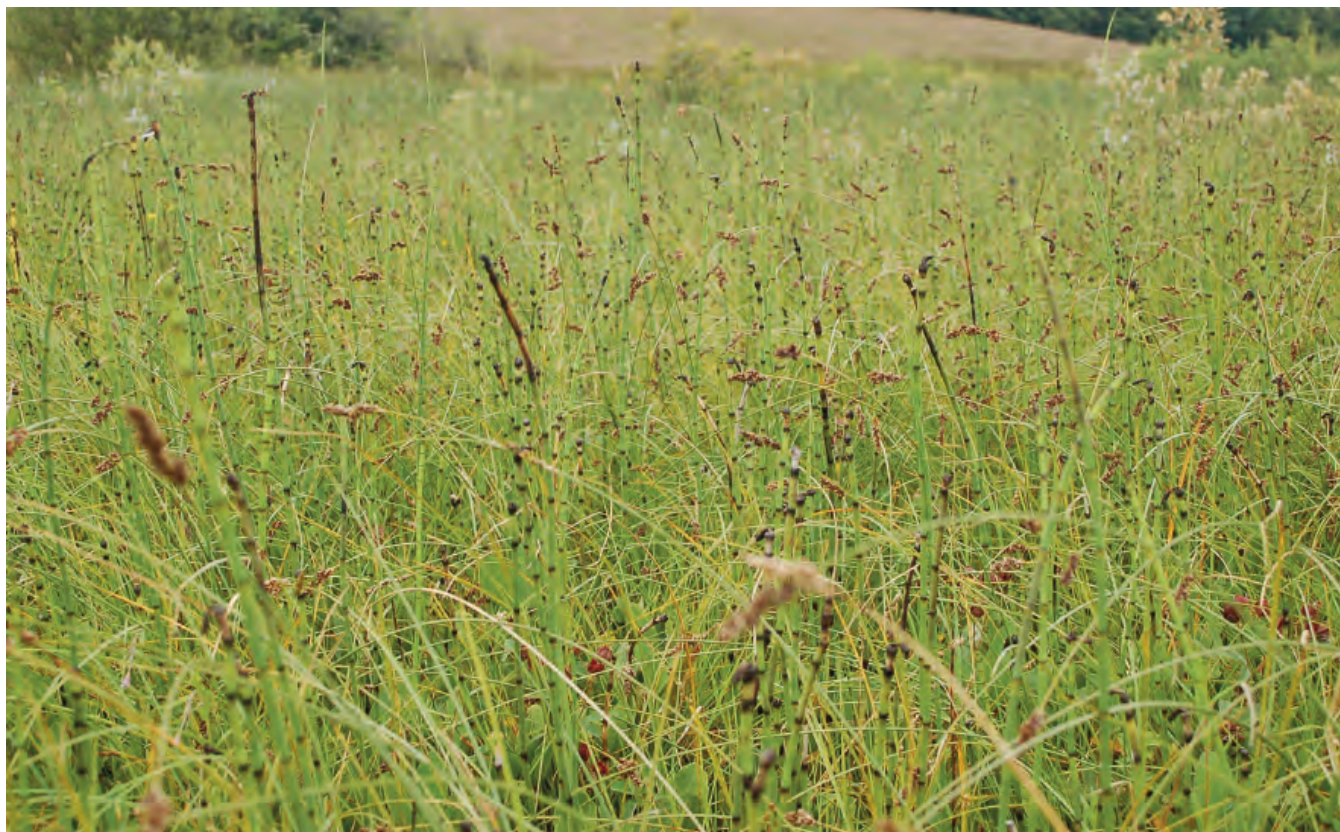
DSC 2140: P5 - Carex diandra dominated transition mire area on the western section of Corlea.