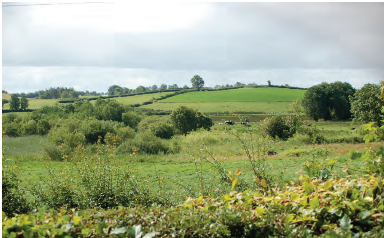
DSC 2420: P3 - View along the south-west edge of the site, with willow scrub forming a fringe with the adjacent wet grassland.