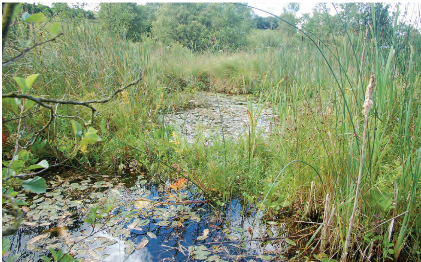
DSC 2415: P3 - Cladium fen area (LHS) and swamp community at the northern end of the small lake on the site. View to the south east over the infilling lake.