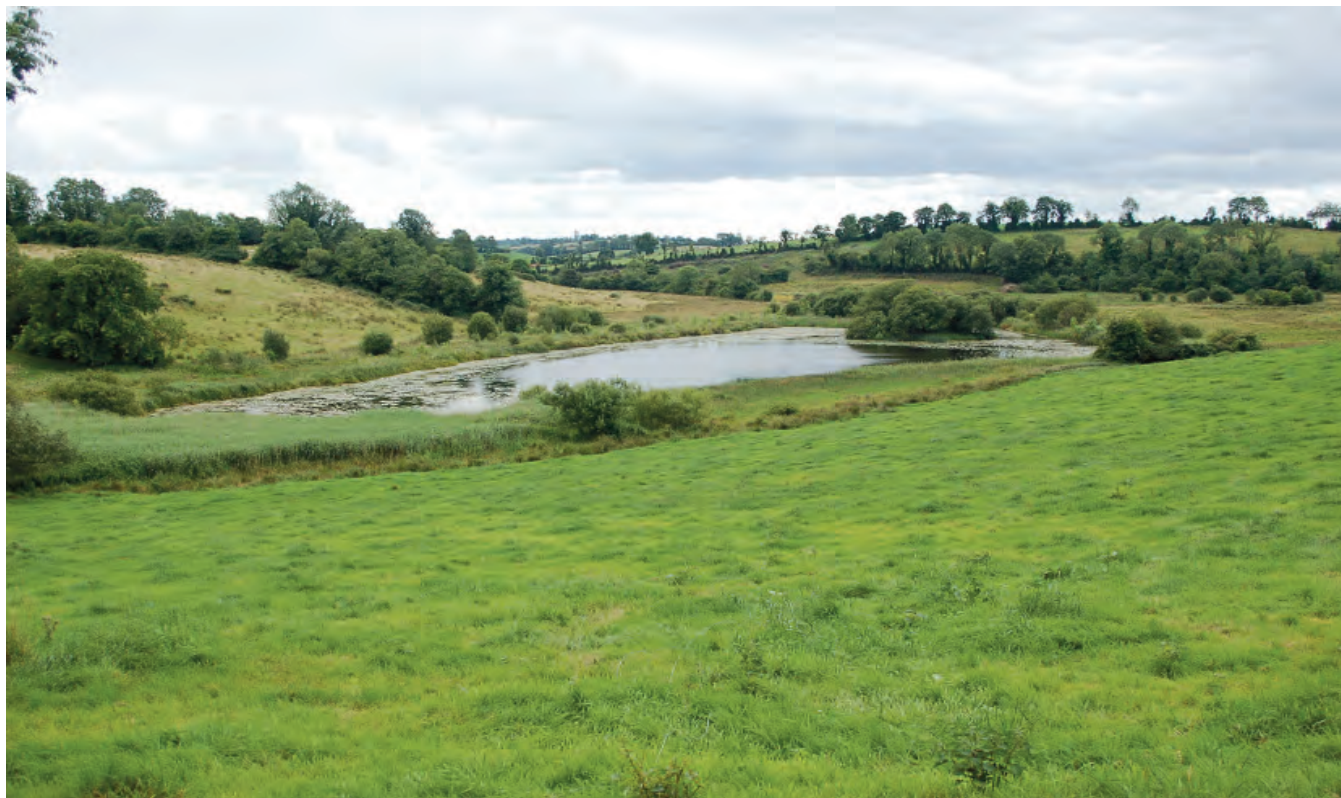
DSC 2491: P1 - View over Drumaveale Lough to the north-east. The lake is surrounded by a wide zone of reed beds, in particular at the south western end. A wooded crannog is located at the northern end of the lake.