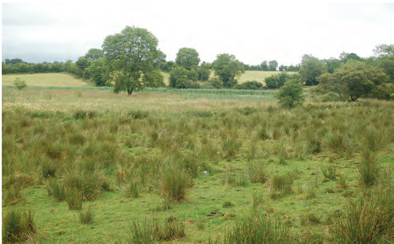
DSC 2226: P3 - View of the southern of the two lakes at Carrickaslane, showing marginal wet swamp area with wet grassland communities in the foreground. View to the south east.