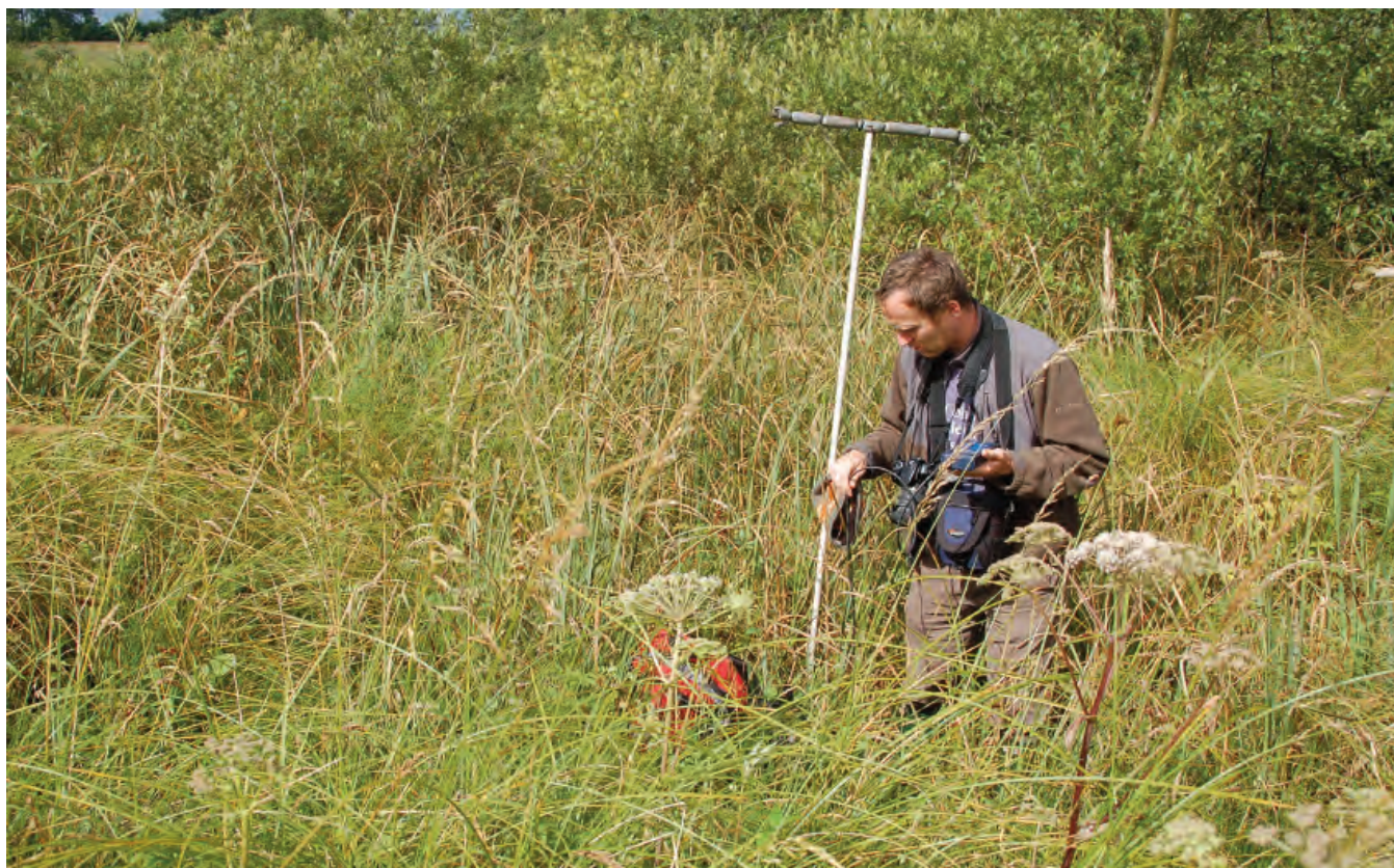
DSC 2402: P3 - Cladium mariscus fen area at the northern end of the small lake on the site.