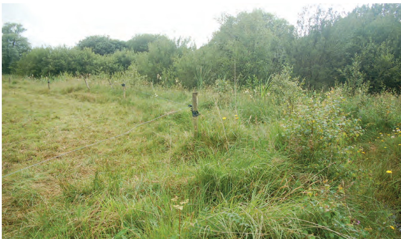
DSC 2351: P2 - The boundary area between the improved grassland and wetland vegetation on the southern shore of the two lakes at Bishops Lough.