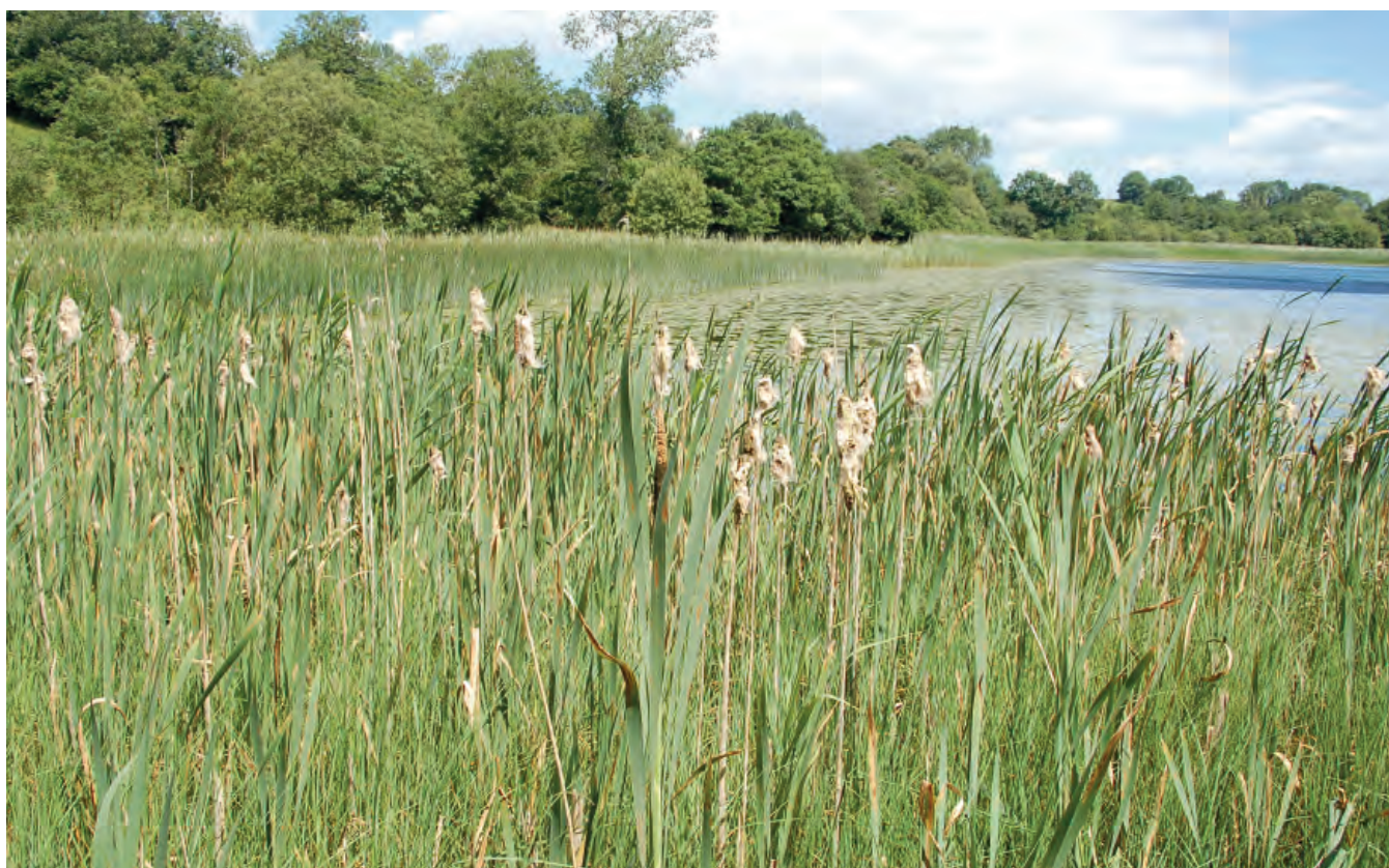
DSC 2449: P4 - View from the western shore of Aghafin Lough showing the fringing Typha latifolia swamp area which surrounds all of the lake, with wet willow alder woodland behind.