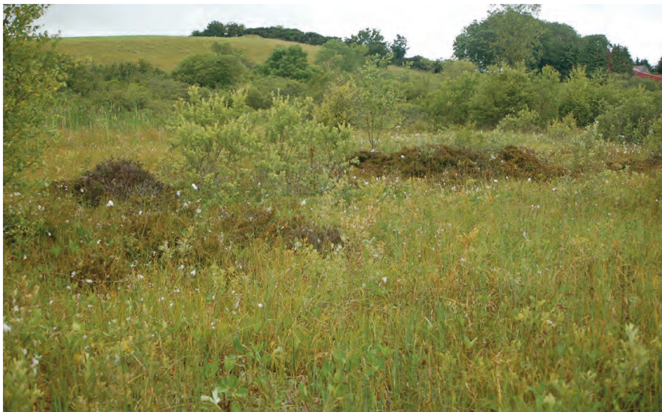
DSC 2146: P6 - General view of the edge of the Carex diandra dominated transition mire area on the western section of Corlea with scattered Ling Heather areas where a more acid bog flora was present.