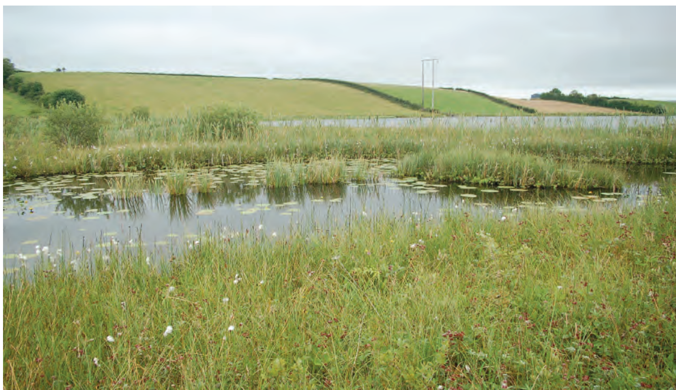
DSC 1958: P2 - Transition mire area on area of cutover bog with larger bog pool areas on the western shore of Drumganny Lough, with Carex diandra and Eriophorum angustifolium . The main lake can be seen in the background. View to east.