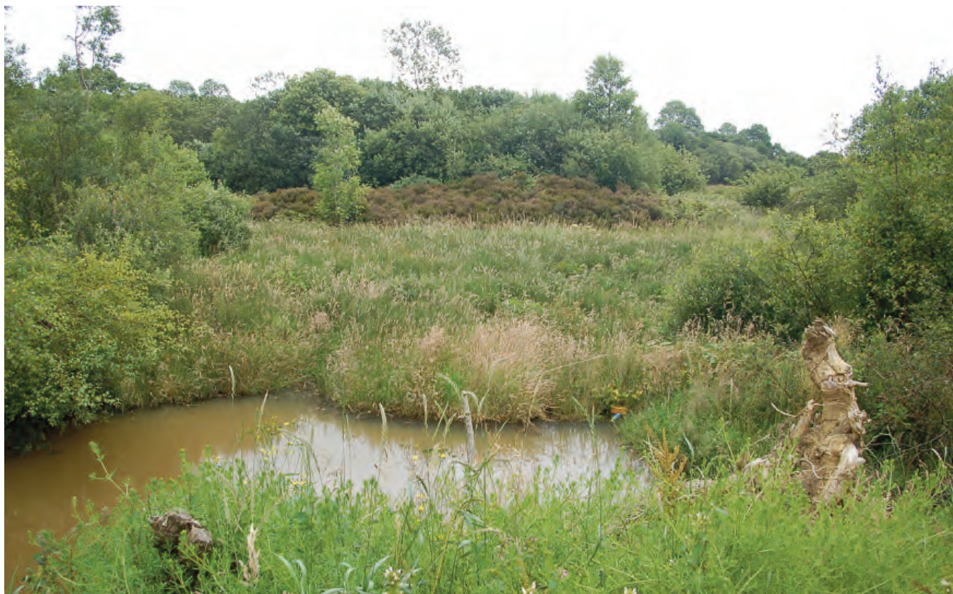
DSC 2134: P4 - Area of cutover bog adjacent to the recently infilled wetland area on the eastern section of Corlea. Ling Heather dominated peat hag occurs in the center. View to east.