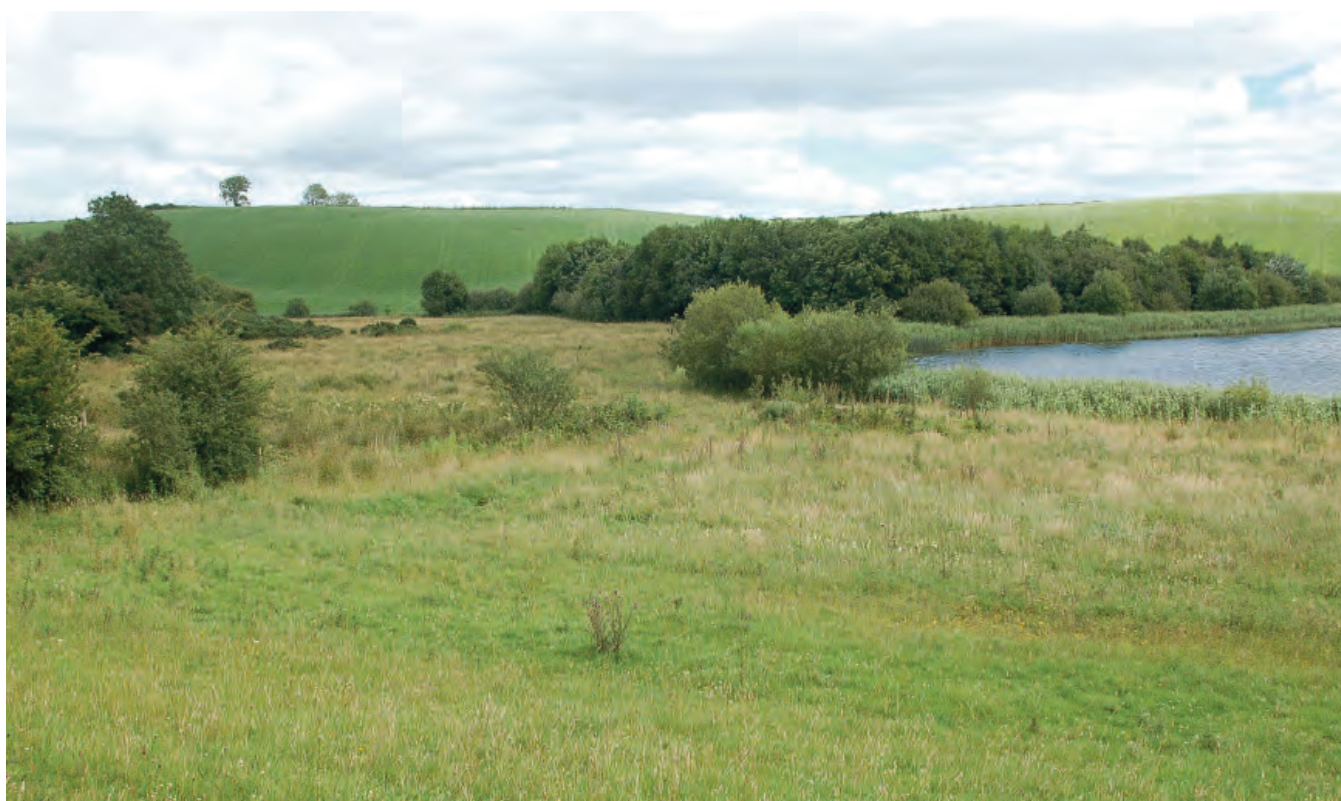
DSC 2066: P2 - The northern Annyalty Lough, looking to north-east, showing a fringe of reed bed and wet grass-land surrounding the lake, with scattered wet willow and alder woodland in the distance.