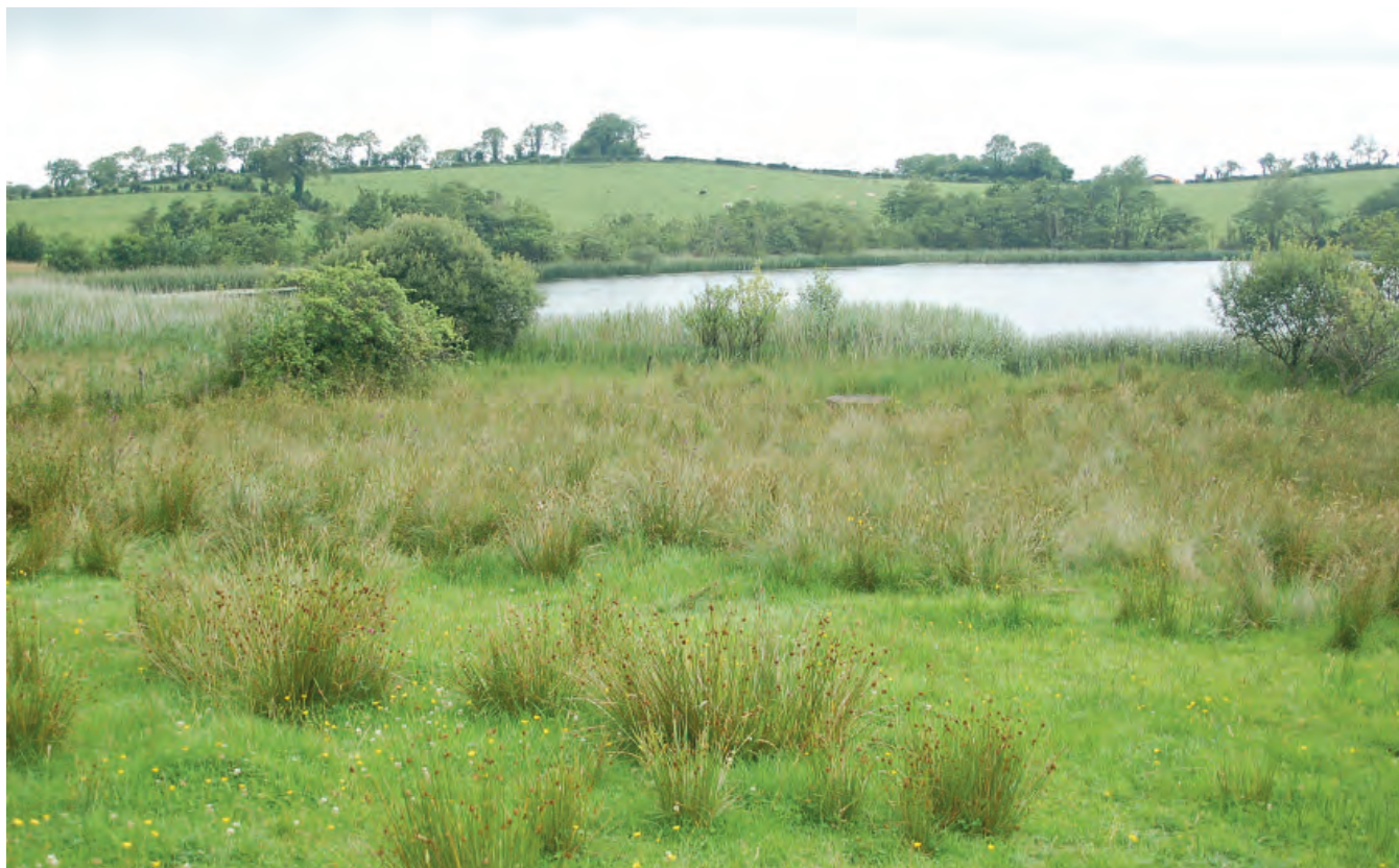
DSC 2378: P2 - Southern shore of Clonkeen Lough showing area wet grassland in foreground with a narrow band of Carex diandra transition mire near lake.