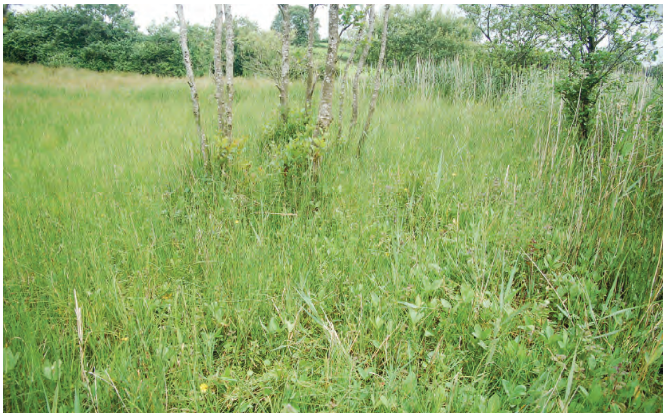
DSC 2379: P2 - Carex diandra transition mire on the southern shore of Clonkeen Lough.