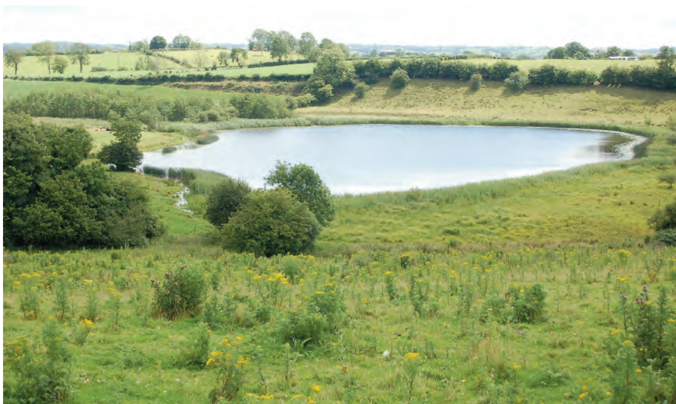
DSC 2074: P2 - General view of Drumgoast Lough with fringing reed communities. A wet marshland area occurs on the lakeshore in the foreground and the base of the drumlin. View to south.