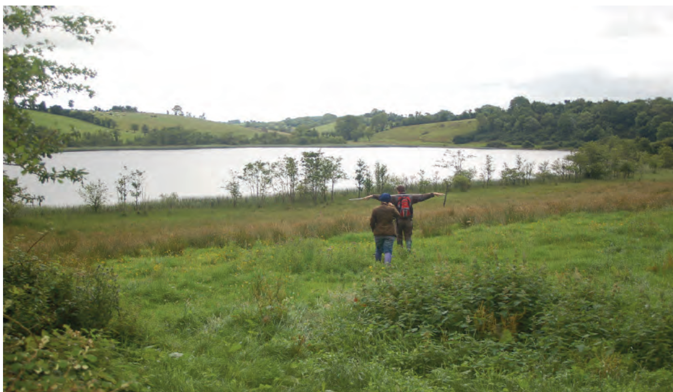
DSC 2376: P2 - Southern shore of Clonkeen Lough showing area of semi-improved pasture in foreground, with wet grassland near lake. A narrow band of Carex diandra transition mire occurs on the landward side of the trees fringing the lake. View to the north.