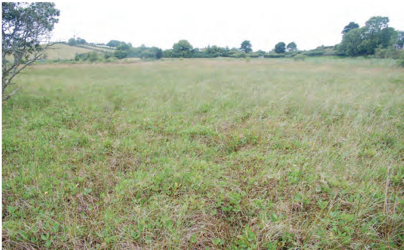
DSC 2169: P4 - Transition mire community on the south-eastern part of the site. View to the north.