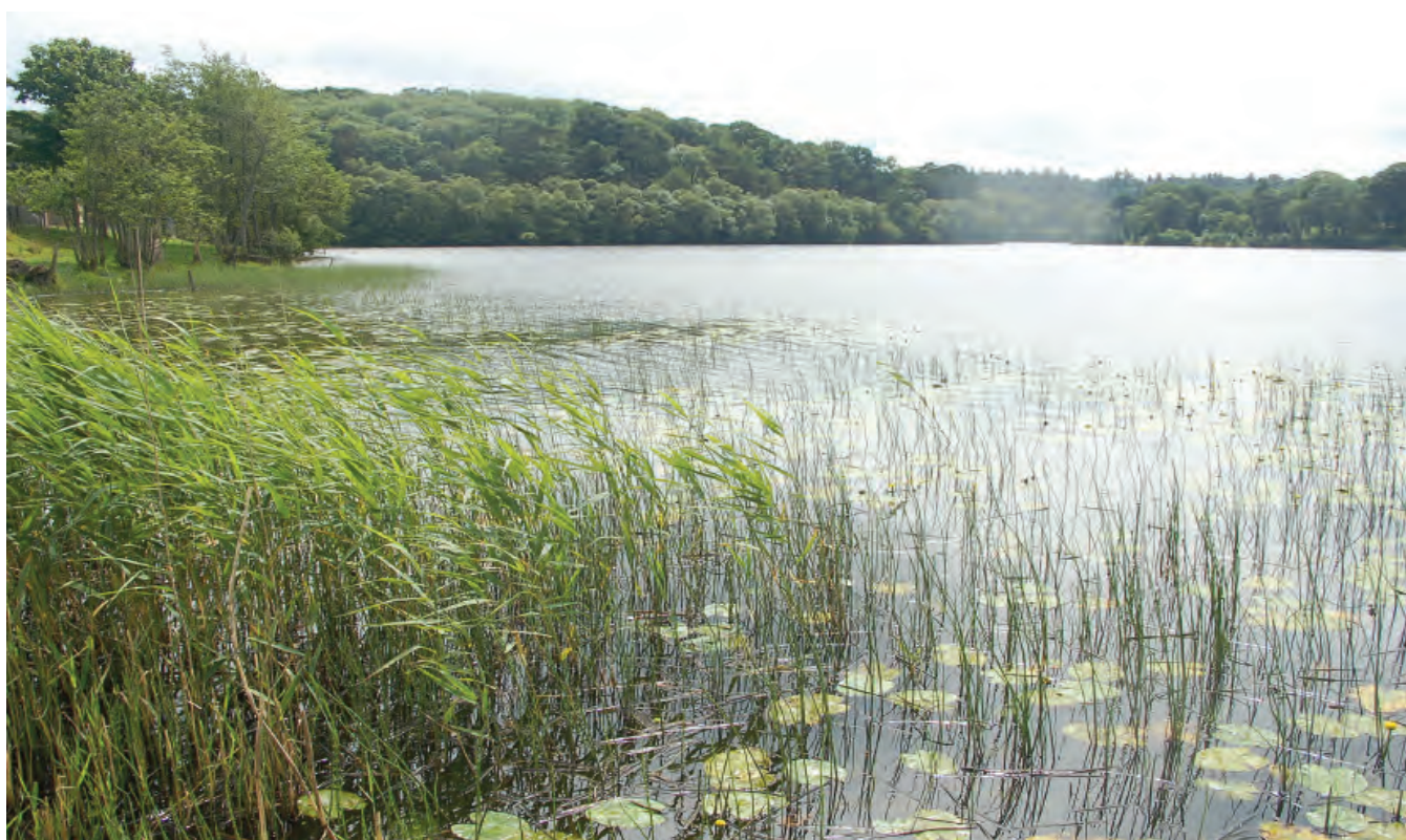
DSC 2183: P2 - View along the north eastern shore of Lough Bawn, with sparse reed bed vegetation in the foreground and extensive mixed deciduous woodland extending down to lakeshore in the distance.