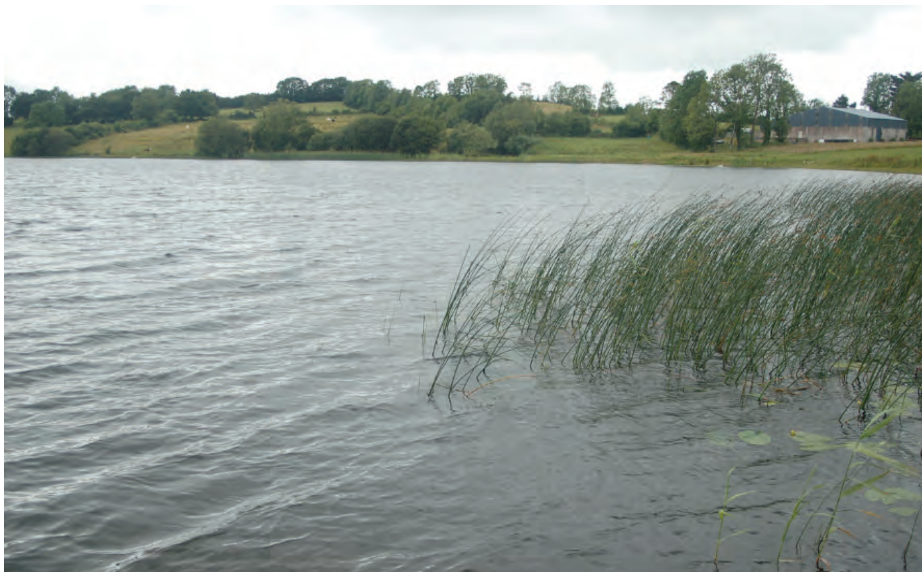
DSC 2264: P3 - Emergent reed bed zone on the north-western shore of Corravoo Lough with improved pasture coming down to lake in many parts, resulting in only a narrow wetland zone. View to south-west.