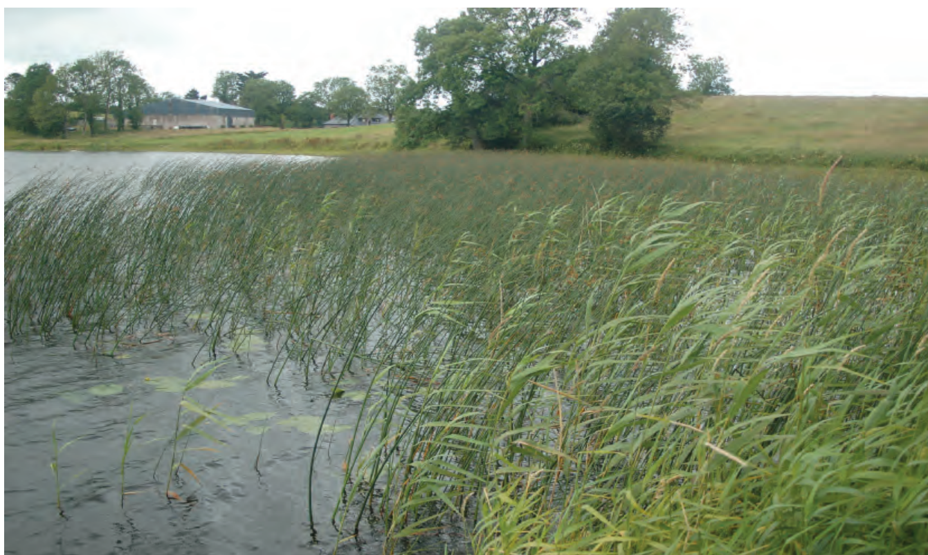
DSC 2263: P2 - Emergent reed bed zone with Schoenoplectus lacustris and Phragmites australis on the north-eastern shore of Corravoo Lough. View to north-west.