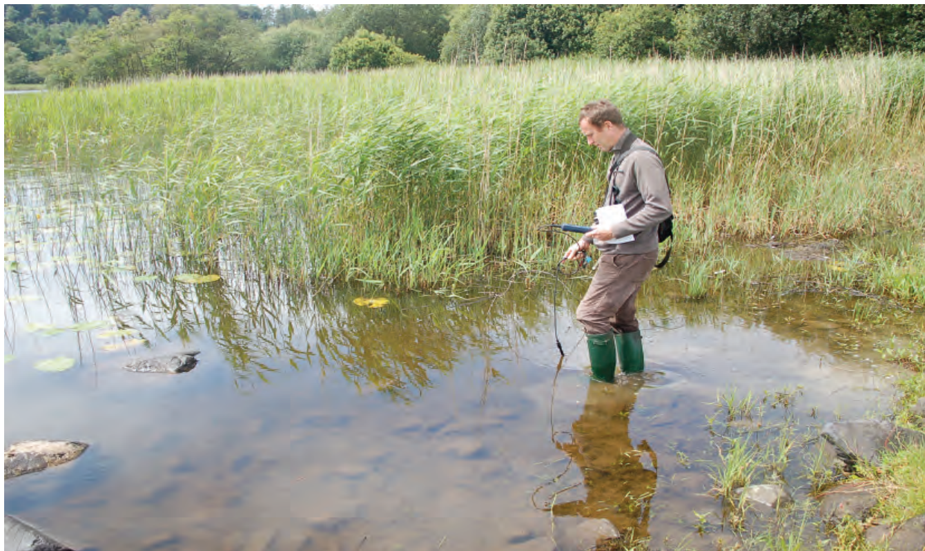
DSC 2182: P1 - Taking water conductivity reading in the reed bed formed by Phragmites australis on the northern shore of Lough Bawn.

Photographs by: Peter Foss unless otherwise stated.