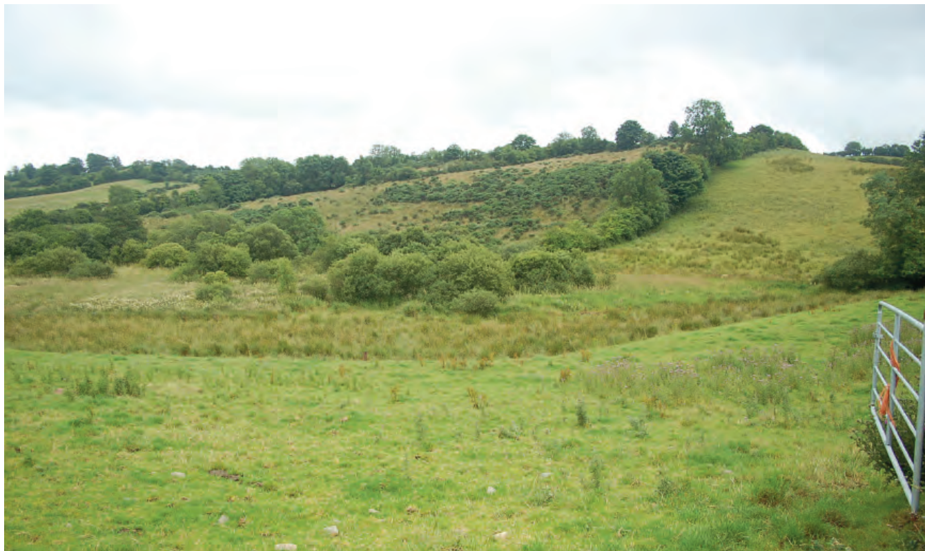
DSC 2276: P1 - Wet marshland area at the western end of the site with wet grassland, wet woodland vegetation surrounding the wet depression, with scrub on higher ground.