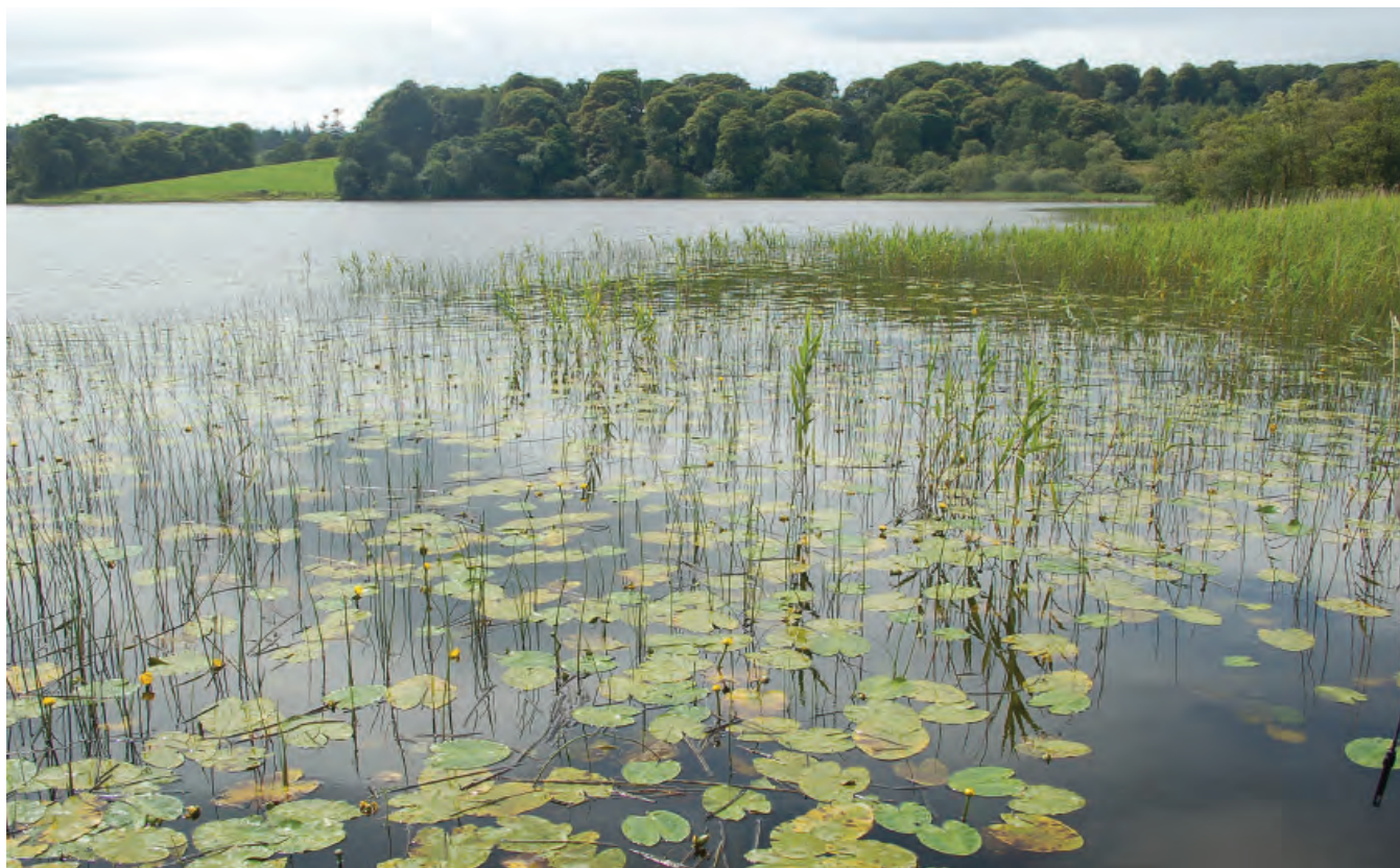
DSC 2184: P3 - View along the north western shore of Lough Bawn, with sparse reed bed vegetation in the foreground and extensive mixed deciduous woodland extending down to lakeshore in the distance.