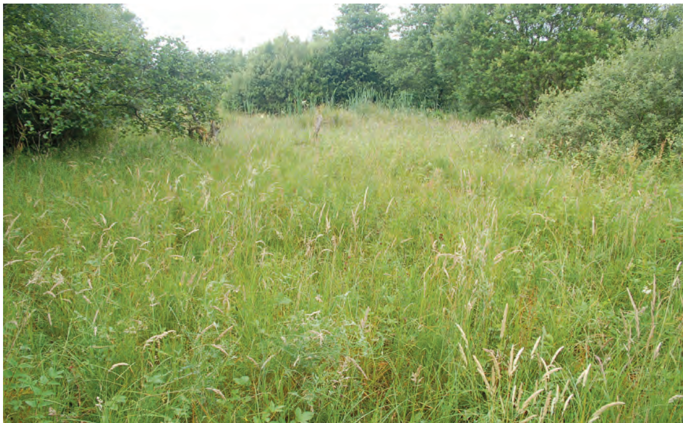
DSC 2417: P4 - Marsh area with wet willow woodland on the north and western side of the site. View to the west.