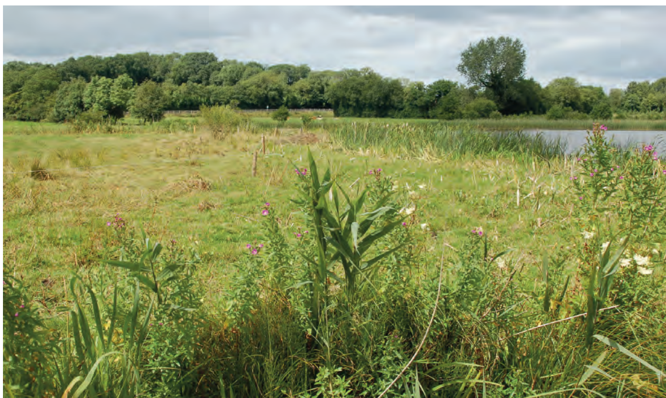
DSC 2459: P4 - Western shore of Clonoony Lough, showing area of rough pasture and the narrow reed fringe present on this side of the lake. View to north.