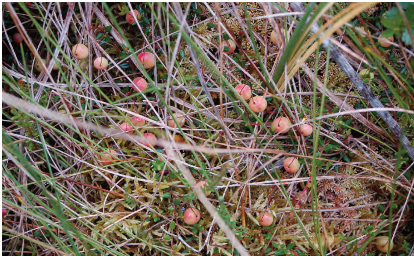
DSC 2172: Cranberry ( Vaccinium oxycoccus ) growing on low Sphagnum hummocks on the area of regenerating cutover raised bog in the north east of the site.