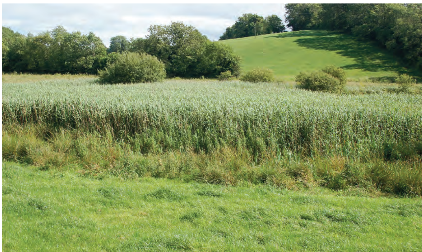
DSC 2492: P2 - View over reed beds dominated shore at the south western end of the lake.