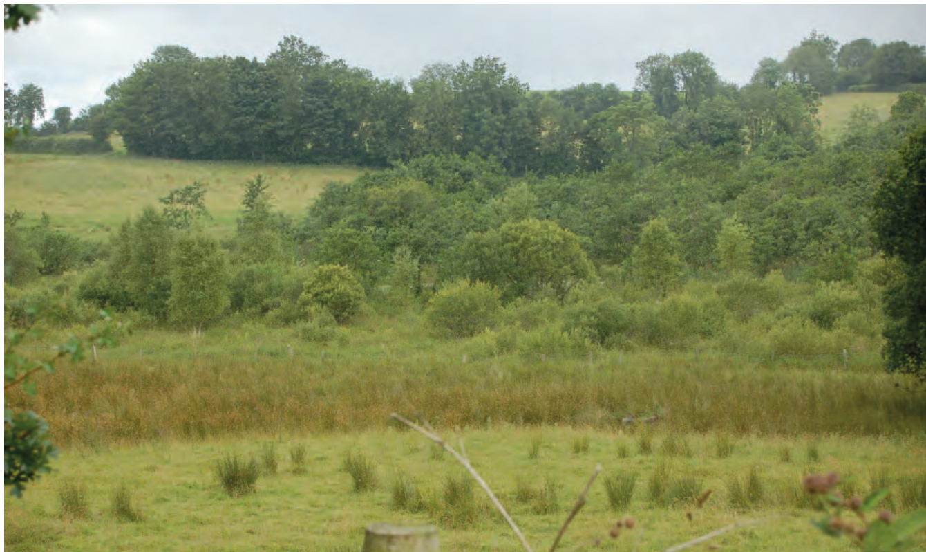
DSC 2387: P1 - View over the south eastern end of the site, with wet grassland in the foreground, marsh and willow scrub community behind. View to the north west.