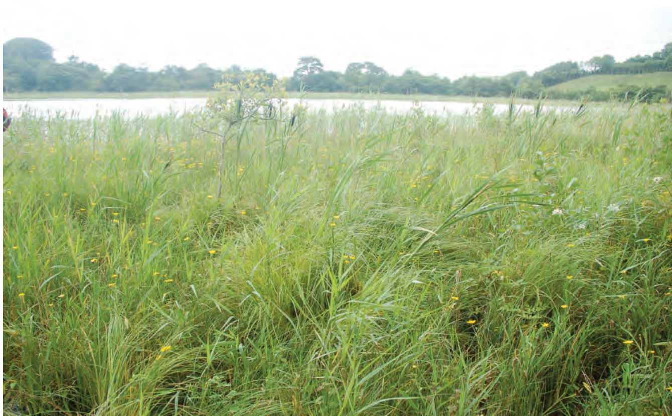
DSC 2359: P4 - The Carex disticha swamp vegetation around the north western of the two lakes at Bishops Lough. View is to the east.