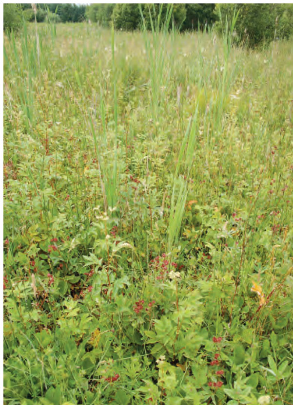
DSC 2192: P2 - Area of transition mire at the northern end of Black Lough.