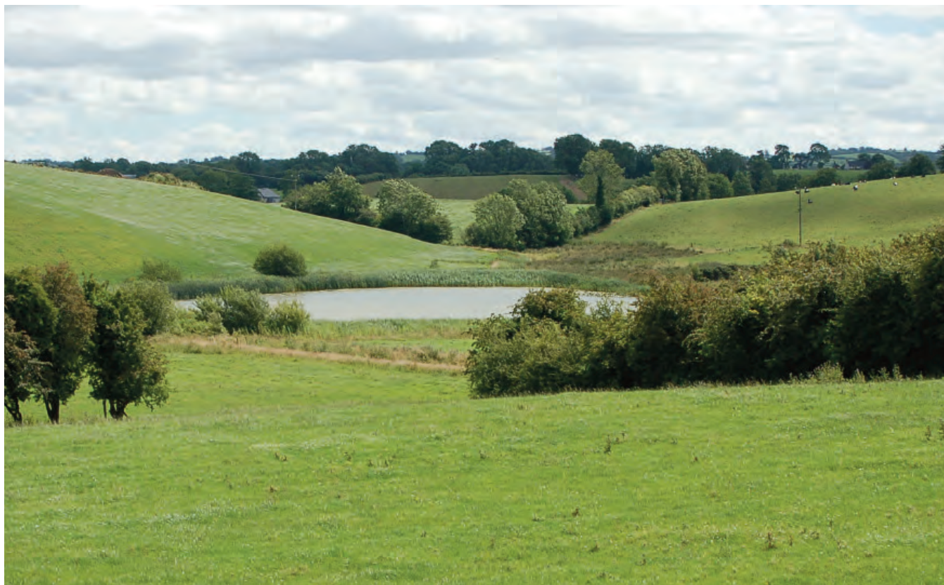
DSC 2069: P3 - The southern Annyalty Lough, looking south, showing a fringe of reed bed surrounding the lake and the relatively steeply sloped drumlins and improved grassland surrounding lake.