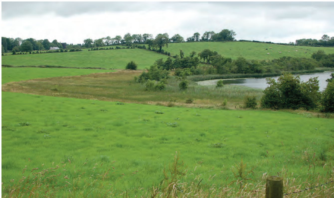
DSC 2373: P1 - Western shore of Clonkeen Lough showing area of improved pasture in foreground, with wet grassland near lake and reed bed fringe with willow and alder scrub at the lake edge. View to the north.