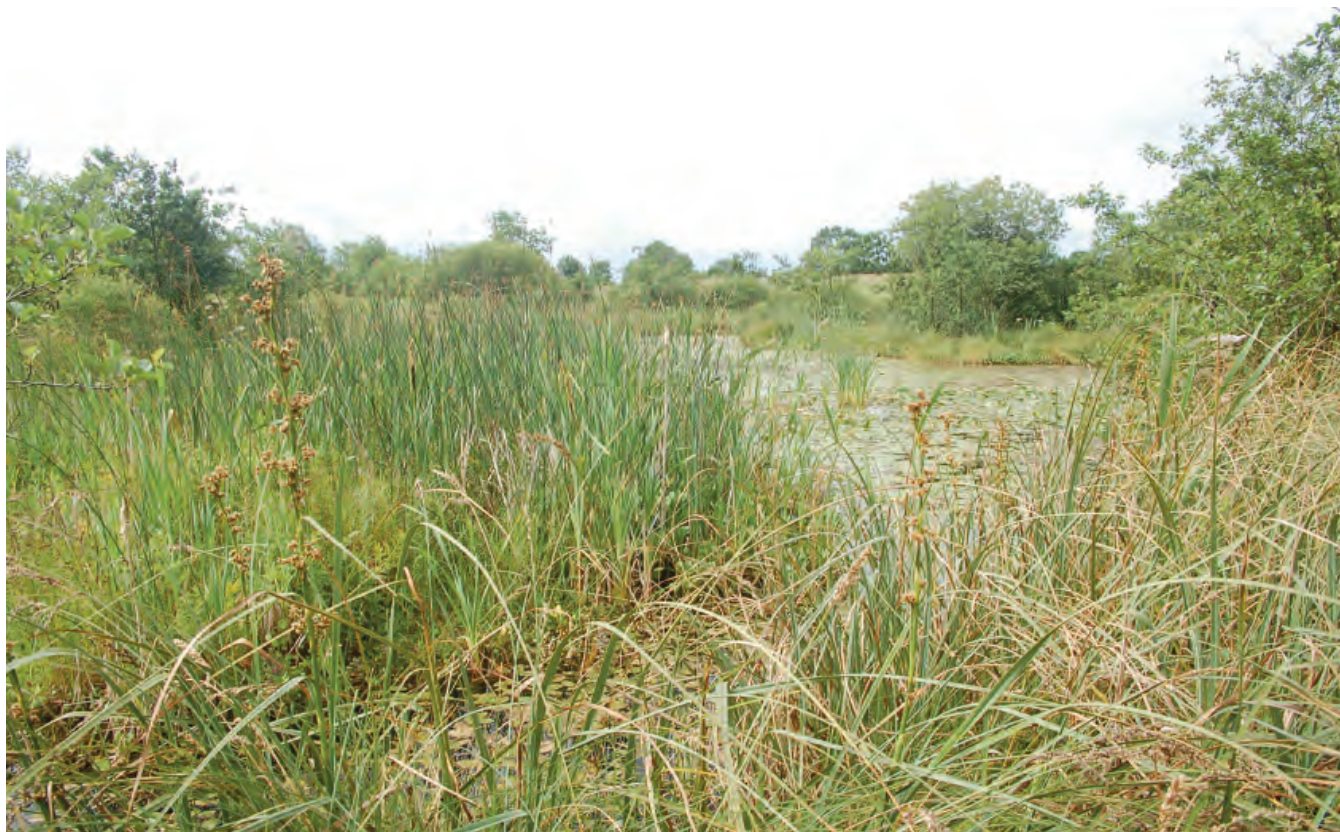
DSC 2407: P3 - Cladium mariscus fen area at the northern end of the small lake on the site. View to the south over the infilling lake.