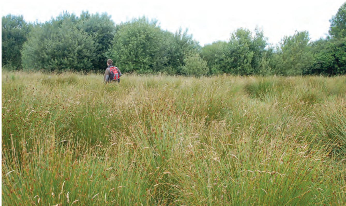
DSC 2426: P1 - Wet grassland area dominated by Juncus effusus at south western edge of the site, with willow dominated cutover bog behind.

Photographs by: Peter Foss unless otherwise stated.