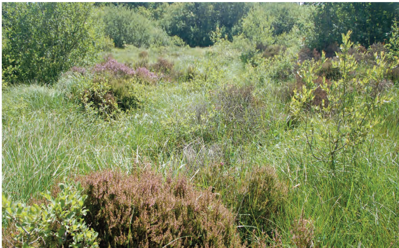
DSC 2432: P2 - Cutover bog area dominated by Molinia caerulea , with scattered stands of Ling Heather at the western end of the site.