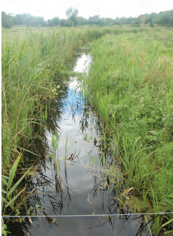
DSC 2457: P1 - Drainage ditch and main outflow leading from Clonoony Lough, and running through an area of wet grassland at the south western end of the lake. View to north-east.