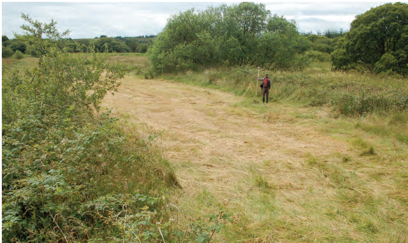
DSC 2190: P1 - Area of wet grassland used for silage production along the north eastern edge of the wetland area at Black Lough.