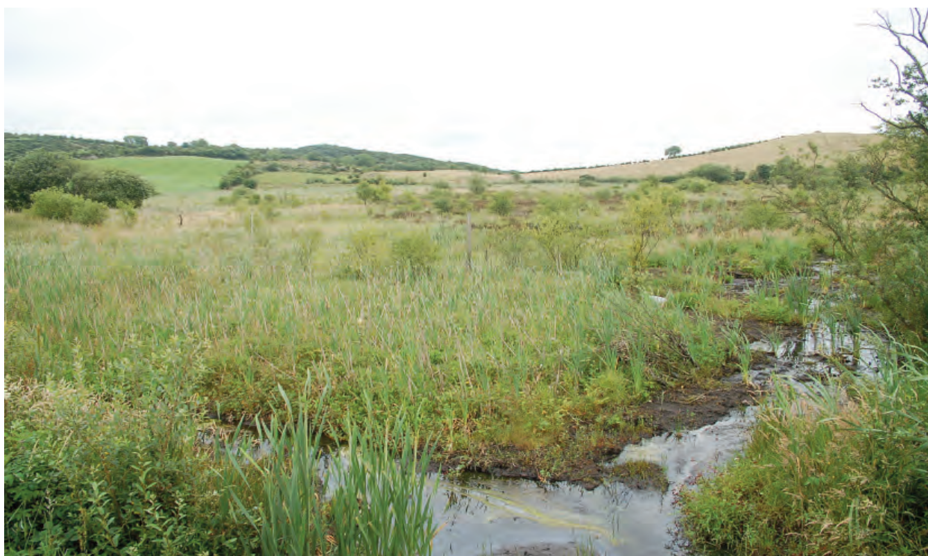
DSC 2156: P2 - View to south over Cargaghmore fen and cutover bog, with recently drained and ditched area of wetland adjacent to the road running through the site.