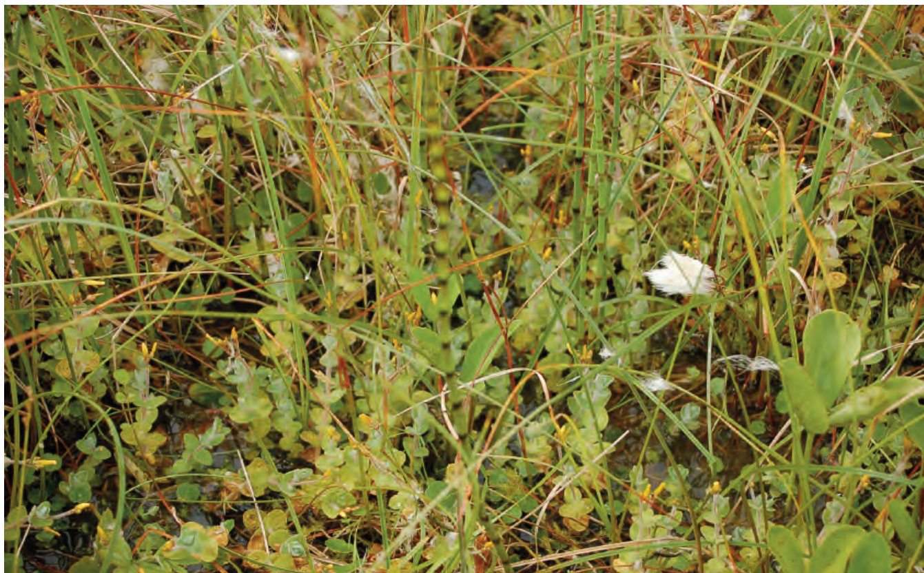
DSC 2144: P5 - Details of the Carex diandra dominated transition mire area on the western section of Corlea showing rich herb layer containing Hypericum elodes .