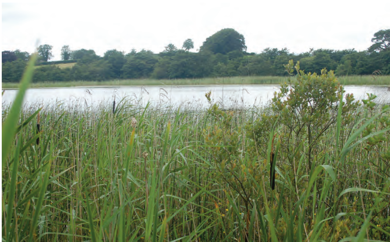
DSC 2355: P3 - The reed beds around the north western of the two lakes at Bishops Lough, dominated by Phragmites australis . View is to the north east.