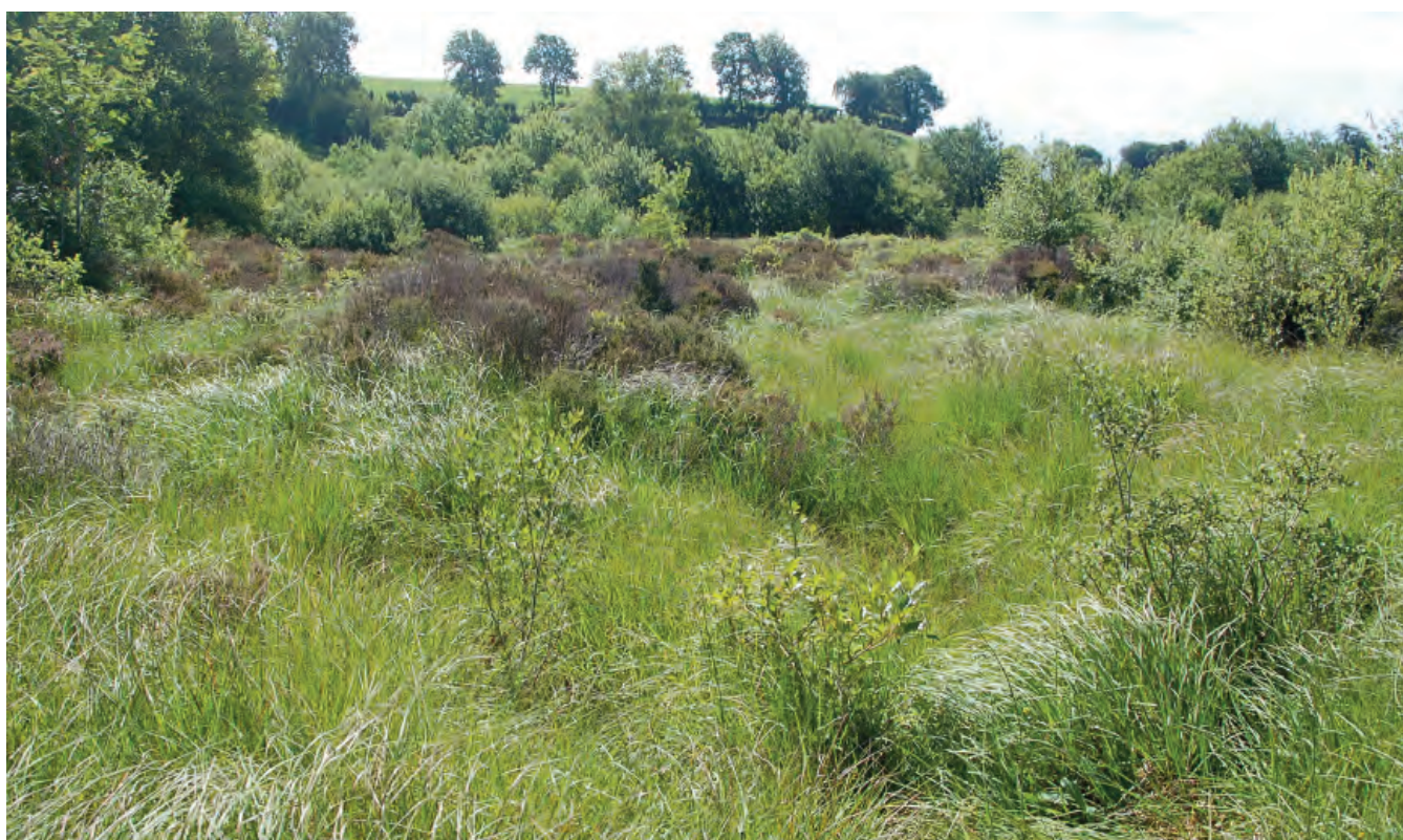
DSC 2431: P2 - Cutover bog area dominated by Molinia caerulea , with scattered stands of Ling Heather at the western end of the site. Willow scrub forms fringe with adjacent farmland.