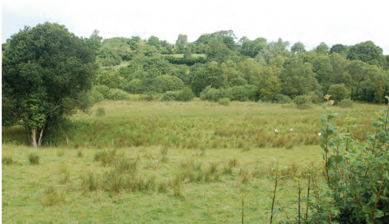
DSC 2390: P2 - View over the north eastern end of the site, with wet grassland in the foreground, marsh and willow scrub community behind. View to the west.