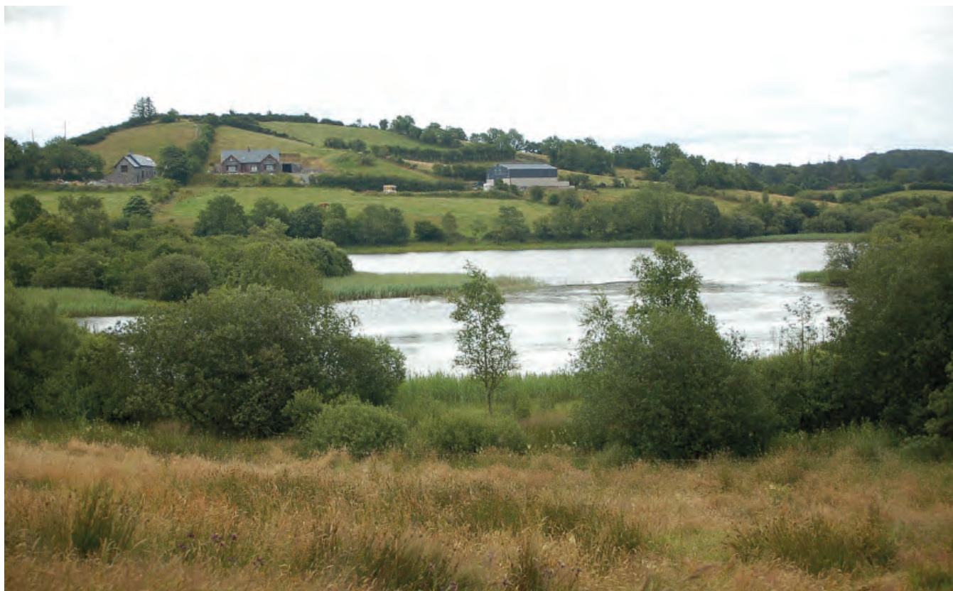
DSC 2200: P3 - View eastwards over the northern half of Black Lough. Marginal reed bed communities surround much of the lake.