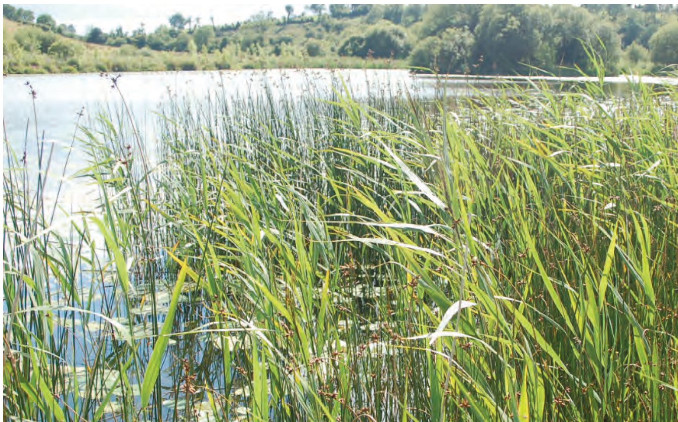
DSC 2495: P1 - Reed bed zone along the southern shore of the lake, with Schoenoplectus lacustris and Phragmites australis . The wooded crannog is visible in the background.