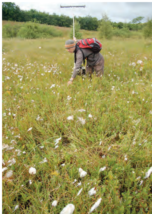
DSC 2145: P5 - Detail of the Carex diandra dominated transition mire area on the western section of Corlea, with increased Bog Cotton cover.