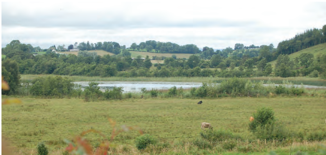
DSC 2369: General view of the north western of the two lakes at Bishops Lough, showing the marginal reed bed communities and scattered alder fringe between reed beds and adjacent improved grassland. View is to the north.