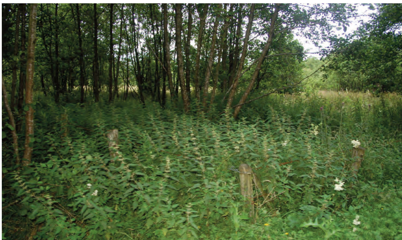
DSC 2372: P2 - South eastern end of site dominated by wet alder woodland with an understorey of Urtica dioica .