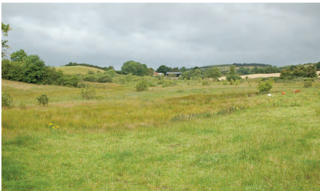
DSC 2130: P2 - Transition mire area with scattered birch trees on the western section of Corlea, semi-improved pasture in the foreground. View to west.