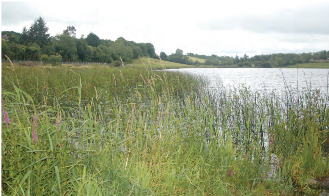
DSC 2262: P1 - Emergent reed bed zone on the eastern corner of Corravoo Lough adjacent to car park area. View to south-west.