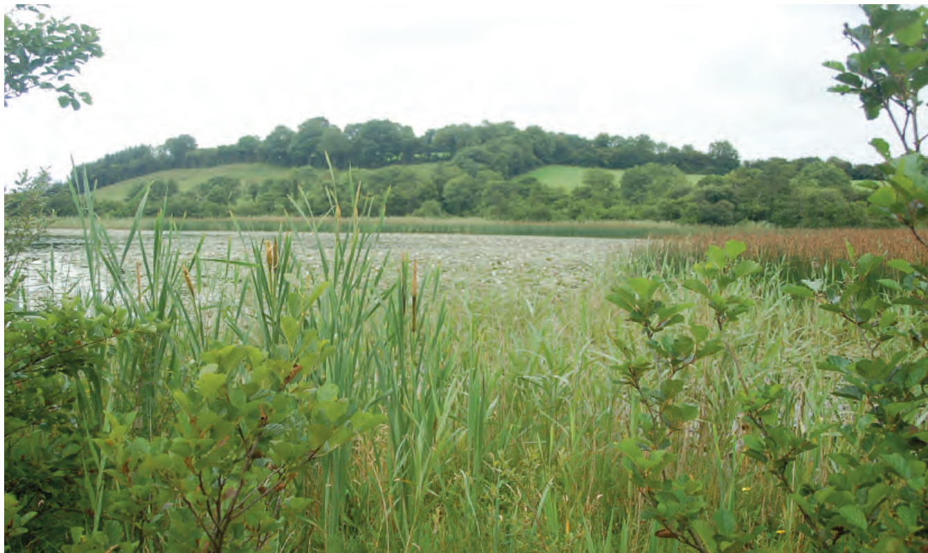
DSC 2349: P1 - The reed beds and swamp vegetation around the eastern of the two lakes at Bishops Lough, and extensive floating macrophyte communities. View is to the north.