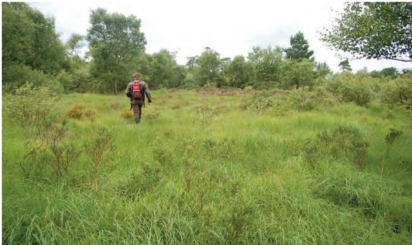
DSC 2470: P1 - Open area of cutover bog dominated by Molinia caerulea at Corvaghan, surrounded by marginal birch scrub area. Myrica gale scattered on cutover bog surface.