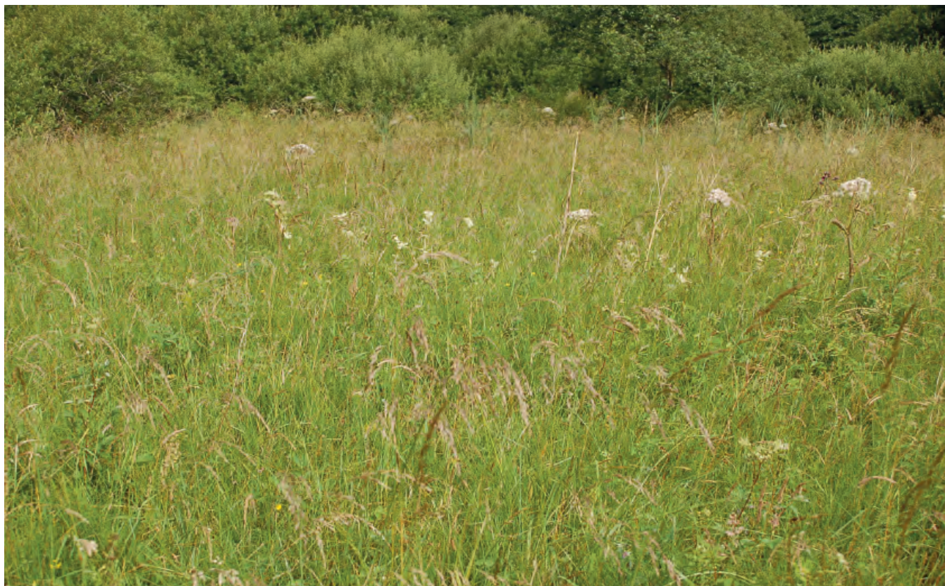
DSC 2396: P2 - View over the marsh area on the eastern edge of the site.