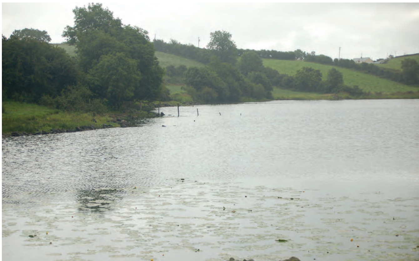
DSC 2293: P3 - North western rocky shoreline of Annagose Lough, showing fence line running into lake.