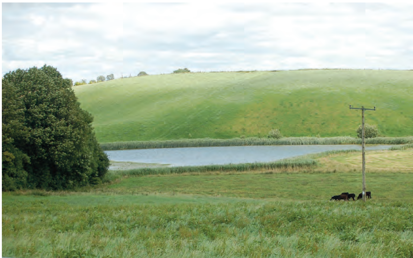
DSC 2070: P4 - The southern Annyalty Lough, looking east, showing a fringe of reed bed surrounding the lake, and the improved pasture on surrounding drumlins.