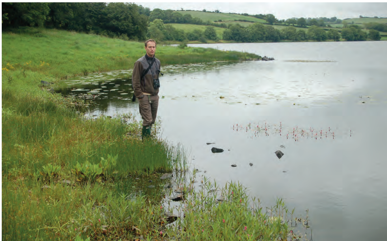
DSC 2285: P3 - North western rocky shoreline of Annagose Lough, showing sparse wetland vegetation fringe around lakeshore.