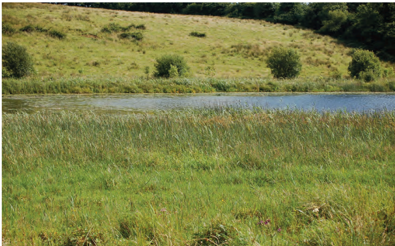
DSC 2502: P1 - Reed bed zone along the southern shore of the lake, with Schoenoplectus lacustris and Phragmites australis . Wet grassland area in the foreground.