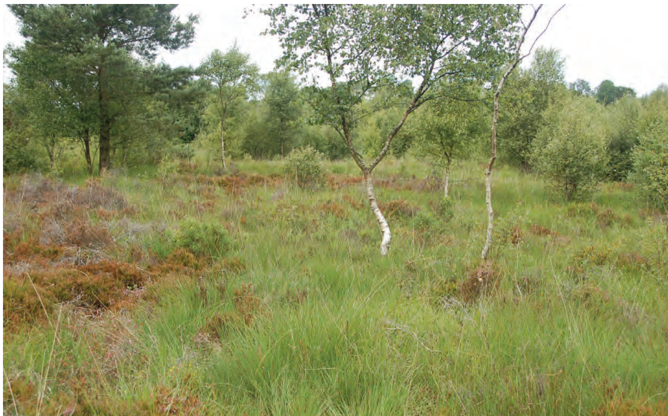
DSC 2473: P3 - Open area of cutover bog dominated by Molinia caerulea at Corvaghan, surrounded by marginal birch scrub area. Calluna vulgaris and Myrica gale scattered on cutover bog surface.