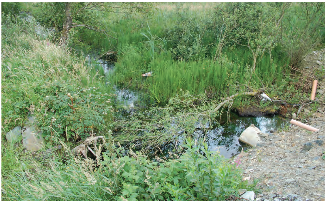
DSC 2159: P2 - View to south over Cargaghmore, with recently drained and ditched area of wetland adjacent to the road running through the site.