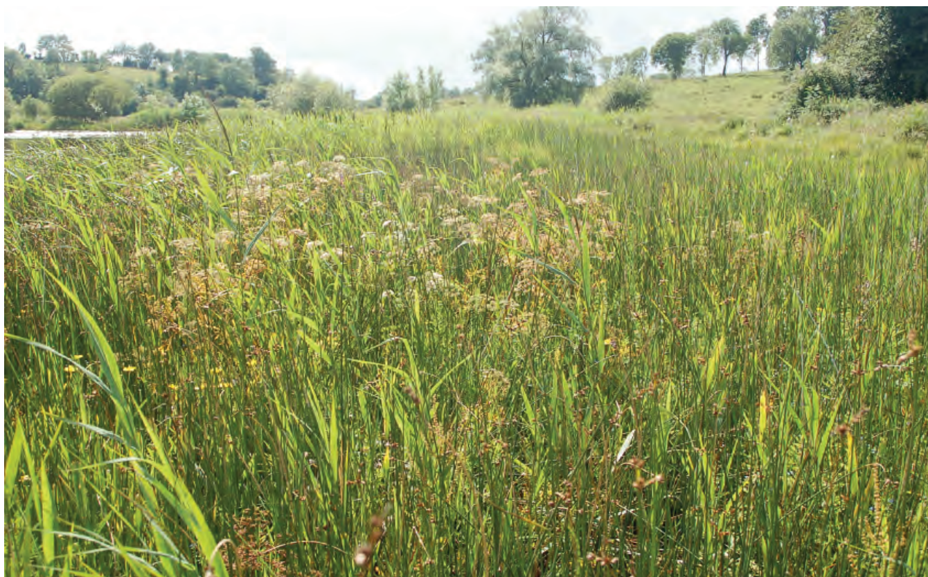
DSC 2497: P1 - Reed bed swamp zone along the southern shore of the lake, with Schoenoplectus lacustris and Phragmites australis .