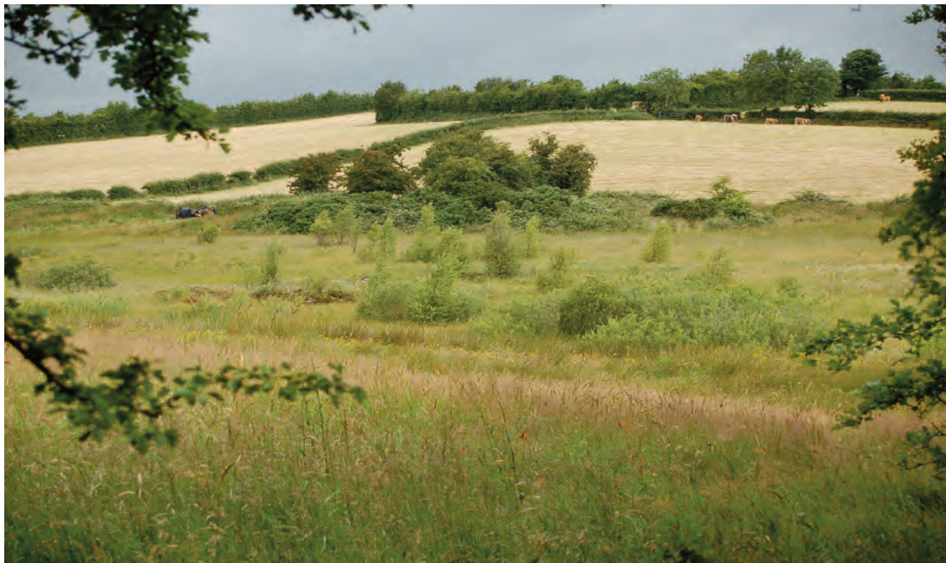
DSC 2127: P1 - Transition mire area with scattered birch trees on the western section of Corlea. View to north.

Photographs by: Peter Foss unless otherwise stated.