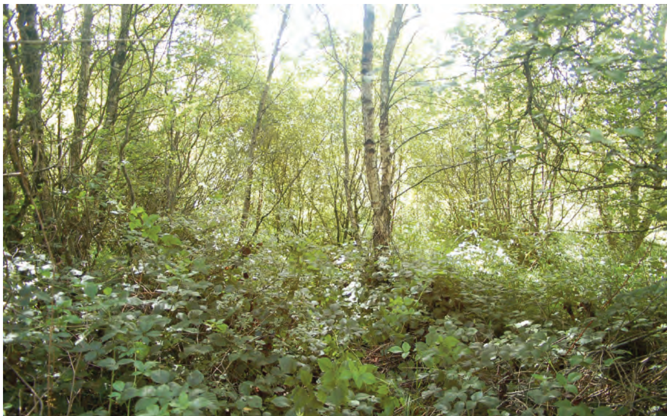
DSC 2443: P3 - Birch and willow woodland area at the eastern end of the site near Aghafin Lough. The understorey is dominated by Brambles.