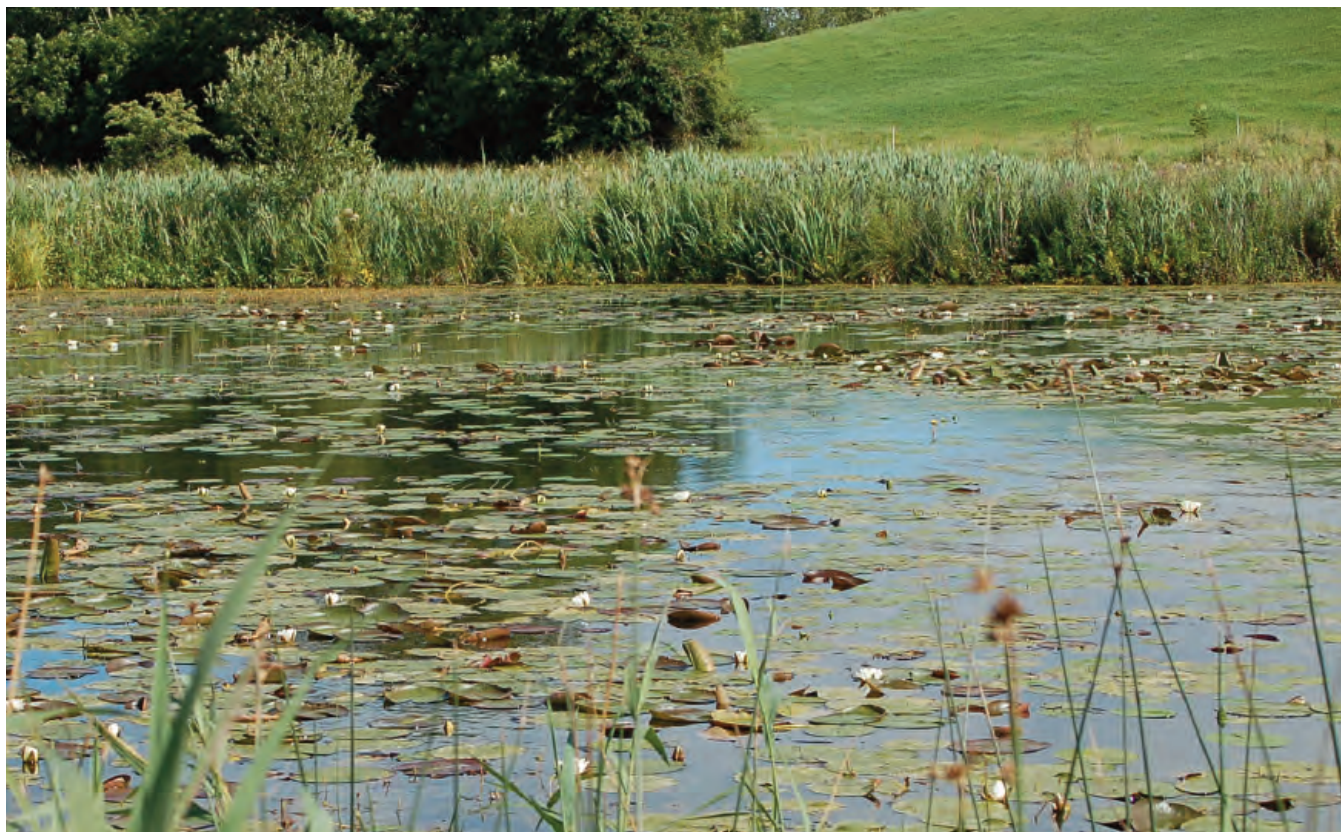
DSC 2494: P1 - Floating macrophyte vegetation on the surface of the lake, with Nymphaea alba dominant. A narrow Typha latifolia reed bed swamp zone occurs on the northern shore of the lake.