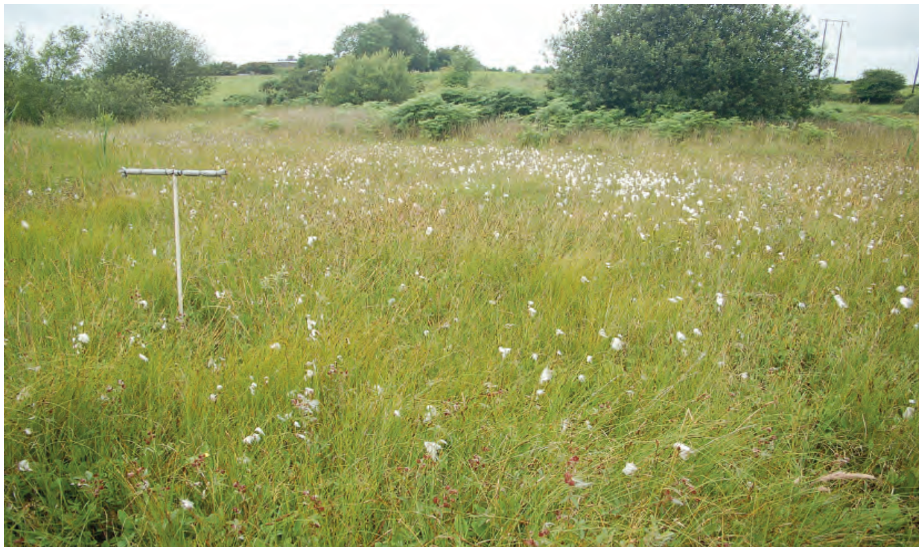
DSC 1956: P1 - Transition mire area on area of cutover bog on the western shore of Drumganny Lough, with Carex diandra and Eriophorum angustifolium . View to north-west.