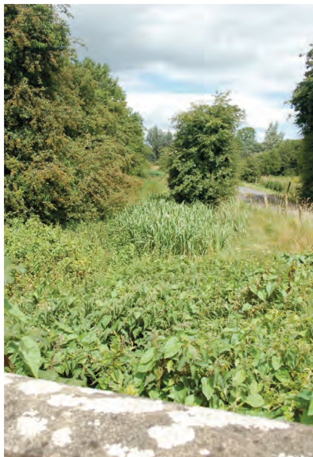
DSC 2466: P2 - A section of the abandoned Ulster canal which runs along the southern edge of the site. View to north-east.