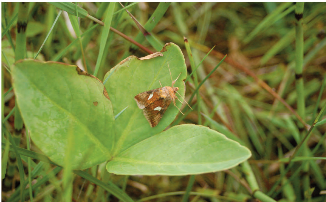
DSC 2385: A Gold Spangle moth ( Autographa bractea ) on Bog Bean leaf, in the transition mire on the southern shore of Clonkeen Lough.