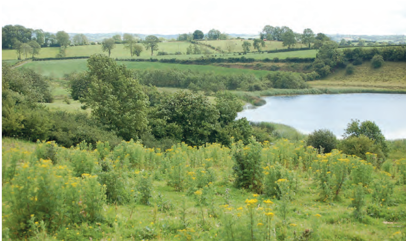
DSC 2073: P1 - View over the eastern section of the lake and site, showing emergent reed bed fringe along lakeshore and area of wet woodland in the distance. View to south-east.