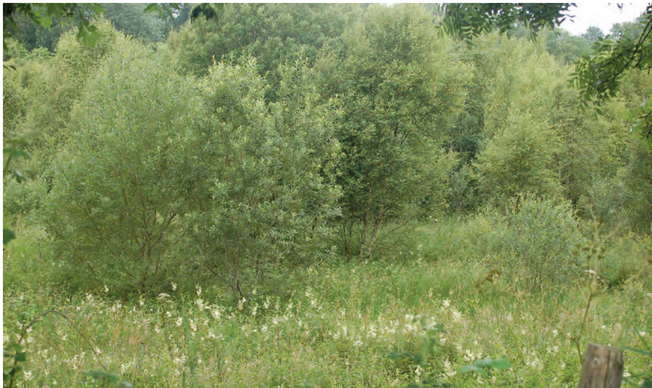
DSC 2370: P1 - South western corner of site adjacent to a wet rushy field, where willow and alder scrub is invading the open cutover bog area.