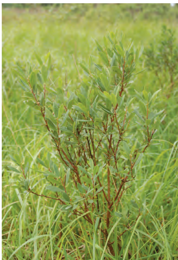
DSC 2471: P1 - Open area of cutover bog dominated by Molinia caerulea at Corvaghan, with Bog Myrtle ( Myrica gale ).