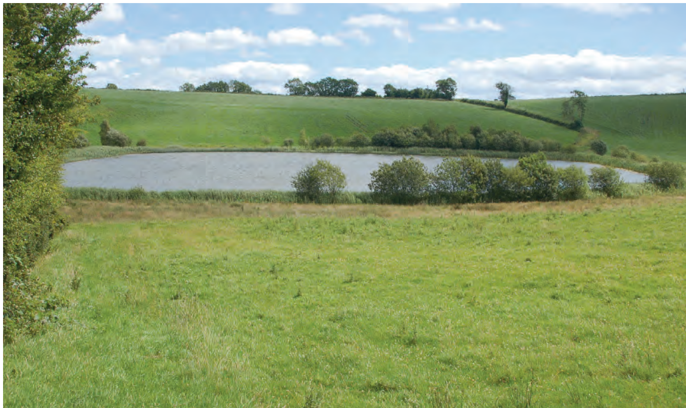
DSC 2064: P1 - The northern Annyalty Lough, looking east, showing a fringe of reed bed surrounding the lake, with scattered willow stands.

Photographs by: Peter Foss unless otherwise stated.