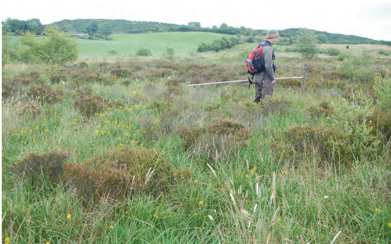
DSC 2162: P3 - Area of regenerating cutover raised bog in the north east of the site. Ling heather, Purple Moor grass and Bog Asphodel are conspicuous elements in the vegetation.