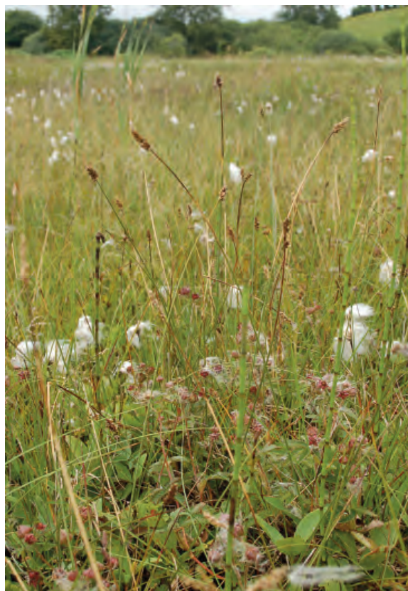
DSC 1969: P1 - Detail view of transition mire area on area of cutover bog.