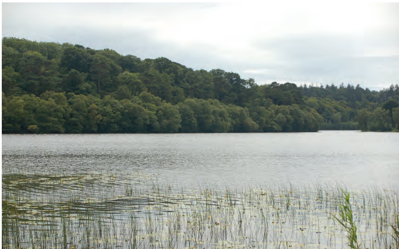
DSC 2187: P4 - View towards the south over Lough Bawn, showing mature mixed woodland extending down to lakeshore around much of the lake and the absence of significant wetland communities.