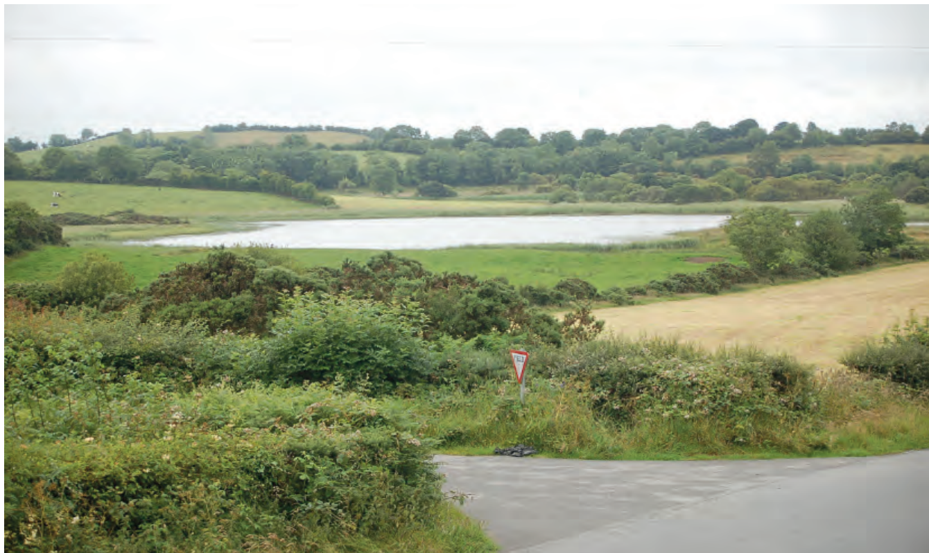
DSC 2221: P1 - View of the northern of the two lakes at Carrickaslane, showing limited extent of marginal wetland communities. View to the south.