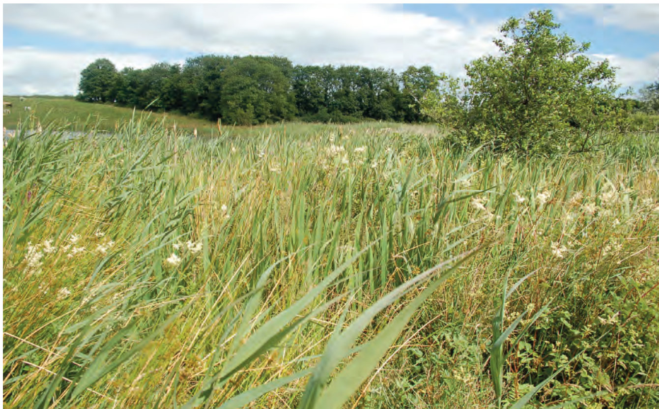
DSC 2462: P3 - Reed swamp area on the south western end of Clonoony Lough which extends southwards to the abandoned Ulster Canal. View to east.