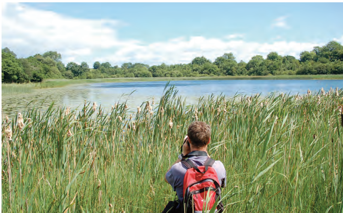
DSC 2426: P4 - View from the western shore of Aghafin Lough showing the fringing Typha latifolia swamp area which surrounds all of the lake.