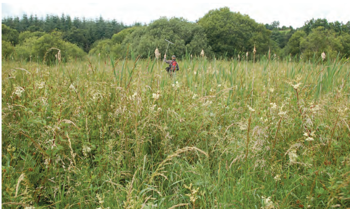
DSC 2191: P1 - Area of transition mire and mixed swamp vegetation with wet woodland areas at the northern end of Black Lough. The area of conifer afforestation can be seen in the distance. View westwards.