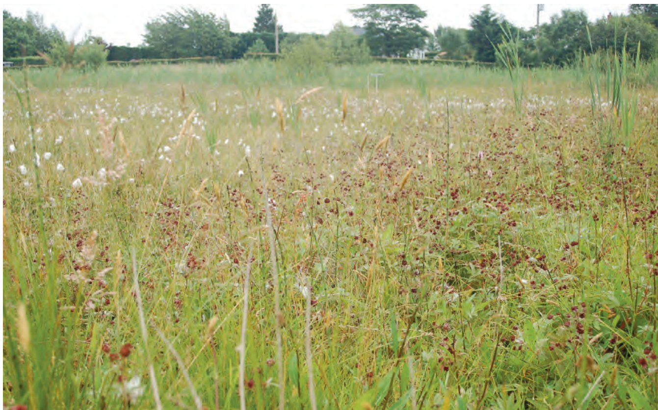
DSC 1971: P1 - Transition mire area on area of cutover bog looking south towards the road where the area grades into Typha swamp. View to south.