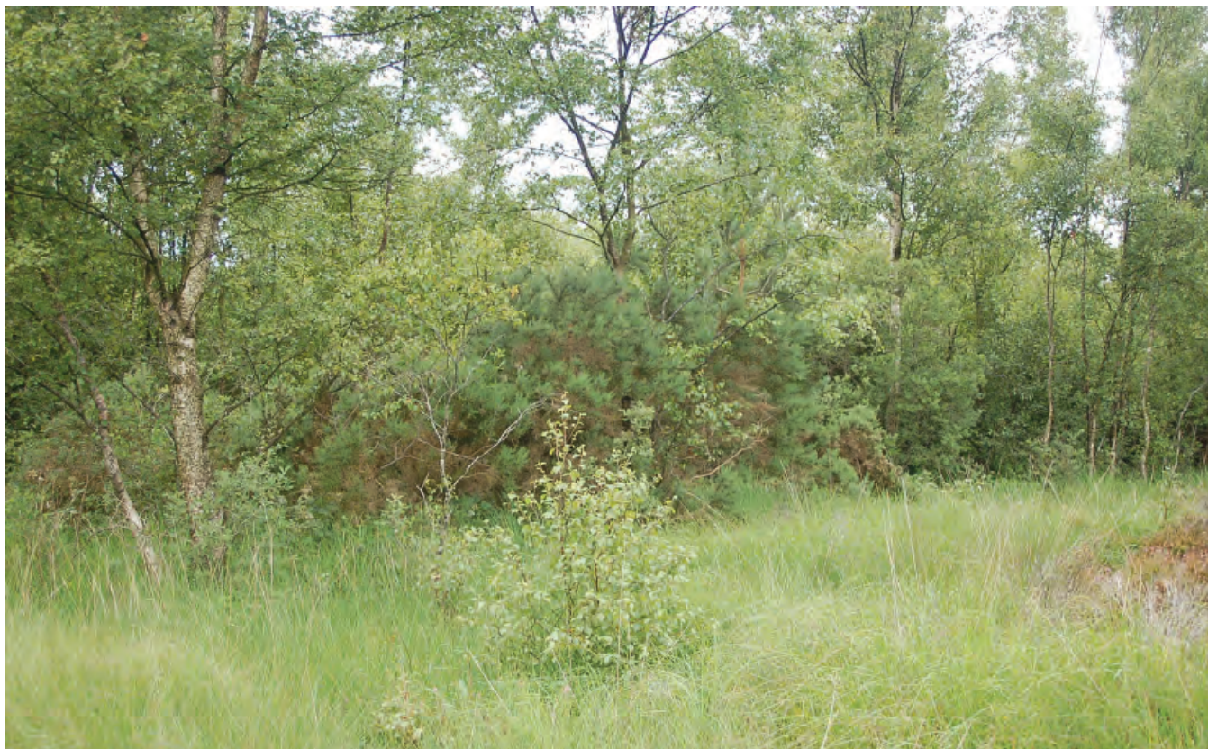
DSC 2472: P2 - Cutover bog area adjacent to old drain running through western section of site with scrub formed by Birch, Willow and Ulex europaeus .