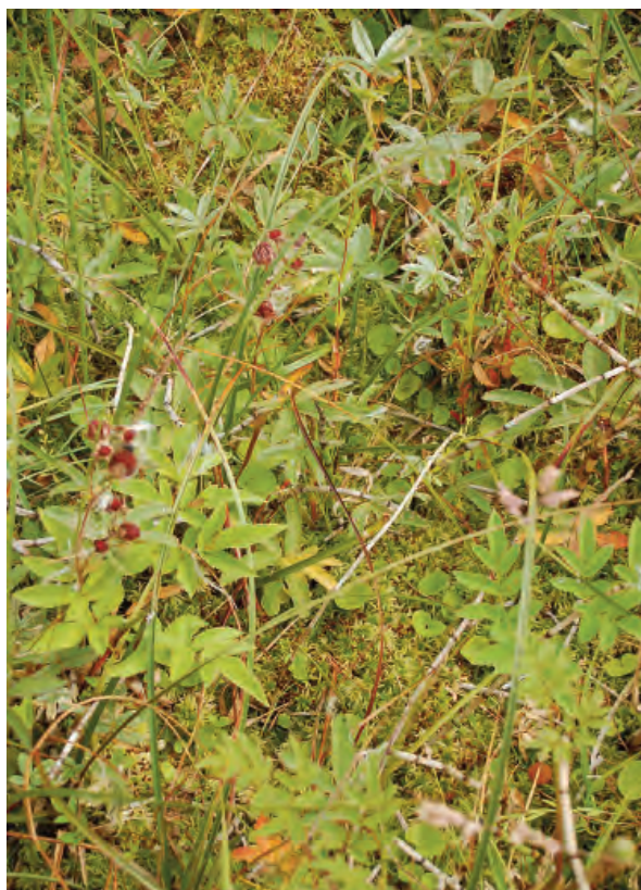
DSC 2142: P5 - Details of the Carex diandra dominated transition mire area on the western section of Corlea showing rich moss and herb layer.