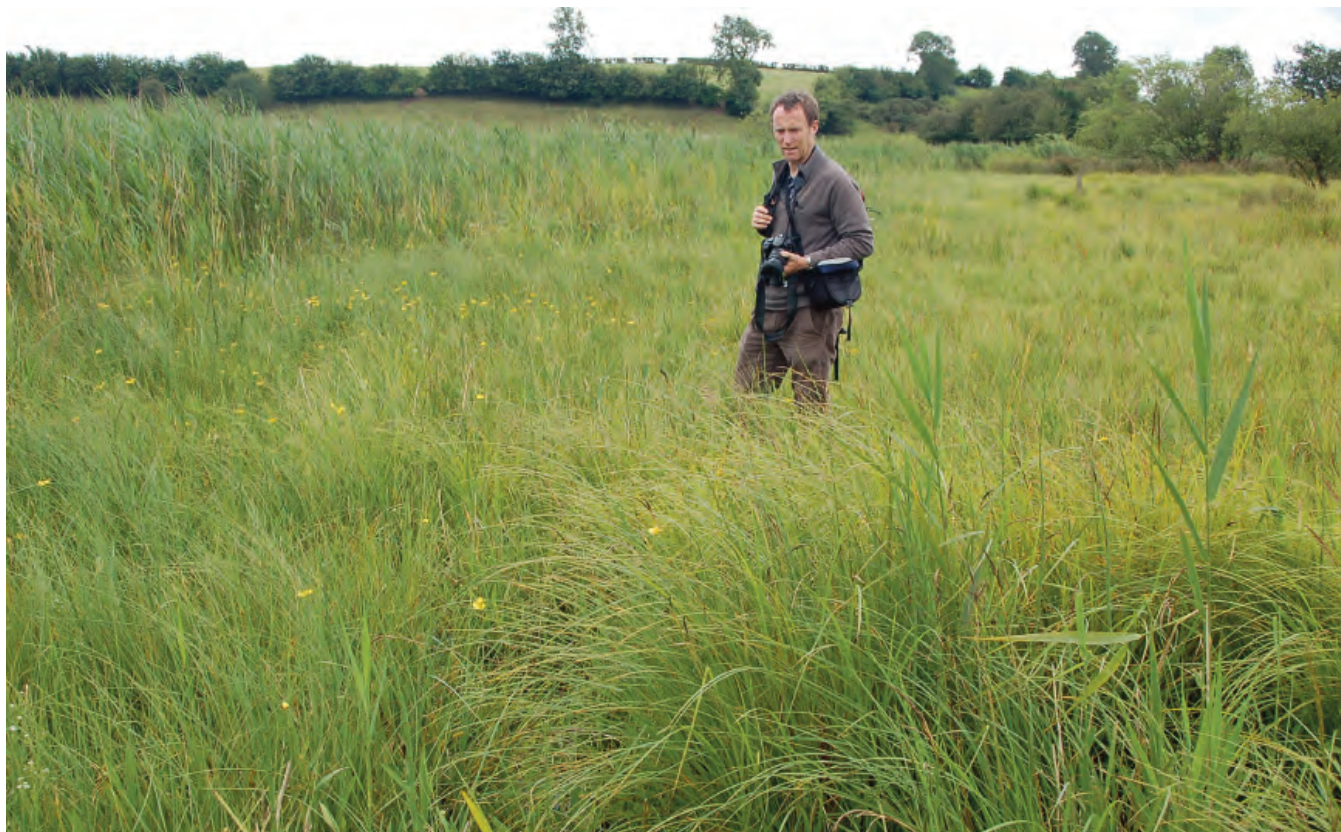
DSC 2076: P2 - Wet marshland area behind the reed bed fringe on the northern lakeshore, with Carex acutiformis and Bidens cernua .