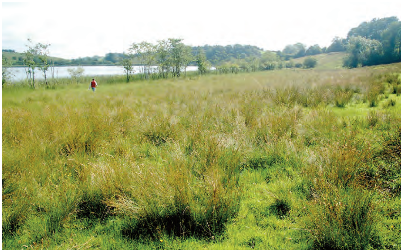
DSC 2598: P2 - View to the east along the southern shore of Clonkeen Lough showing wet grassland area grading into transition mire, alder scrub and reed beds along lake.