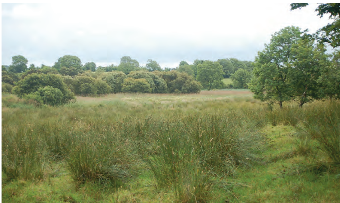
DSC 2225: P2 - View of the southern of the two lakes at Carrickaslane, showing marginal wet woodland area with Phalaris arundinacea in ground layer, and wet grassland communities in the foreground. View to the south east.