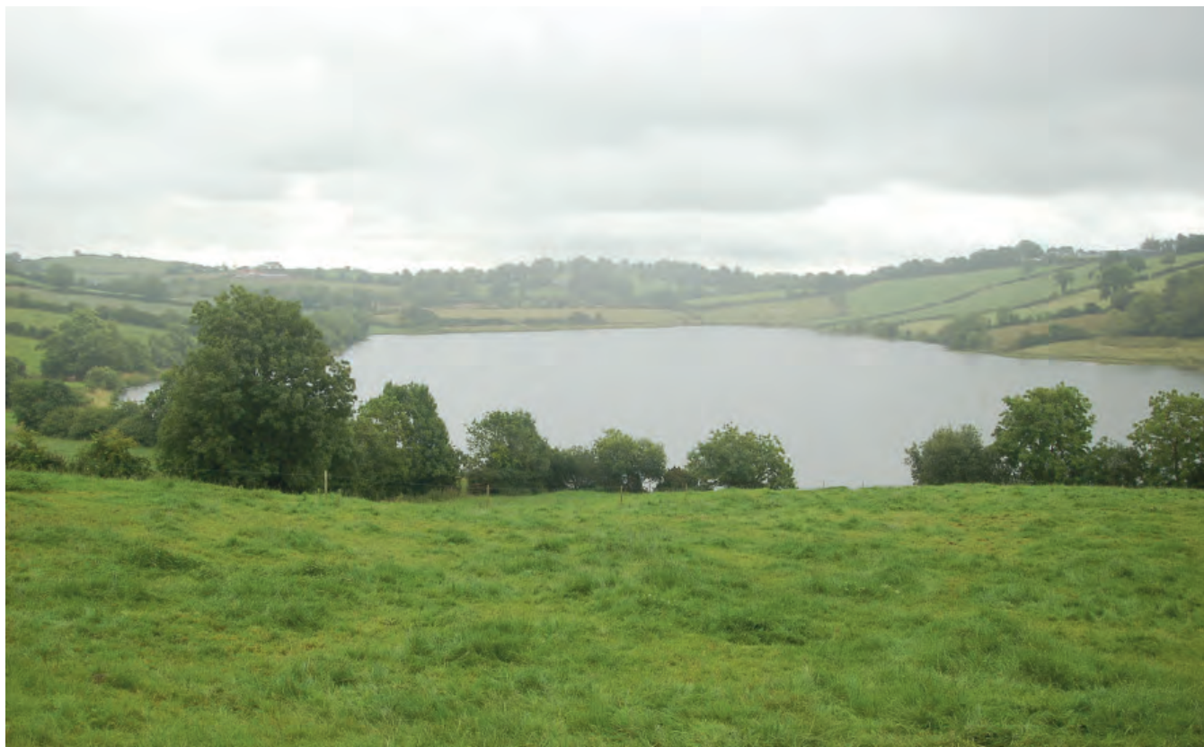
DSC 2283: P2 - View to the east over Annagose Lough, showing the relatively steep drumlins running down to lake and the lack of any major marginal wetland areas.