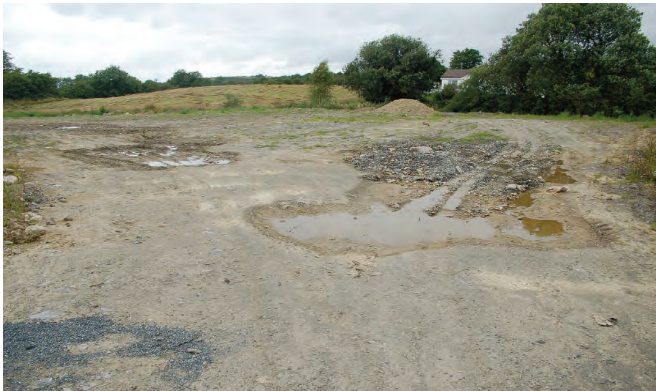
DSC 2155: P1 - Recently infilled area of former wet grassland and marsh to the north of the road running through the site.

Photographs by: Peter Foss unless otherwise stated.