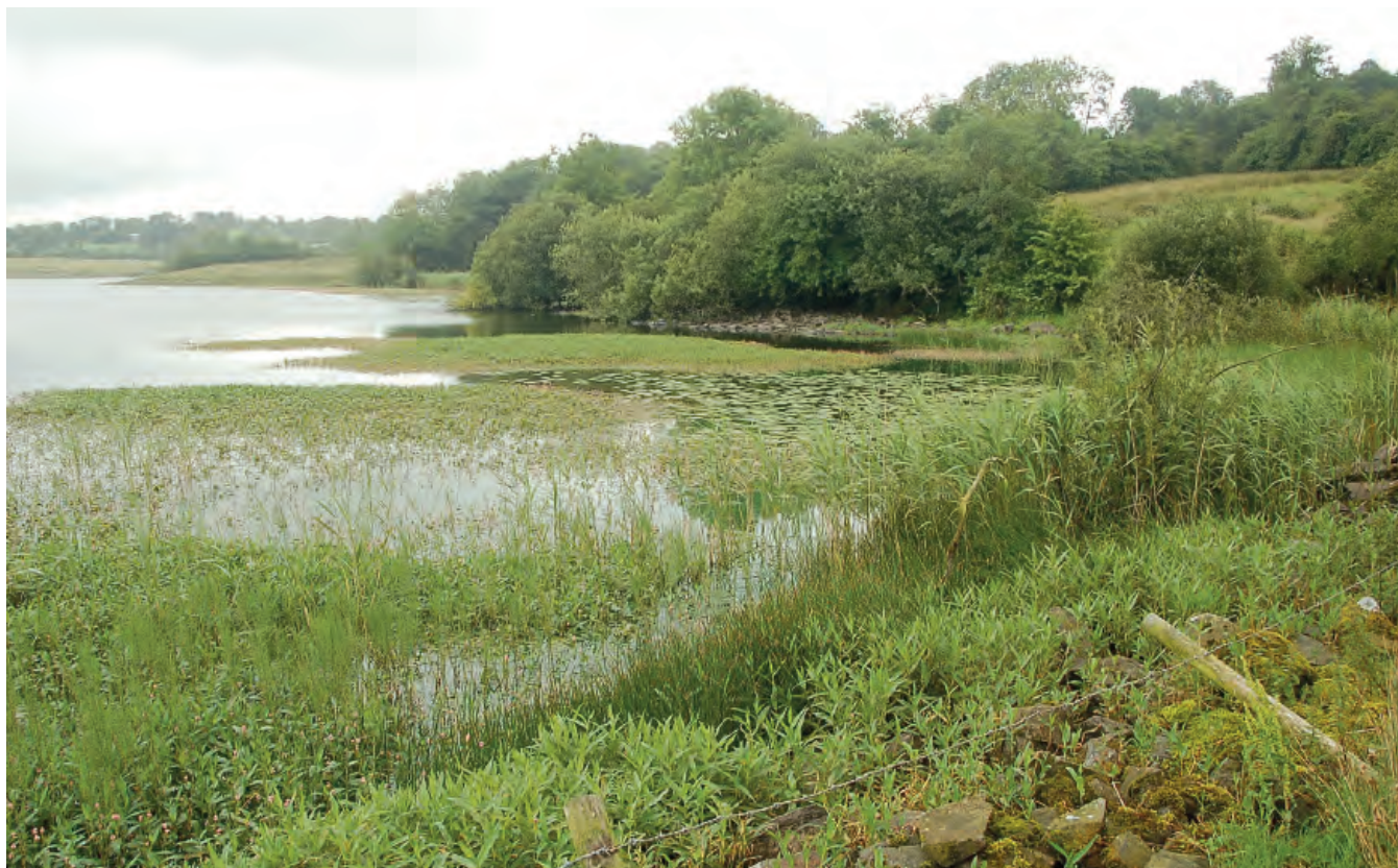
DSC 2292: P4 - South western rocky shoreline of Annagose Lough, with emergent Polygonum amphibium . As farmland extends down to lakeshore around much of the lake, wetland communities are of limited extent.