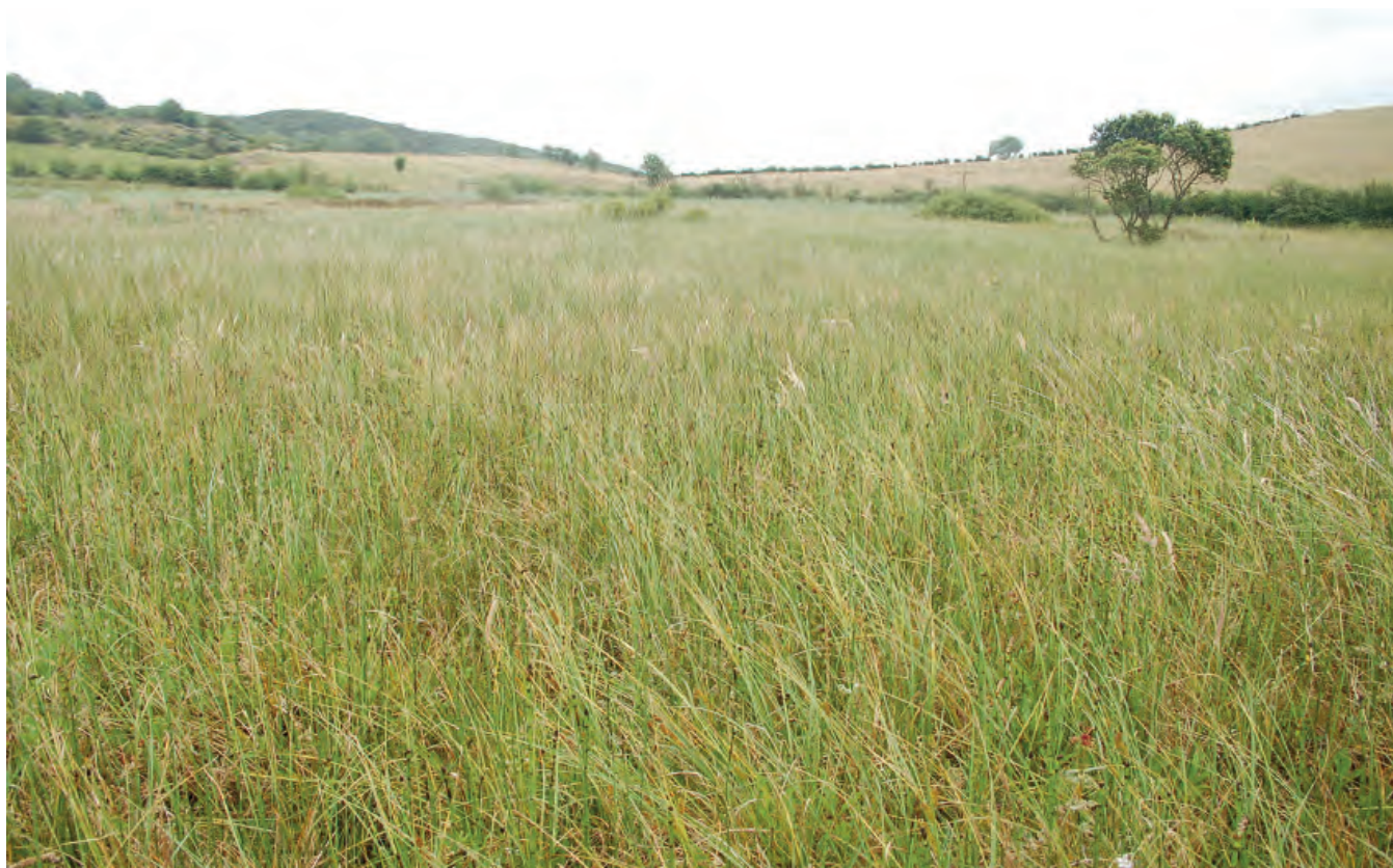
DSC 2170: P4 - Transition mire community on the south-eastern part of the site. View to the south west.