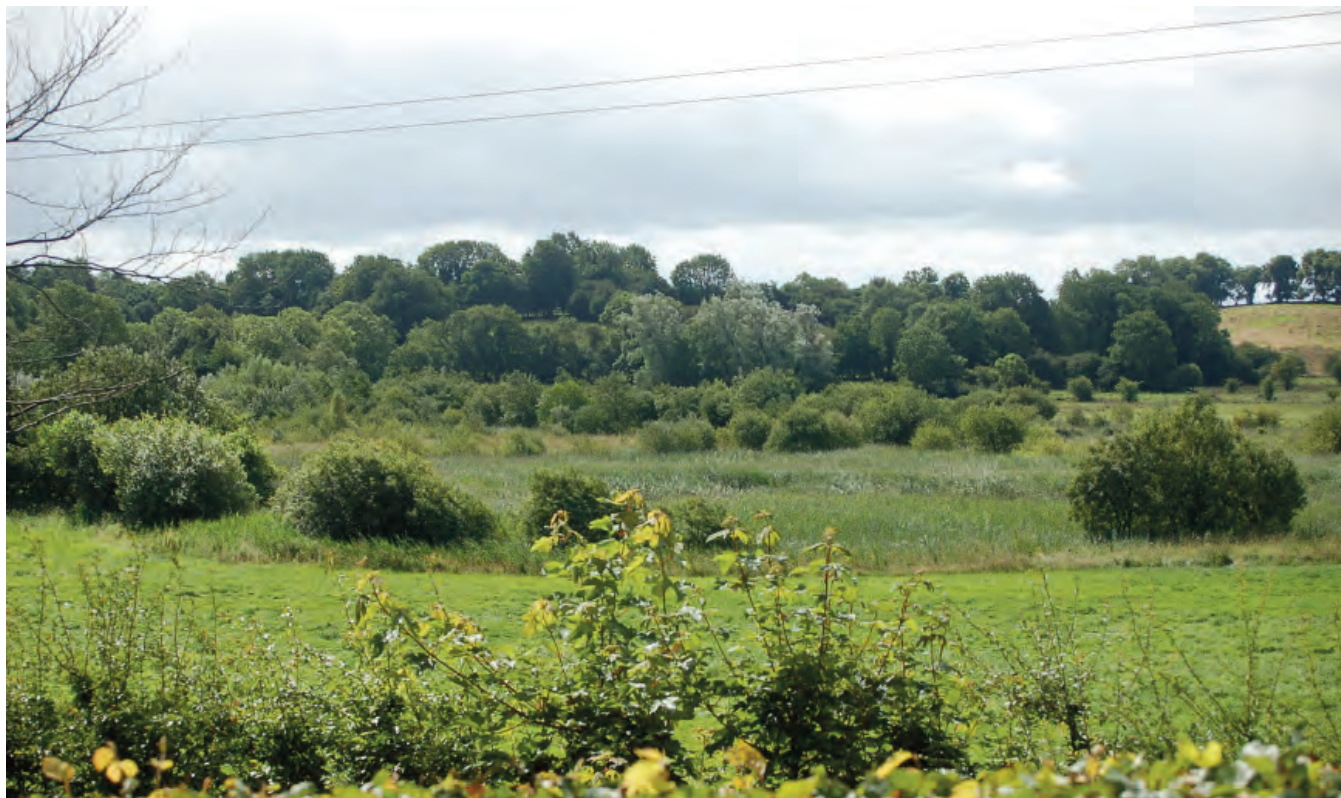
DSC 2418: P1 - View to the south-east over the northern of the two lakes marked on 6 inch OS map. The shoreline is dominated by reed beds which are infilling the lake.