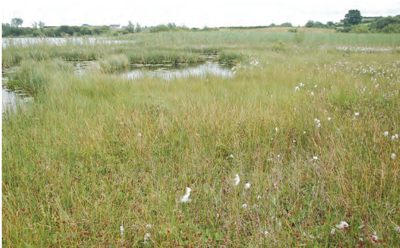
DSC 1972: P3 - Transition mire area on area of cutover bog with larger bog pool areas on the western shore of Drumganny Lough. The main lake can be seen in the top LHS. View to east.