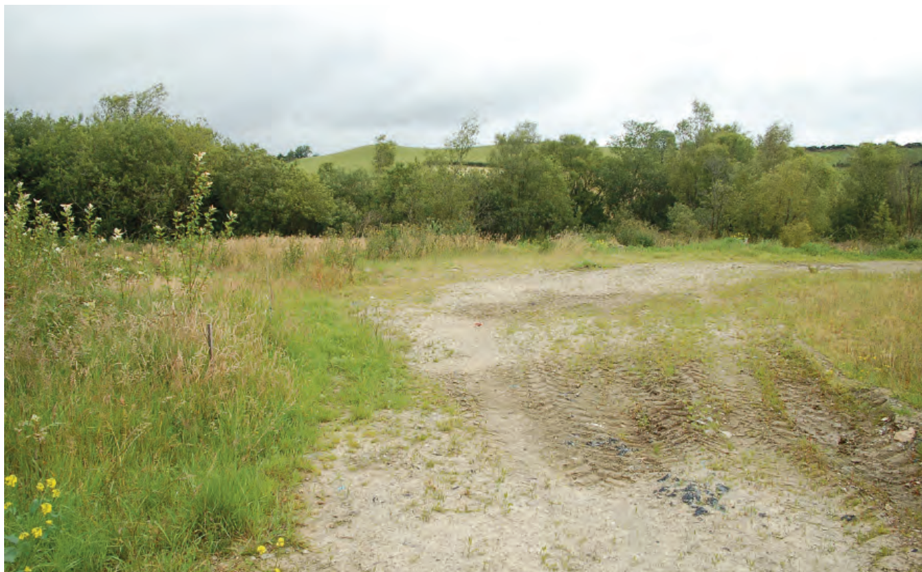
DSC 2133: P3 - Recently infilled wetland area on the eastern section of Corlea, with wet scrub in the background. View to east.