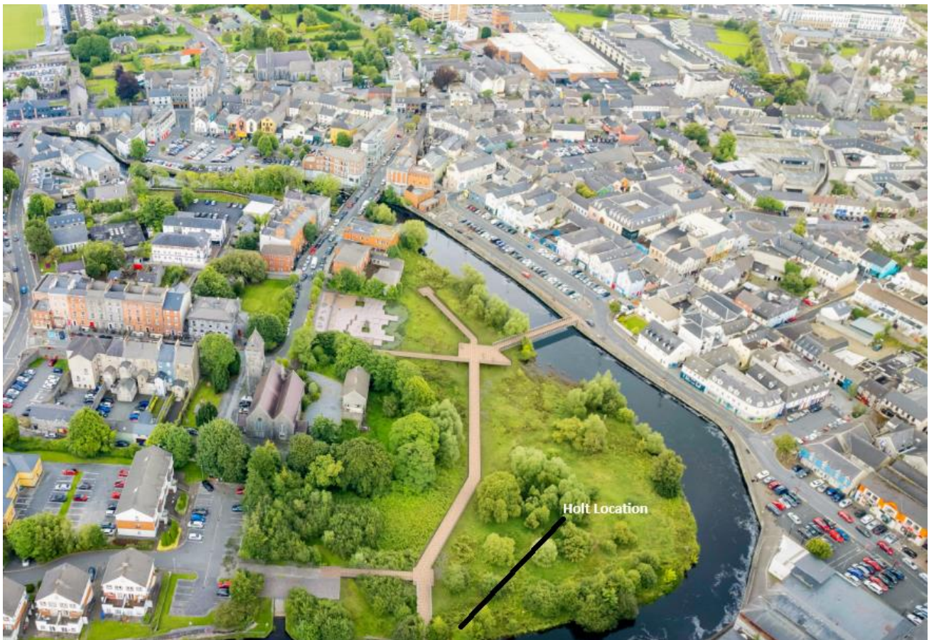
Figure 2: Original design brought to public consultation

As outlined below, the original project design presented during the public consultation phase was significantly more expansive and would have had a detrimental impact on the otter holt if implemented. The alternative designs proposed reflect extensive adjustments to mitigate these impacts, particularly concerning the bridge crossing the Fergus, the overall scale of the project and access routes to the site 5 .