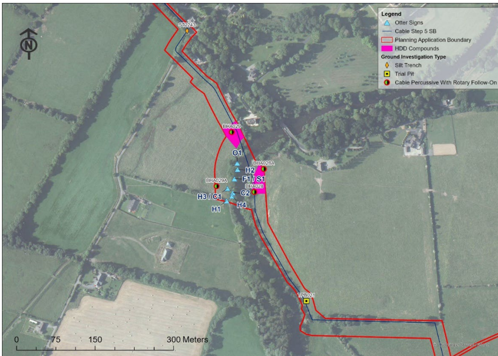
Figure 1. Otter (potential and confirmed) resting places and field signs and proposed works area (planning application boundary in red, cable route in blue and HDD compound locations in pink and proposed ground investigations (GI) locations).

The Meath to Kildare Grid Upgrade (the Proposed Development) consists of a 52km underground cable (UGC) between Dunnstown 400 kV substation in Kildare and Woodland 400 kV substation in Meath, of which 9km is off-road and 43km is in-road. The location of the Proposed Development which specifically pertains to this licence application is shown in Figure 1, and is southeast of Millicent Bridge, North of Sallins, Co Kildare. Construction of the Proposed Development and pre-construction Ground Investigation (GI) works associated with the Proposed Development have the potential to cause disturbance to otter.