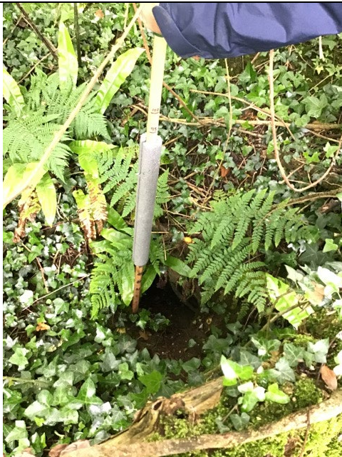
Photograph 7: Potential otter holt (H4) at grid N 87932 24461