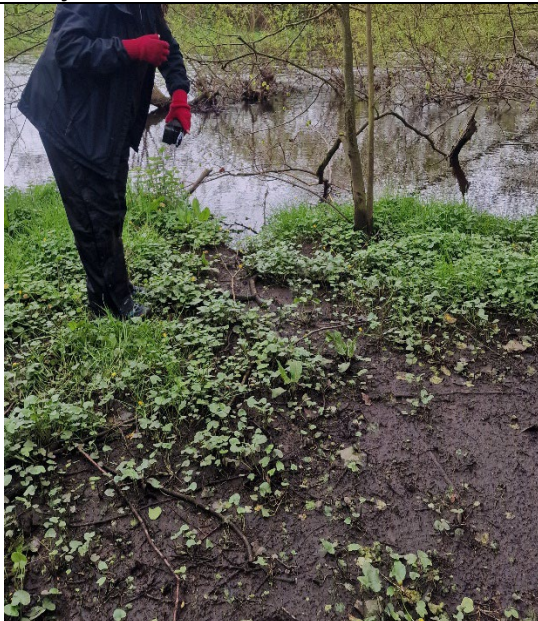
Photograph 3: Detail of the otter slide (S1) recorded at approximately N 87937 24494.