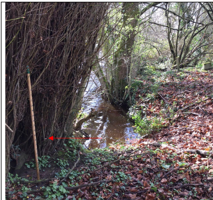
Photograph 9: Potential otter couch (C2) recorded at grid N 87934 24467