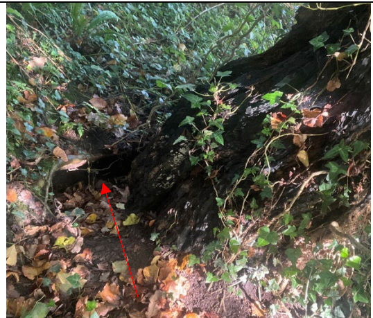
Photograph 4: Location at grid ref. N 87943 24512, where potential holt (H2) entrances were recorded during ecology surveys.