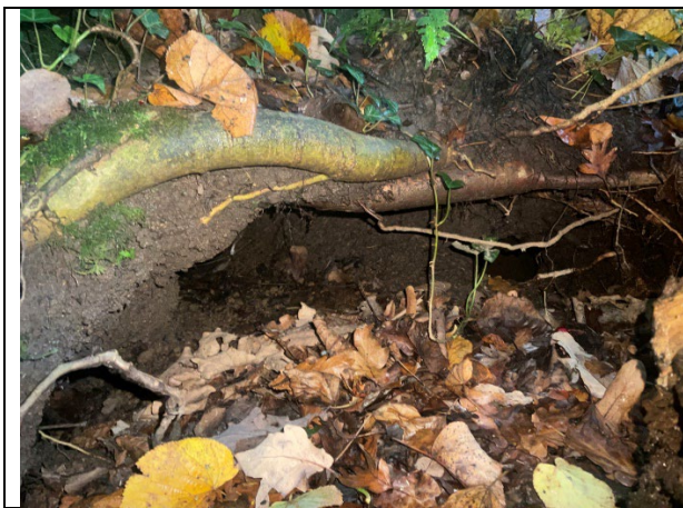
Photograph 5: Detail of the potential otter holt (H2) located at grid ref. N 87943 24512. The entrances where approx. 20cm wide and located below the tree root.