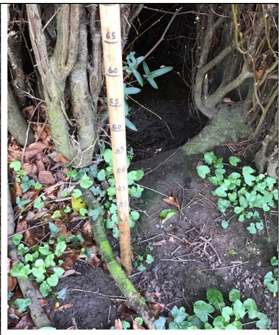
Photograph 10: Detail of the potential otter couch (C2) with fresh spraint (Sp) at the time of the visit (March 2024) at grid N 87934 24467