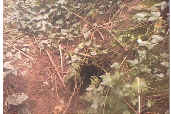
Photograph 2: Detail of potential holt (H1) entrance (N 87922 24452) taken in March 2024.