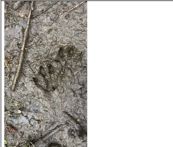
Photograph 11: Otter footprints (F1) found in the mud (March 2024) at grid ref N 87937 24494