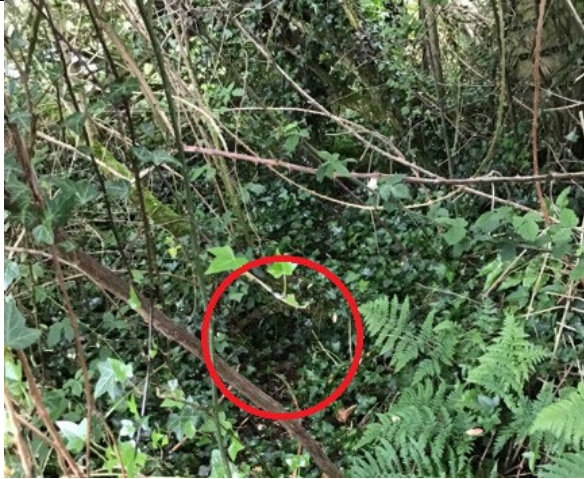
Photograph 1: Location at grid N 87922 24452, where potential holt (H1) entrance was recorded during the ecology baseline surveys.