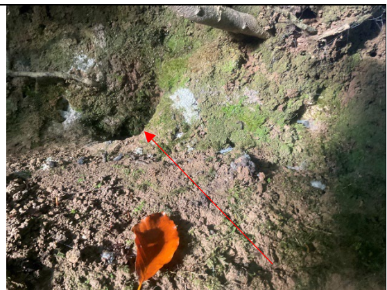
Photograph 6: Potential otter holt (H3) located at grid N 87923 24476, in proximity to potential otter couch