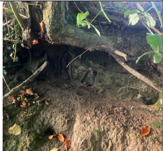
Photograph 8: Potential otter couch (C1) recorded at grid N 87923 24476