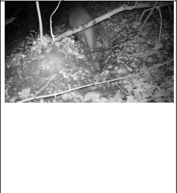
Photograph 12: Camera(s) set at grid N 87932 24461 capture the footage of an otter at H4