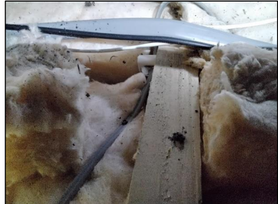
Plate 4 Three storey House: Bat dropping found at the attic entrance.