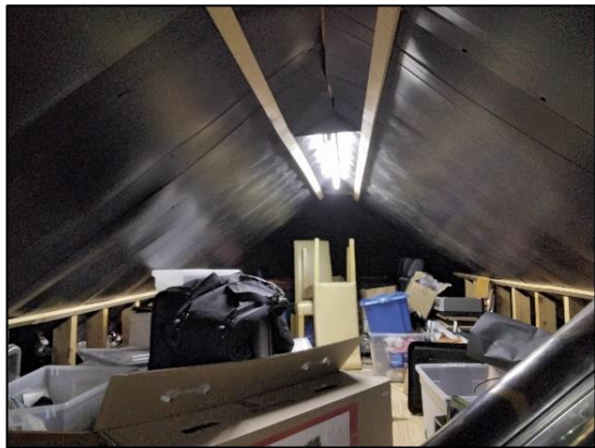
Plate 1 Three storey House: Attic storage area with plastic sealed ceiling and felt.