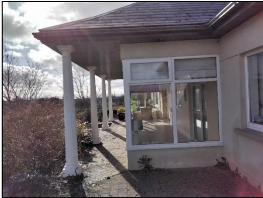
Plate 5 Three storey House: Front porch with air vent allowing light into the roof space.