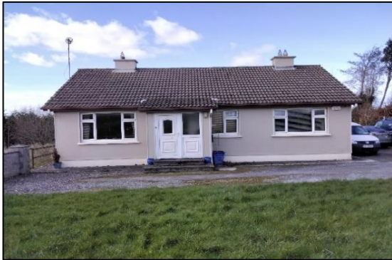
Plate 7 Bungalow for demolition with single attic space and two chimneys.