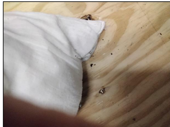
Plate 2 Three storey House: Small number of bat droppings found throughout the attic space.