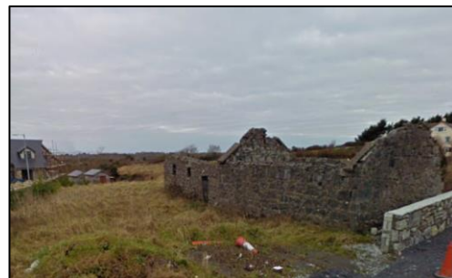
Plate 10 Stone House ruins in 2009, with no linear features present (source Google maps)