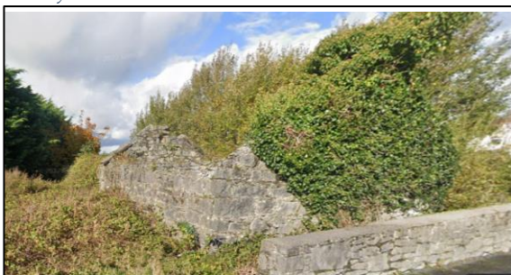
Plate 9 Stone House ruins in 2024 and conifer treeline to the west.