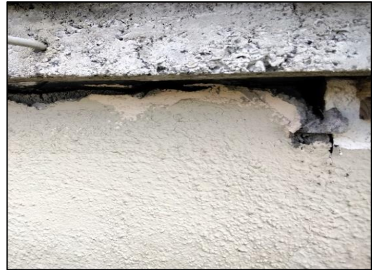
Plate 6 Three storey House: Small hole and crevice to the rear external wall.