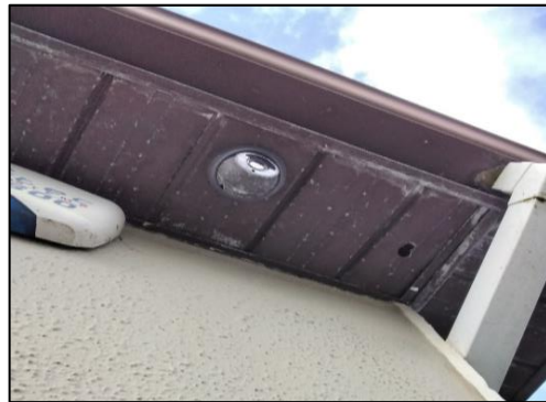
Plate 8 Southern aspect soffit with one hole.