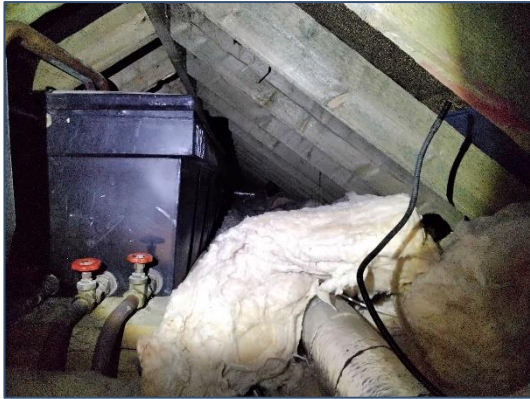
Plate 3 Three storey House: Attic space Section B and water tank – not accessed.