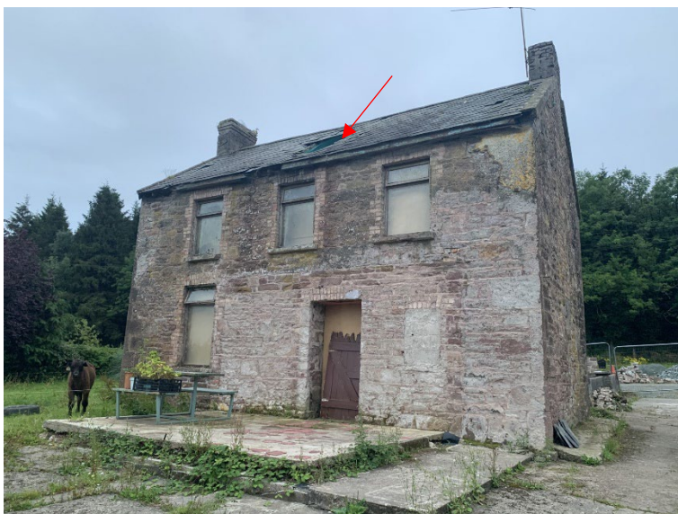
Plate 3-2: Suitable entry/exit point via missing roof tiles

There are potential entry points for bats via slipped and missing roof tiles, gaps between the soffits and the roof and gaps between stonework on the western gable (Plate 3-2 to Plate 3-4).