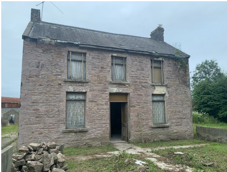
Plate 3-1: Derelict dwelling at Monine, Ardpatrik, Co. Limerick.