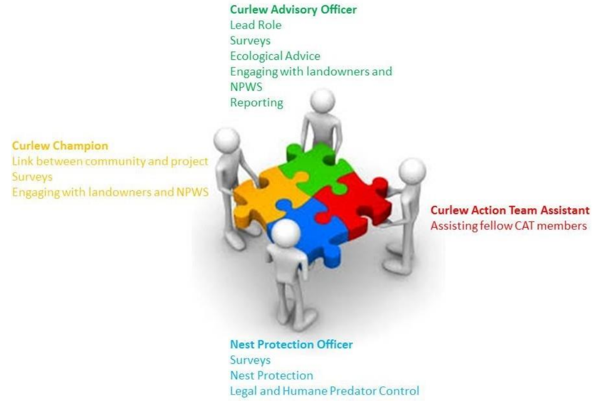
Figure 3. Curlew Action Team – sum of the parts

The introduction of Curlew Action Teams in some of the most important areas has allowed for dedicated surveys and concrete conservation action there. The Curlew Conservation Programme (CCP) has now built a tangible profile for conservation efforts with the local communities and nationally. These teams were given dedicated geographical areas and the support and autonomy to provide local solutions that were appropriate to the sites in question.