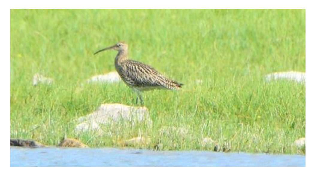
Fig. 16. A juvenile Curlew on the shore of an island on Lough Ree

O'Donoghue, B.G., Donaghy, A. and Kelly, S.B.A. (2019). National survey of breeding Eurasian Curlew Numenius arquata in the Republic of Ireland, 2015–2017. Wader Study 126: 43-48.