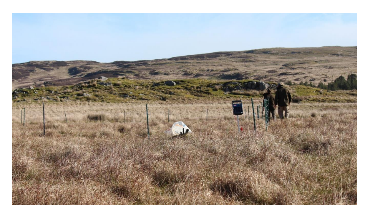
Figure 7. Members of the Donegal Curlew Action Team erecting a nest protection fence

The Curlew Action Teams did particularly well to locate nests as soon as possible. Nest protection fences were deployed by CAT members at ten sites in 2021. Six of these successfully reached hatching stage. Two of those fenced nests were predated by avian predators, another one was abandoned (despite the birds initially returning to incubate after fence erection), and another one had eggs which were found to be non-viable at the time of fence erection. The usefulness of nest protection fences and the impact that ground predators are having on the species is evident in the hatching rate for those sites where nest protection fences were erected.