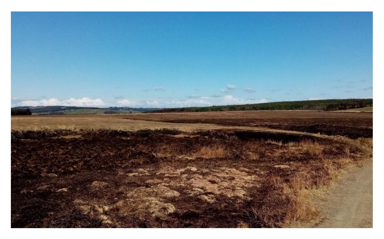
Figure 9. A bog burnt at a traditional Curlew nesting site in Co. Kerry.

Unfortunately, the issue of illegal and unmanaged fires, which have plagued several sites annually, is still very much pressing. Despite universal outrage, such fires remain a serious threat to wildlife, people and property. Illegal burning of land is particularly rife in the Stack's Mountains of Co. Kerry and there is hardly a bog there that has not now been burnt during the months of March, April and May in recent years. It will take concerted efforts, and a lot of goodwill, from various stakeholders (regional NPWS, landowners, turbary rights owners, farmers, fire services, Gardai, local authorities, media, communities, etc.) to stop such environmental crimes.