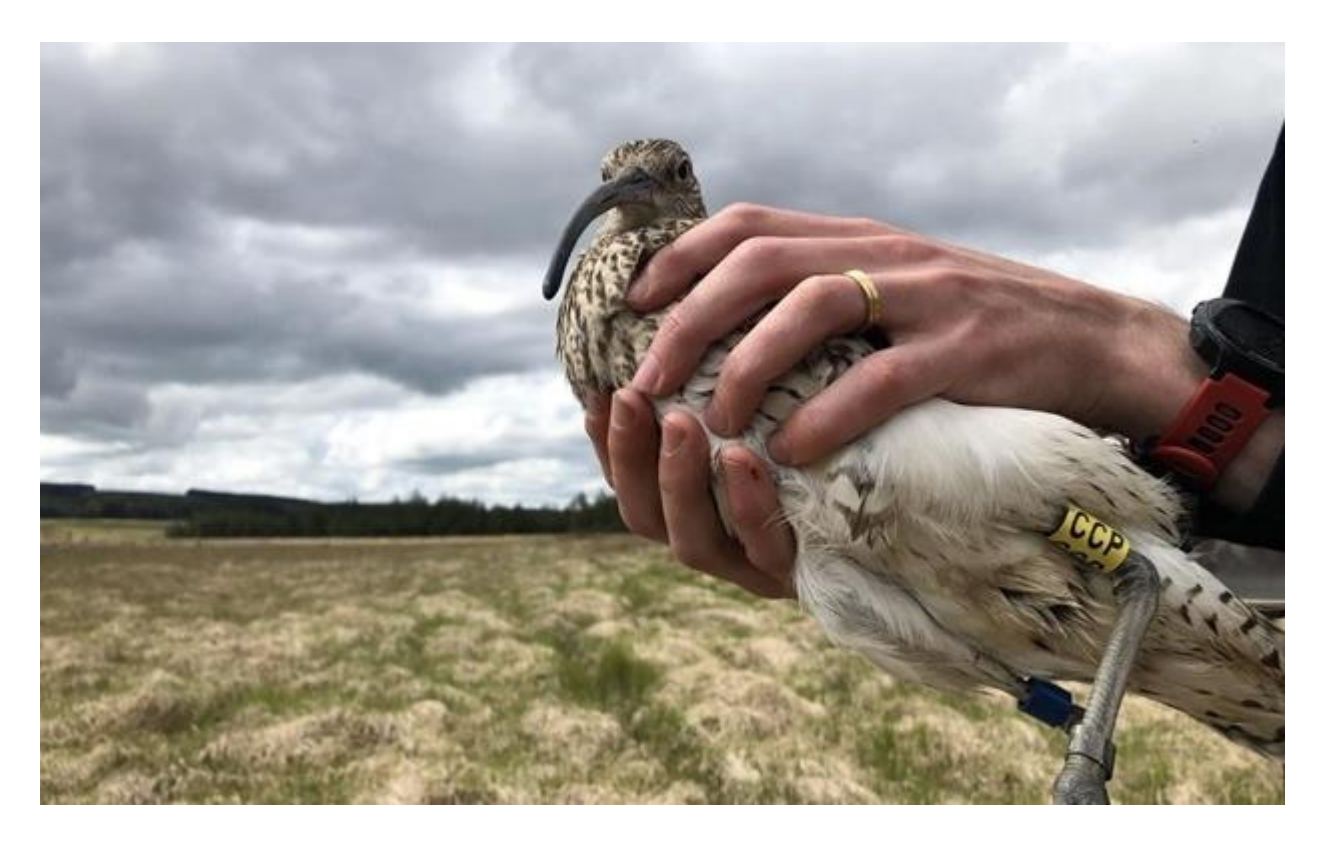
Figure 5. A satellite-tagged (and ringed) male Curlew in the Slieve Aughties