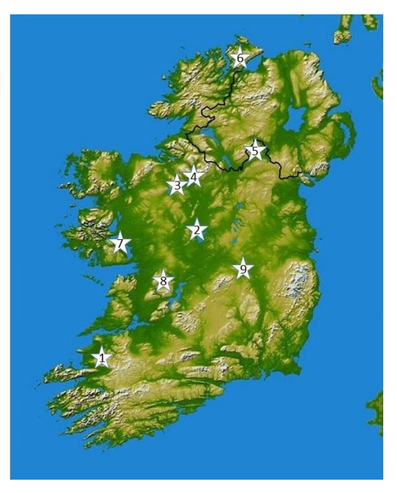
Figure 2. The nine Curlew Conservation Action Areas.

N.B. Given the sensitive nature of the species, the locations of Curlew breeding territories are held by the National Parks & Wildlife Service, and are not disclosed in this report.