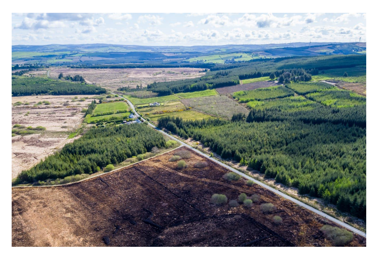
Fig. 16. Aerial photo of a traditional Curlew site in Co. Kerry, which may have seen its last Curlew in 2020. The overview illustrates many of the threats facing Curlew's habitats there, from burning to forestry to land abandonment to agricultural reclamation and wind farms. This is also a Hen Harrier breeding site (and SPA for Hen Harriers). The fragmentation and loss of habitat by various forces is evident across this photo, which typifies the current landscape of much of Curlew's traditional strongholds.

The efforts of the CCP, particularly the local teams, in building and maintaining a positive profile for the Curlew cannot be over-stated. Oftentimes, conflict can arise between the desires of those involved in conservation and the desires of landowners to manage their land as they see best. The understanding and communication skills (which involve listening as well as talking) of those involved in the CCP has been exemplary and the experience to date has been largely positive with countless landowners and local people helping with reporting sightings, facilitating access, providing advice and undertaking efforts to help the Curlew. With widespread concerns over the future of farming in these areas, many farmers are also seeing the value to conserving the Curlew (and other habitats/species), by way of deriving an additional income via agri-environmental schemes, which may be the difference between their farming enterprise continuing or not.