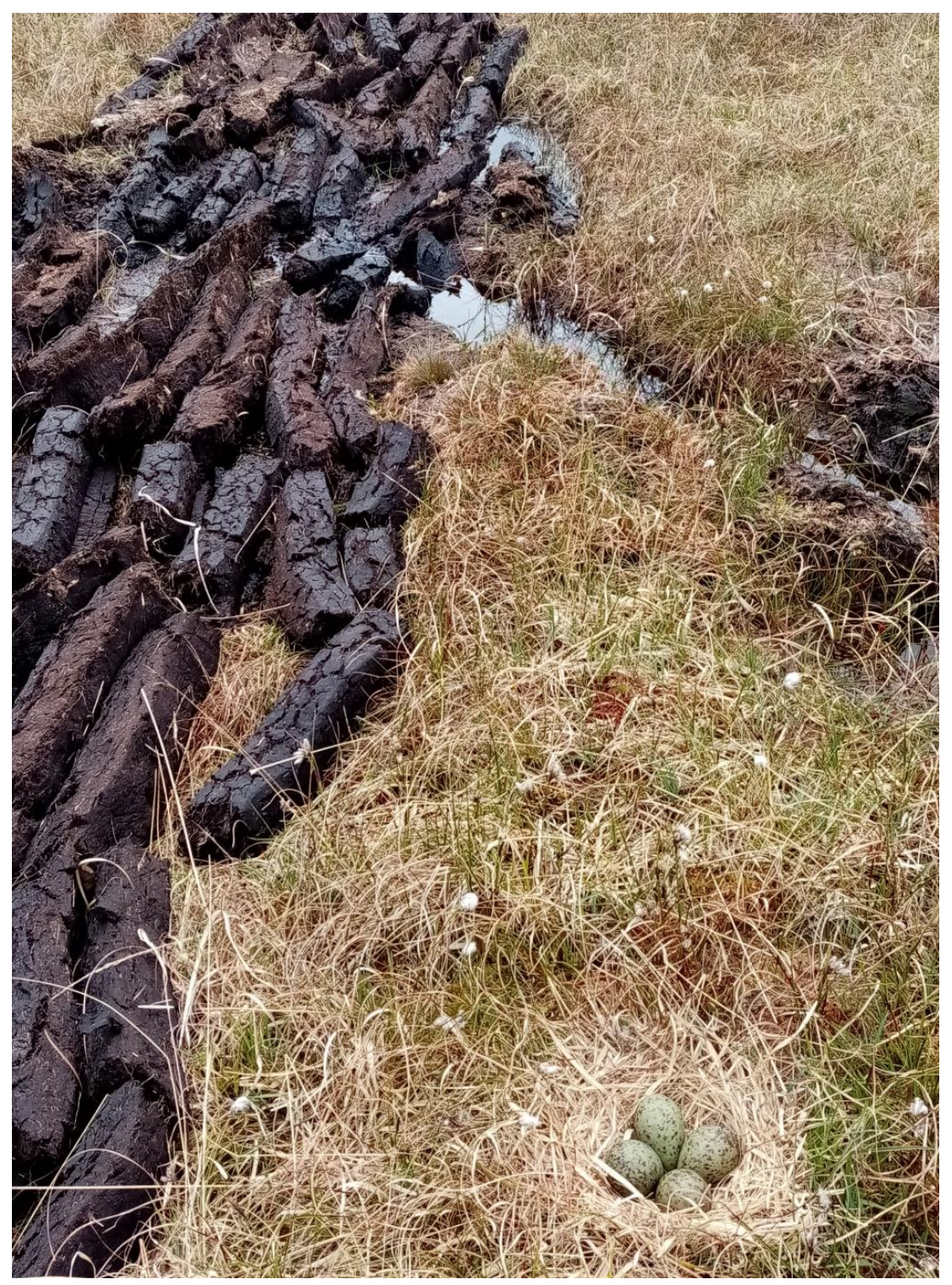
Figure 11. Co. Kerry's only nest, located precariously close to a turf bank

Reviewing results from the CCP to date, over the 2017-2021 period, it is apparent that the lake areas ( North Lough Corrib and Lough Ree ) are the only ones performing consistently well in terms of breeding productivity. The primary ground predators of Curlew eggs and chicks are either not present or easily removed; by the natural barrier afforded by expanses of water surrounding those islands being an obvious asset. That said, several chicks disappeared from island sites without any apparent explanation, possibly relating to avian predation or food or other factors.