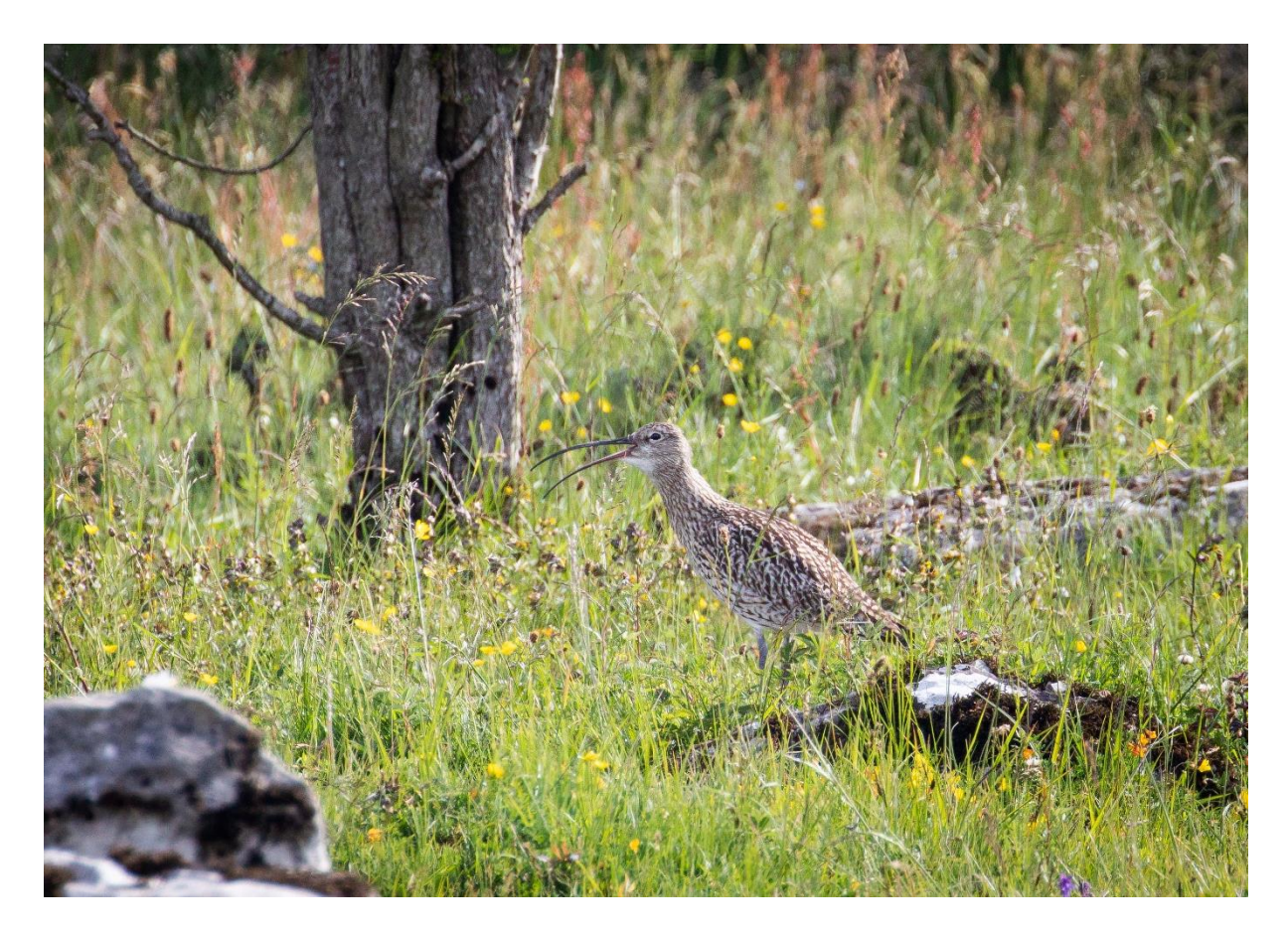
Figure 1. A Curlew calling at Lough Ree

The National Parks & Wildlife Service (NPWS) of the Department of Housing, Local Government and Heritage established the Curlew Conservation Programme (hereafter CCP) in 2017. Since 2020, the Department of Agriculture, Food & the Marine have been partners on the CCP. This brought many positives, including the facility for theprogramme to have a presence in two additional areas, namely the Slieve Aughty Mountains and Laois-Kildare. This brought the total number of Curlew Action Teams operating across the country to nine. This report presents the main points of the Curlew Conservation Programme in 2021.