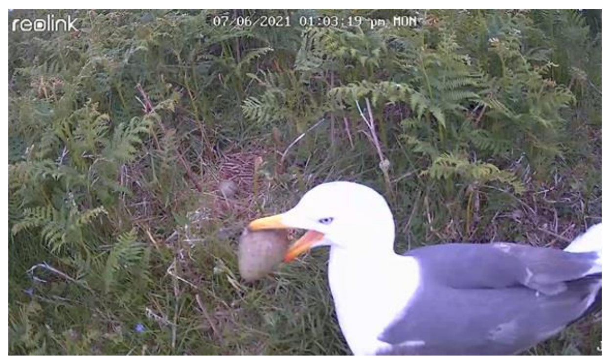
Figure 10. Lesser Black-backed Gull predating a Curlew egg (screenshot from live nest camera)

Nest protection fences have proven beneficial in progressing breeding attempts beyond the egg stage to chick stage. Of a total of 30 breeding attempts protected by fencing to date,22 have hatched chicks, representing a 73% hatching success rate. An interesting observation was made in 2020 by the NPO in County Monaghan, when he noticed (using night vision equipment) that each night for the first couple of weeks of their lives, the male Curlew was brooding his chicks within the nest protection fence, i.e. the family would return to the fence each evening presumably having recognised the safety that it provided them from predators. While fences have proven useful against predation by mammals (e.g. Red Fox, Badger, Pine Marten), they offer no protection against avian predators (e.g. corvids, gulls), and at least two nests were predated in 2021 despite being fenced. One of those incidents was captured on live camera (see figure 10 below). Lesser Black-backed Gulls have previously been suspected of stealing nests in this area and this was proven by the camera in 2021.