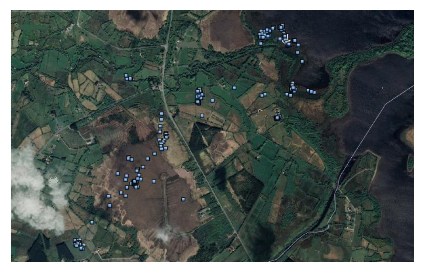
Figure. 6. Example of location data obtained from a satellite tag at a traditional site.