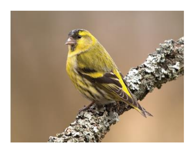
Slide 2: Siskin – Siscín - Spinus spinus