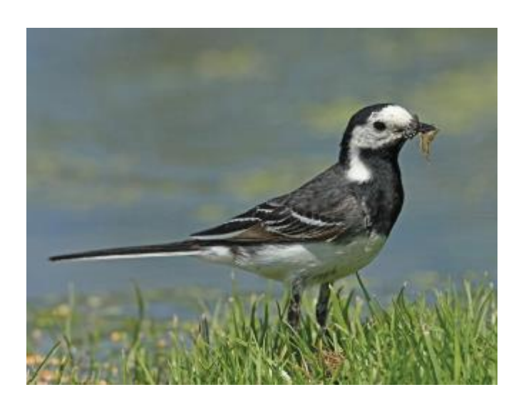
Slide 5: Pied Wagtail - Glasóg Shráide - Motacilla alba