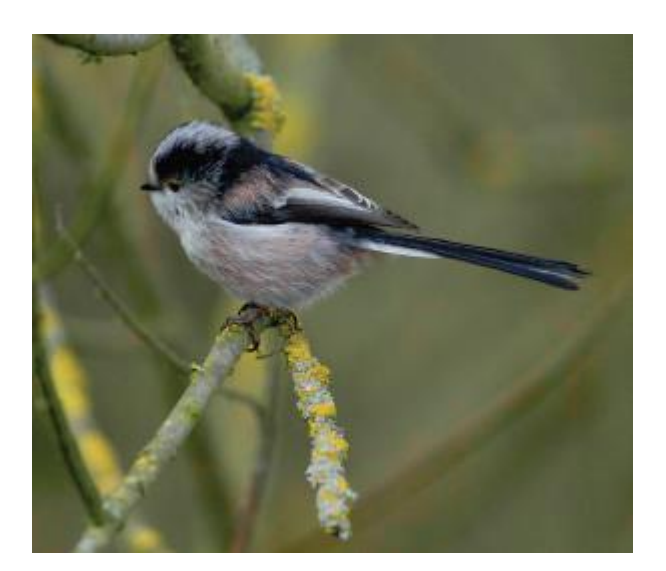
Slide 3: Long-tailed Tit - Meantán Earrfhada - Aegithalus caudatus Identification

Commercial evergreen plantations are least good for wildlife, although some birds, like siskins, love them.