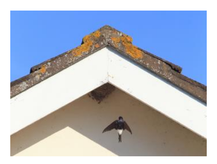
Slide 12: House Martin - Gabhlán Binne - Delichon urbicum Identification