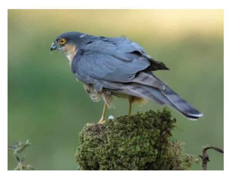
Slide 6: Sparrowhawk – Spioróg - Accipiter nisus Identification