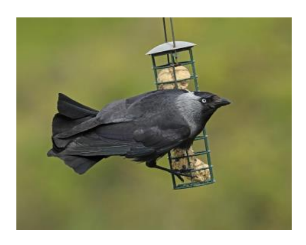
Slide 10: Jackdaw – Cág - Corvus monedula