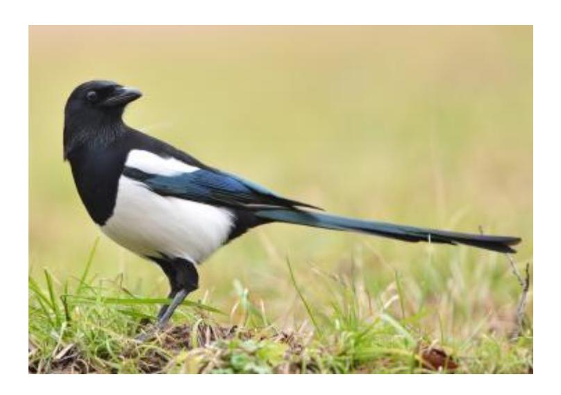
Slide 11: Magpie - Snag Breac - Pica pica Identification