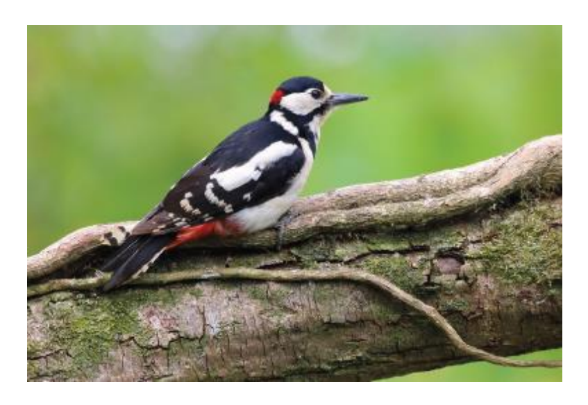
Slide 9: Great Spotted Woodpecker - Mórchnagaire Breac - Dendrocopus major