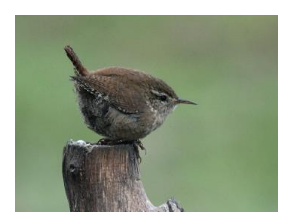
Slide 4: Wren – Dreolín - Troglodytes troglodytes