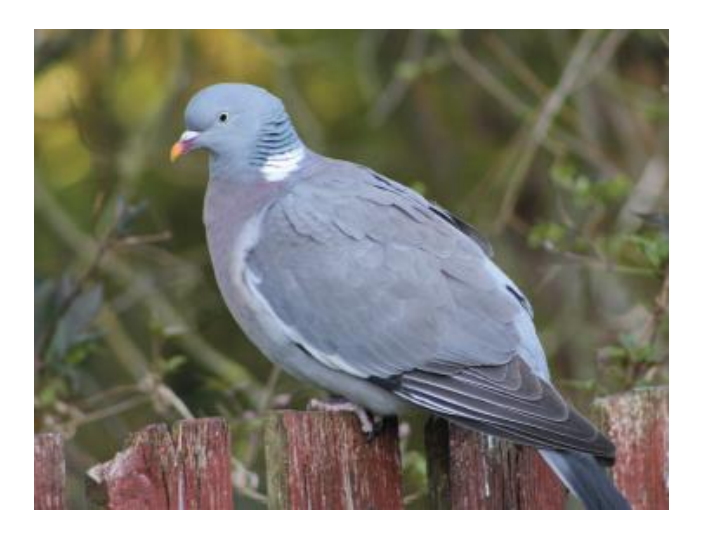
Slide 8: Woodpigeon - Colm Coille - Columba palumbus