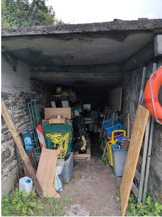
Plate 5. Interior of building 4 in 2025