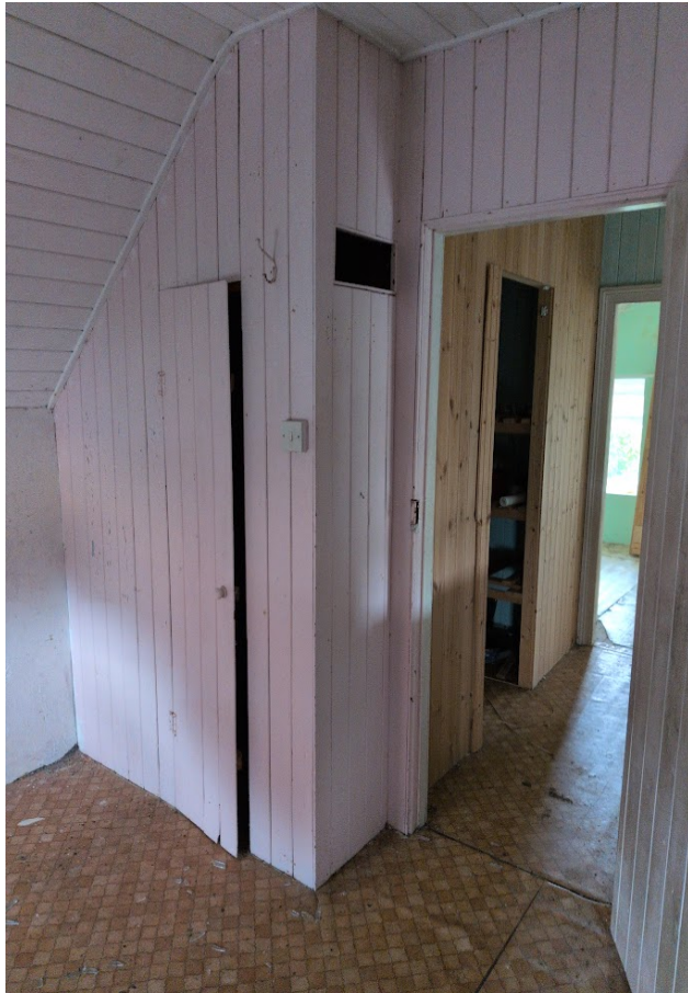
Plate 2 Hot press and cupboard used by Lesser Horseshoe bat.