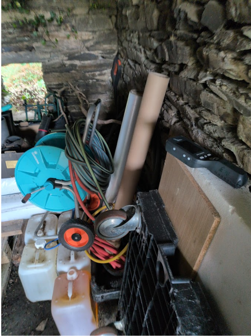
Plate 4. Interior of Building 3