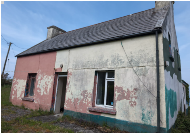
Plate 1. Exterior of Building 1.

A survey of the building on the 22 nd of August 2025 recorded one Lesser Horseshoe in an upstairs hot press where a single bat was also recorded during the day in 2024. An Elekon Batlogger (B18) was left upstairs in situ from August 22 nd to August 23 rd 2025. Only limited bat activity was recorded between 22.41 on August 22 nd and 3.05 on August 23 rd with one faint signal for Lesser Horseshoe Bat at (1.24 on August 23 rd ) and some brief and sporadic signals for Pipistrelle. It is noted that pipistrelle probably emerge from the outside of the building and would not necessarily be picked up on an internal detector. The minimal signals for Lesser horseshoe suggest that outside of its use as a daytime roost for one bat, usage at night was limited in extent.