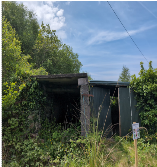
Plate 6. Interior of building in 2024