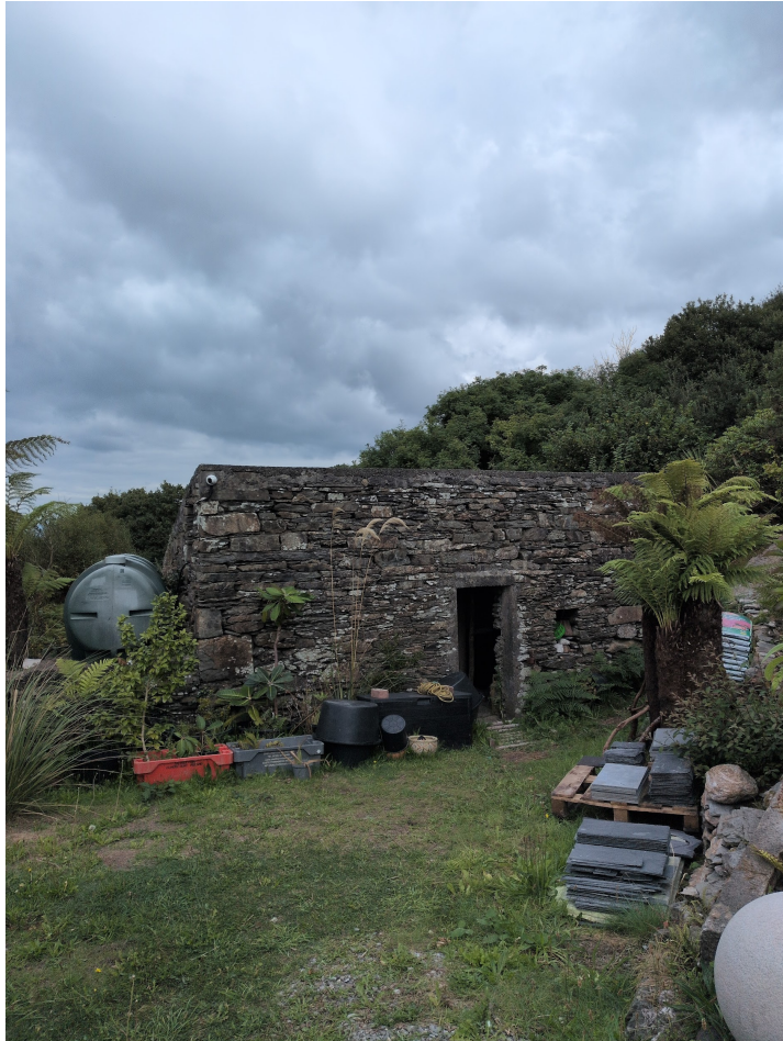
Plate 3. Exterior of Building 3.

The most common species recorded was Lesser Horseshoe bat which was recorded throughout the survey period. The first signal was recorded at 21.09 on August 22 nd and the last signal was recorded at 1.02 on the 23 rd of August 2025. In the intervening period approximately 650 signals were recorded for Lesser Horseshoe bat which indicates continued usage as a night roost.