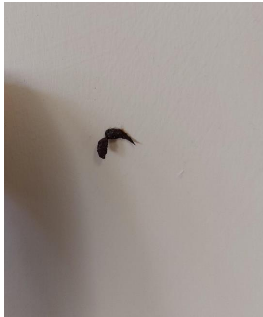
Bat droppings inside Office 7 during October 23 rd inspection