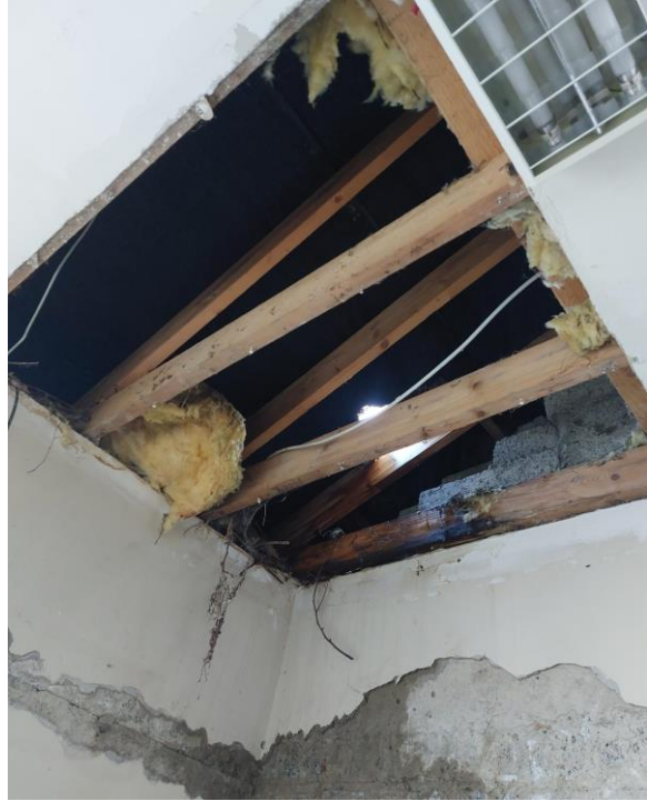
Office 7 ceiling October (pre tile) 2025