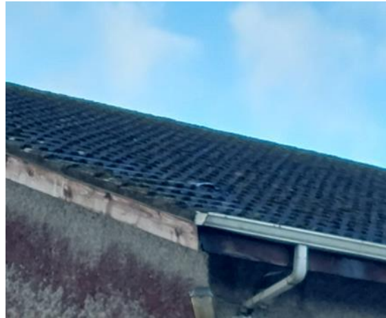
Roof with bat access tile fully installed