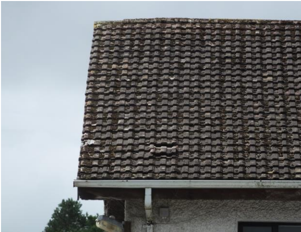
Roof prior to installation