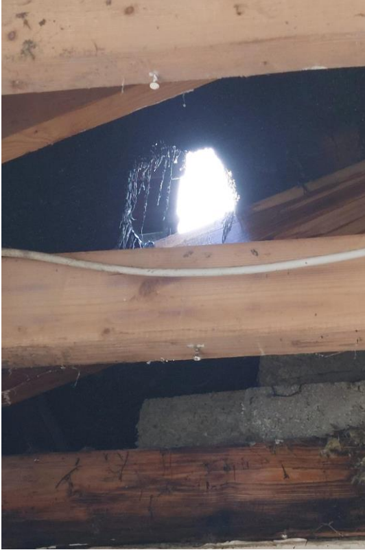
Roof before installation