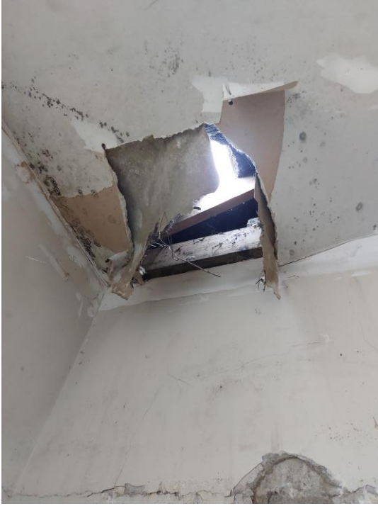
Office 7 ceiling July 2025