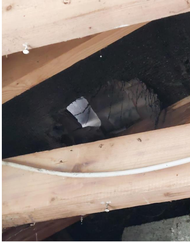
After bat tile installation