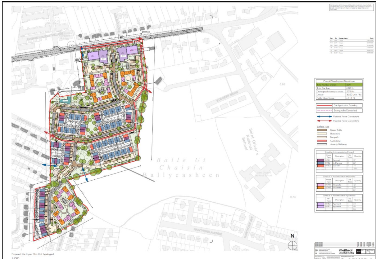
Figure 1-2: LRD Countess Road, Site Layout Plan