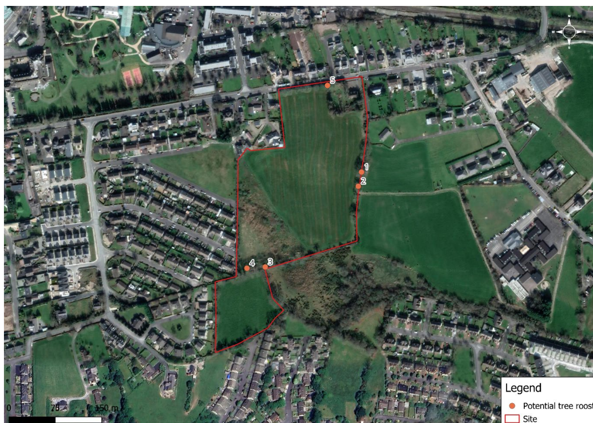
Figure 3-2: Countess Road Residential Development- location of potential tree roosts