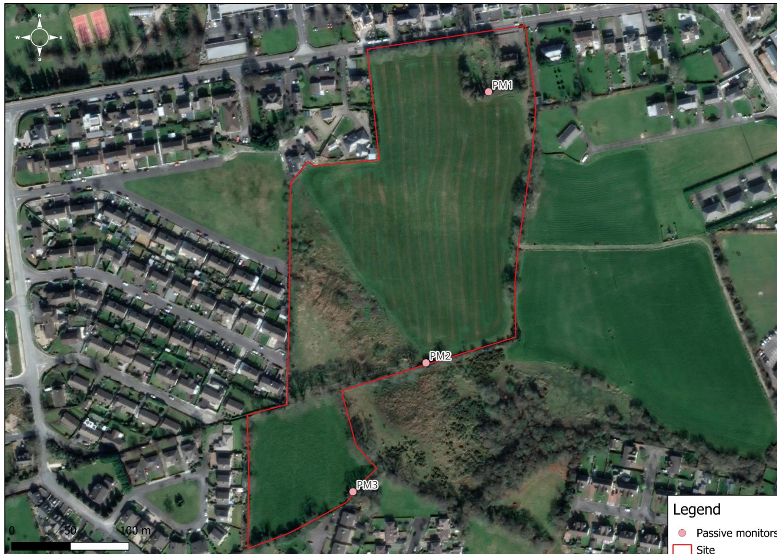
Figure 2-1: Proposed development site at Countess Road- location of passive monitors, 2025