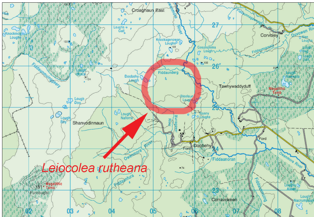
Ordnance Survey of Ireland Licence No EN 0059214 © Ordnance Survey of Ireland Government of Ireland