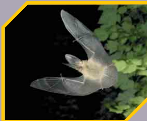
Brown long-eared bat