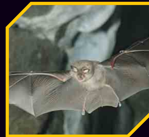
Lesser horseshoe bat