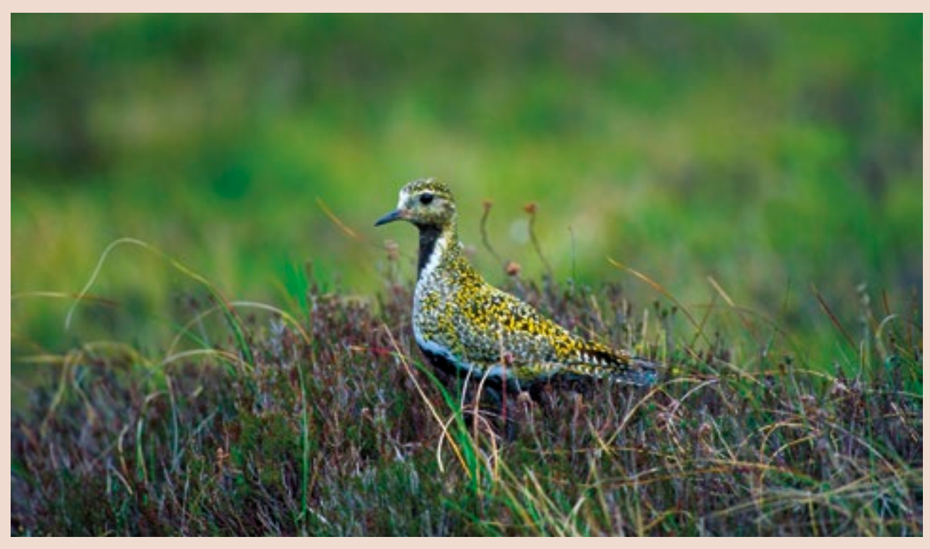
Golden Plover (Pluvialis apricaria)

The development of an overall National Peatlands Strategy arises from the need to take a broad strategic approach to the future management of Ireland's peatlands. Policy gaps and weaknesses in relation to the regulation of activity on Ireland's considerable peatlands (over 20% of the terrestrial area of the State) have resulted in difficulties in meeting EU legal obligations.