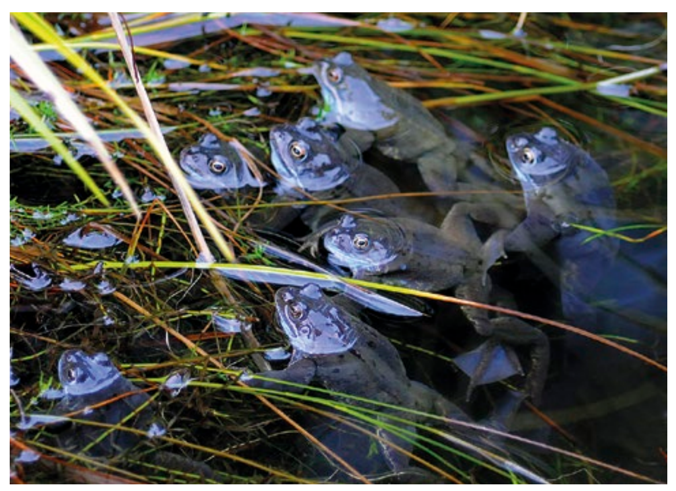
Common frog (Rana temporaria)

75 raised bog Natural Heritage Areas have been formally designated under the Wildlife Acts. The sites were designated in part response to an infringement action brought against Ireland by the EU Commission relating to the application of the Environmental Impact Assessment Directive to the extraction of peat. The Wildlife Acts provide protection to NHAs through a requirement for certain, potentially damaging activities to require Ministerial consent before being undertaken. Turf-cutting, drainage works and afforestation are typically listed as activities that require such consent. Consequently, in the case of afforestation and tree felling there is a dual consent process, as these activities also require the consent of the Minister for Agriculture, Food and the Marine. The derogation that applied to domestic turf-cutting in raised bog SACs was also applied to NHAs and is still in place. These requirements have not, therefore been generally implemented in regard to turf-cutting. Provision is made for the Minister to allow for damaging activities where imperative reasons of overriding public interest exist.