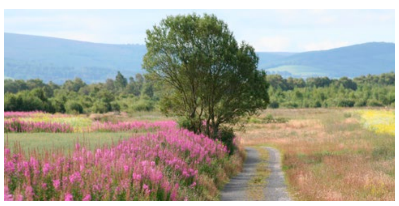
Bord na Móna Restoration Lough-Boora, Co. Offaly