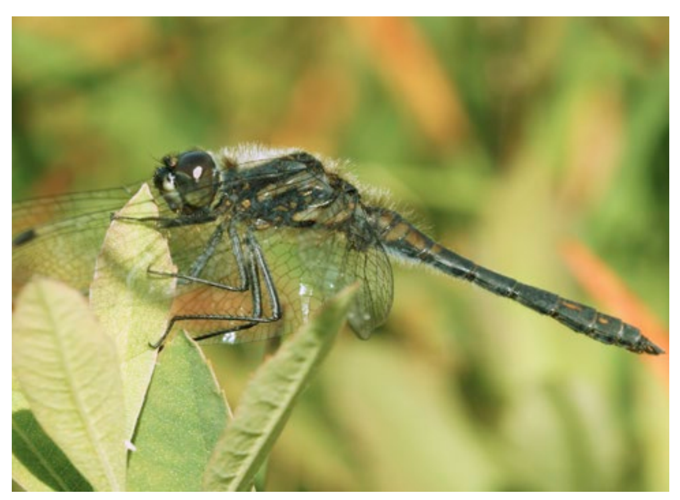
Black Darter (Sympetrum danae)

A way forward is provided for as part of this Strategy. In January 2014, the draft National Raised Bog SAC Management Plan was published along with a comprehensive review of raised bog Natural Heritage Areas (NHAs) and undesignated raised bogs which has informed a radical reconfiguration of our network of NHAs. This will provide for significantly improved conservation outcomes while avoiding areas that are subject to significant turfcutting and will markedly reduce costs for the taxpayer. A number of Bord na Móna owned bogs which have been subject to focused conservation and restoration effort by the Company, will be included in the NHA network. Other sites of conservation value where there is little or no turfcutting pressure will also be included. It is anticipated that many sites that are currently raised bog Natural Heritage Areas will be de-designated as part of this process. This will also assist in underpinning protection of raised bog SACs.