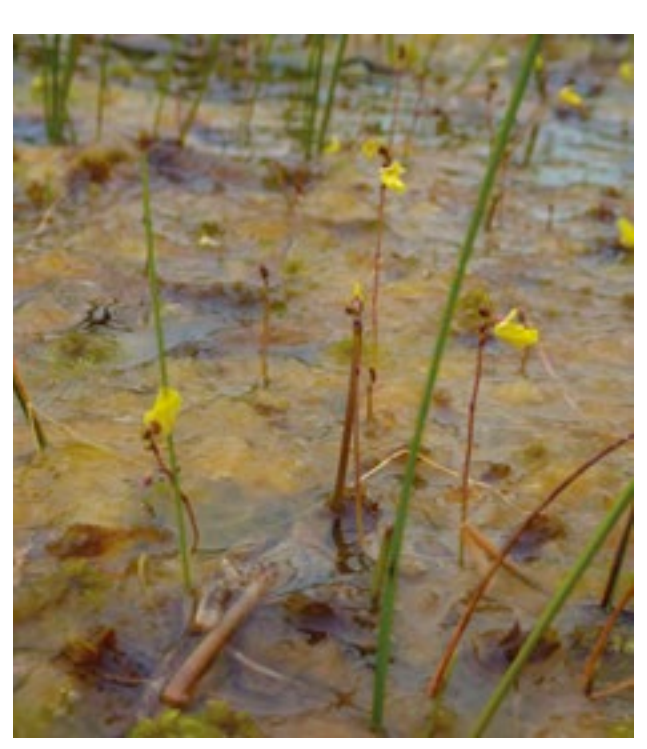
Lesser Bladderwort (Utricularia minor)

Three important international documents dealing with the wise use of peatlands have made specific recommendations on education and training. These are the Joint International Mire Conservation Group and International Peat Society Wise Use guidelines for Global Mires and Peatlands, The International Peat Society Responsible Peatland Management Strategy and the Ramsar Global Action Plan for Peatlands. These documents point to the need to develop and implement mainstream environmental education and training programmes focusing on peatlands. They stress that such programmes should involve not only imparting knowledge and information, but must seek to modify behaviour and develop lifestyles that are harmonious with the wise use of peatlands. This implies that they must be life long and aimed at all sectors of society - citizens, communities, business and industry. At national level the Irish Peatland Conservation Plan 2020, prepared by the Irish Peatland Conservation Council makes a number of strategic recommendations for Government on environmental education.