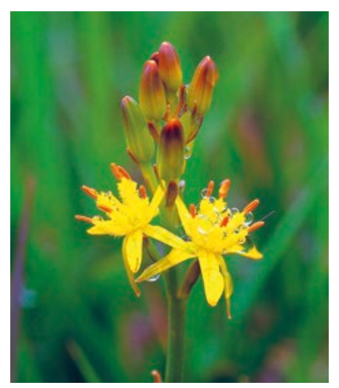
Bog Asphodel (Narthecium ossifragum)

Peatlands have been in the Irish landscape since the last lce Age and, together with remnants of primeval forests, they form our oldest surviving ecosystems. Irish peatlands are the country's last great area of wilderness, hovering between land and water, providing unusual habitats for their unique and specialist flora and fauna. They cover a large area of the land surface, occurring as raised bogs, blanket bogs or fens and form distinctive landscapes in many parts of the country.