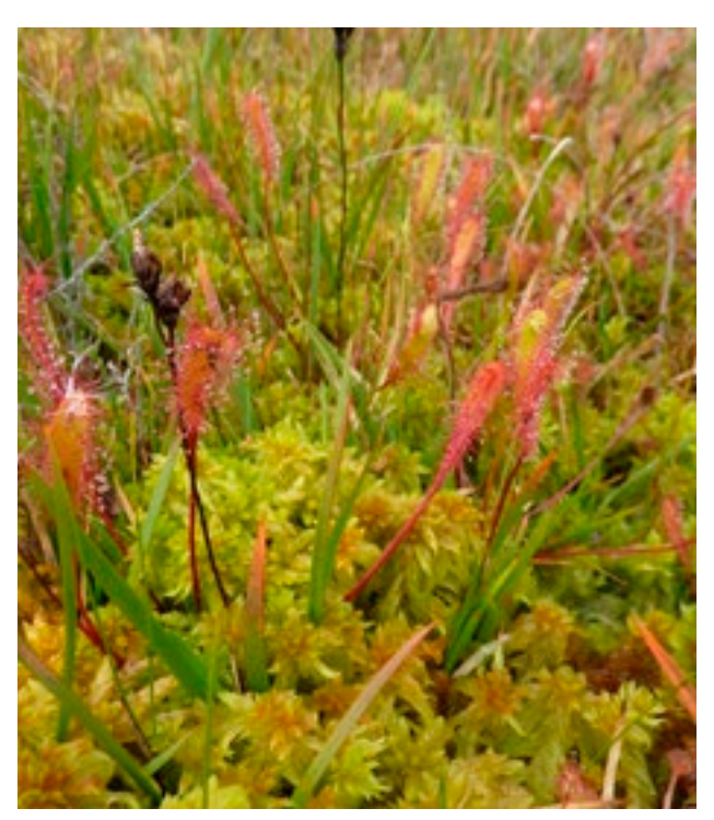
Great Sundew (Drosera anglica)

Bogs are also home to many rare and protected plants. Typical bog plants include sphagnum mosses, rushes and sedges, bog cotton, ling heather, bog rosemary, bog asphodel and sundew.