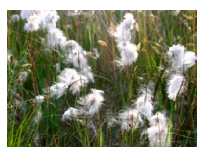
Bog Cotton (Eriophorum angustifolium)

Legal requirements in relation to peat extraction and the planning process have evolved since the planning system was introduced in October 1964. Developments since 1990 have been extensive but some of the main changes are summarised below.