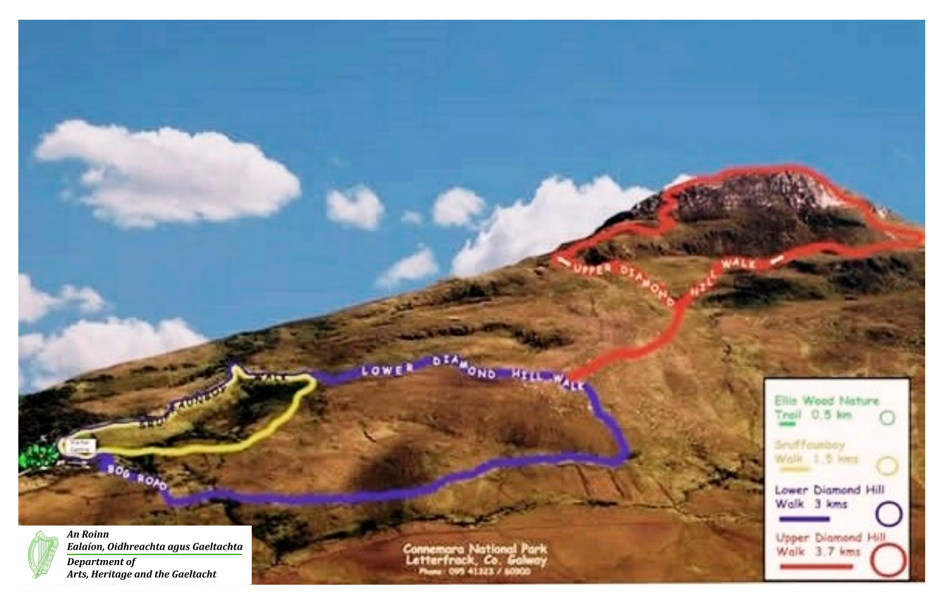
Diamond Hill Walking Trails, Connemara National Park