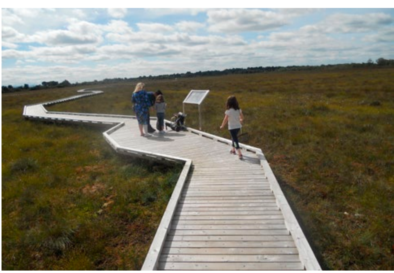
Clara Bog Boardwalk, Co. Offaly.

Relevant public authorities will review their activities and approaches in regard to education and public awareness of the value and uses of peatlands and will outline the outcome of their review to the Peatlands Strategy Implementation Group. The Peatlands Group, in consultation with the Peatlands Council will assess current activities, including those of NGOs, and make recommendations to Government regarding further measures that may be required to inform the public of the economic, social and environmental benefits of responsible peatlands management. The recommendations of the Bogland Report will be considered by the Peatlands Group in this context.