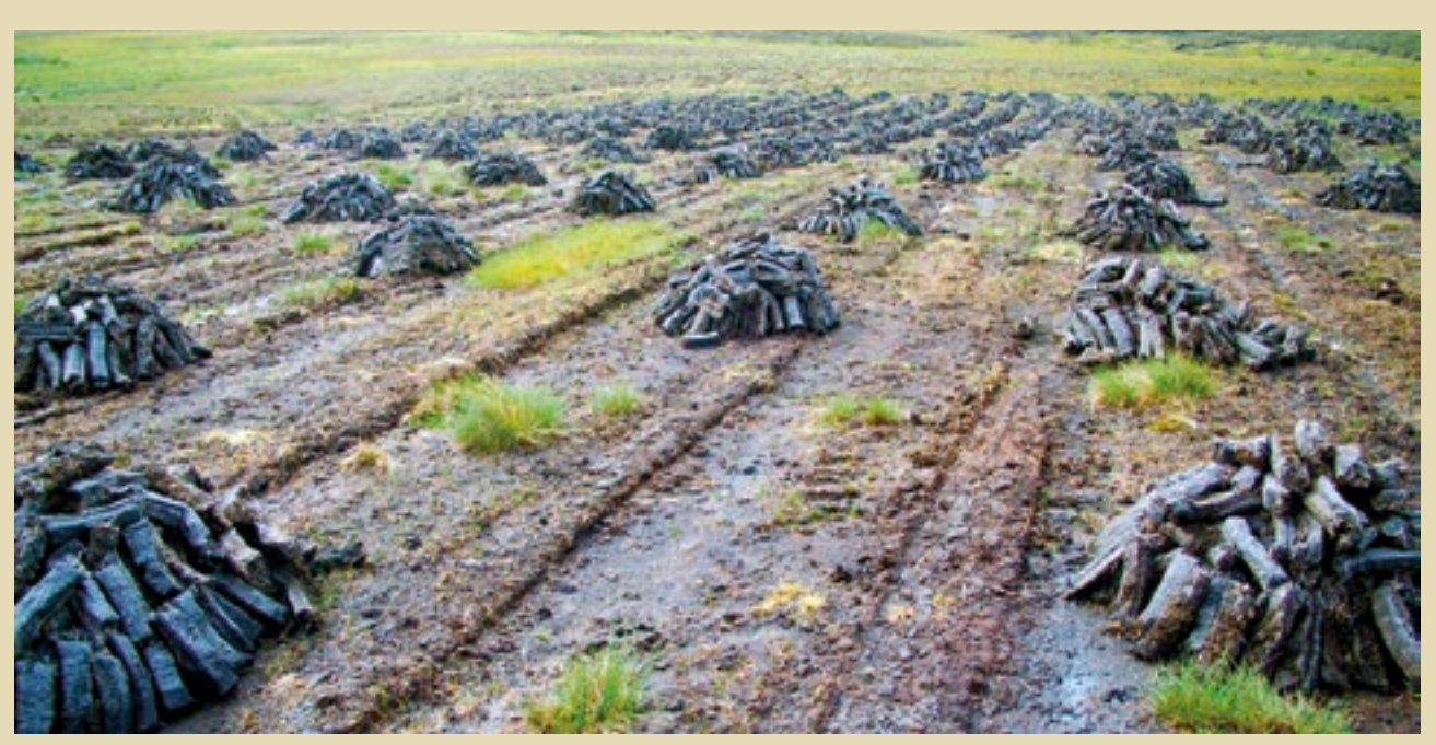
Turf cutting, Sheeffry Hills, Co. Mayo

Peatlands are wetland ecosystems that are characterised by the accumulation of organic matter called peat which derives from dead and slowly decaying plant material under wet conditions. Irish peatlands are principally bogs with a small proportion of fens. Both bogs and fens appear in natural condition but the majority have been modified by man.