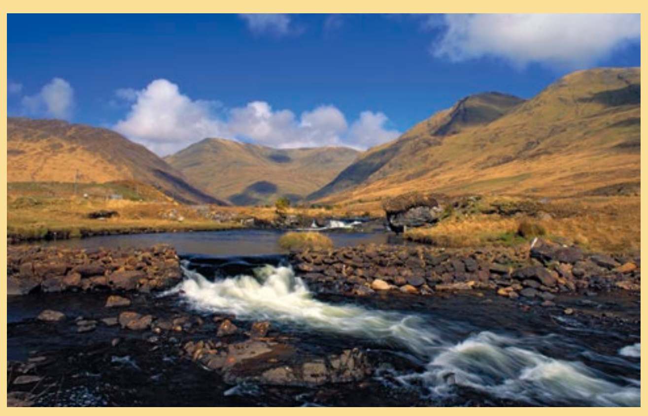
Delphi Valley, Co. Mayo.

Peatlands have been used for afforestation, domestic and industrial turf-extraction, grazing and agricultural reclamation and have been used for various types of infrastructural development. Ireland's peatlands can continue to host such activities into the future. In the 20th century large-scale peat production on raised and blanket bogs was undertaken by Bord na Móna, which was established by the State for that purpose and which is now focused mainly on the drained, raised bogs of the Irish midlands. These activities continue to contribute significantly to economic development by supporting employment both directly and indirectly as well as providing a secure source of indigenous energy. Many Irish peatlands were also drained and reclaimed for agricultural use and forestry. More recently, there has been a growing awareness and appreciation amongst policy makers and the general public of the other values of functioning bogs and the benefits that they provide.