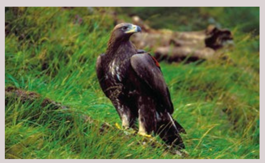
Golden Eagle (Aquila chrysaetos)

To date, LIFE projects in Ireland have included the reintroduction of the Golden Eagle and two restoration projects for Raised and Blanket Bogs. Further details of all projects are available at http://ec.europa.eu/life.