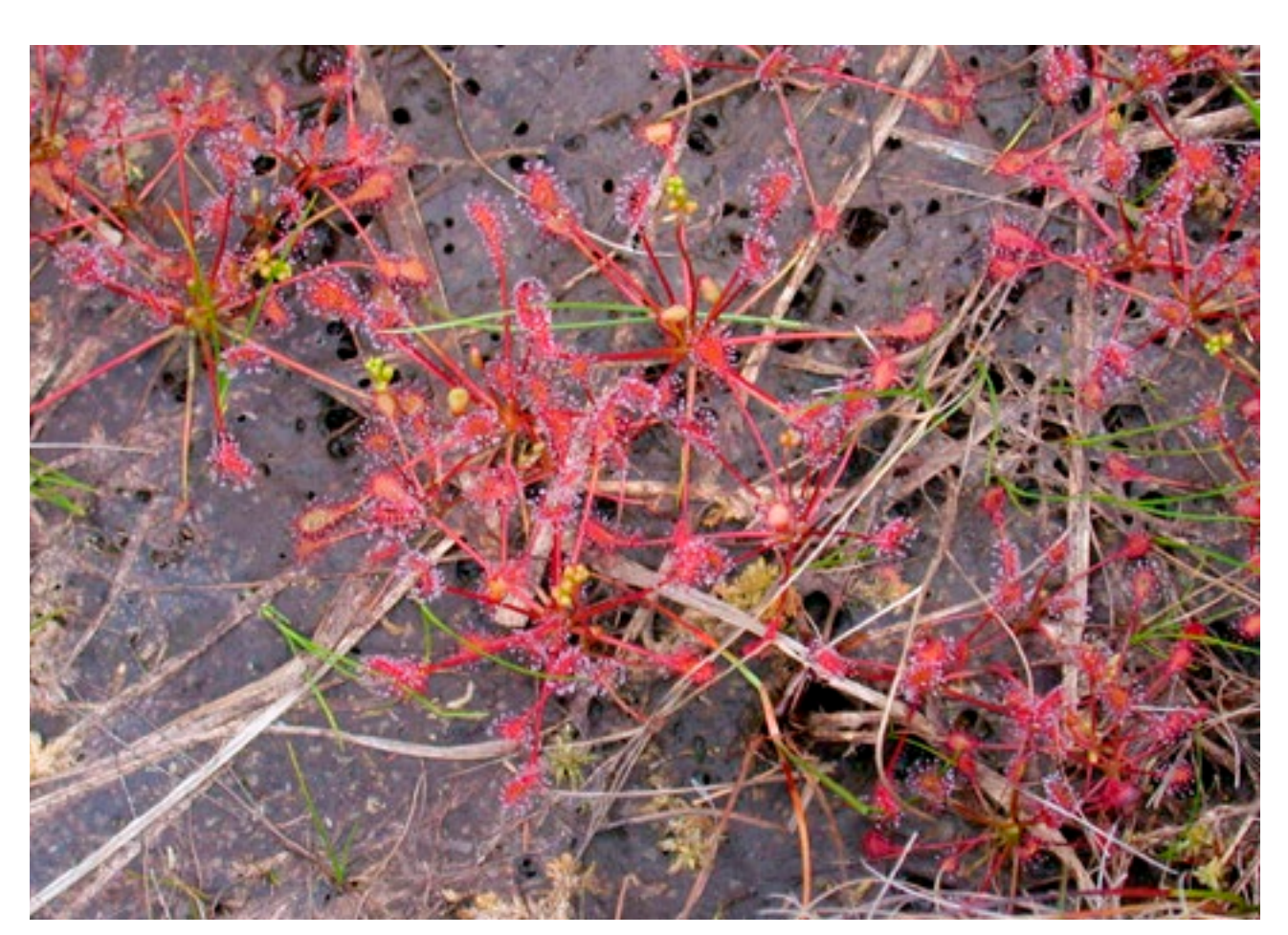
Round Leafed Sundew (Drosera rotundifolia)