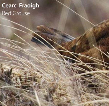
Cearc Fraoigh Red Grouse